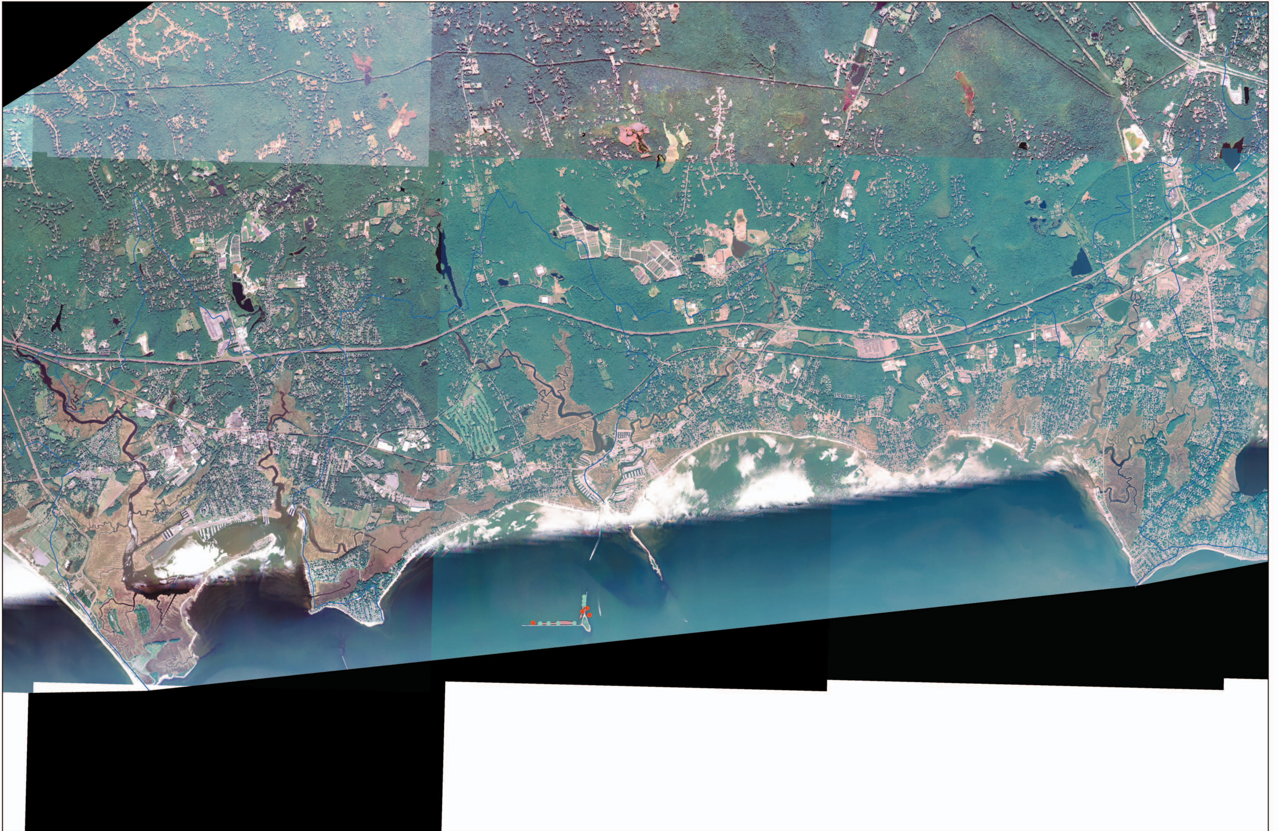
Study Area Locus Map

Clinton Bay/Westbrook Harbor/Duck Island Roads Sub-basins