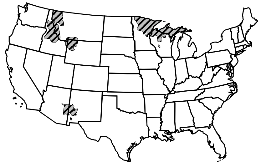
Current range and Mexican wolf recovery area

Gray wolves once ranged over most of the lower 48 states. They were only absent from a portion of California, the southwest corner of Arizona and from the red wolf range in the southeastern United States. By the time gray wolves were listed as an endangered species, their breeding range had been reduced to a small corner of northeastern Minnesota and Isle Royale, Michigan. Individual wolves were periodically observed in the west, but there were no breeding packs. Recovery efforts have since restored the wolf to many areas of its historical range, including portions of the southwest, the Rocky Mountains and the western Great Lakes region.