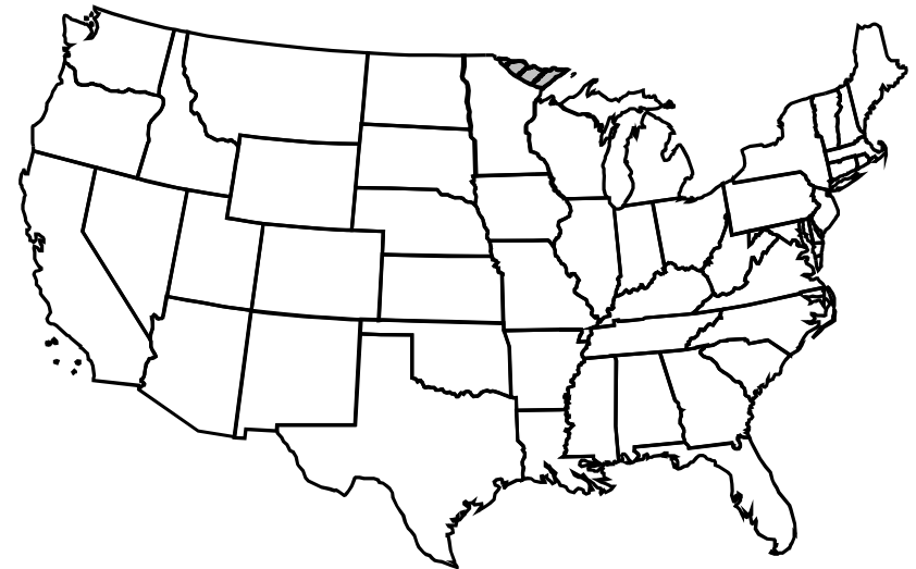
Range at time of listing as endangered

Gray wolves once ranged over most of the lower 48 states. They were only absent from a portion of California, the southwest corner of Arizona and from the red wolf range in the southeastern United States. By the time gray wolves were listed as an endangered species, their breeding range had been reduced to a small corner of northeastern Minnesota and Isle Royale, Michigan. Individual wolves were periodically observed in the west, but there were no breeding packs. Recovery efforts have since restored the wolf to many areas of its historical range, including portions of the southwest, the Rocky Mountains and the western Great Lakes region.