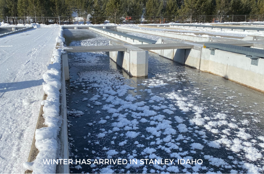
WINTER HAS ARRIVED IN STANLEY, IDAHO