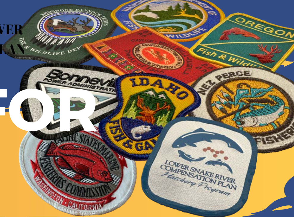
MATT HOW GRAPHIC - USFWS