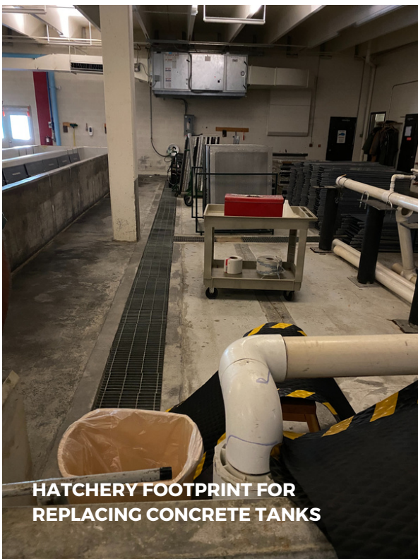
HATCHERY FOOTPRINT FOR REPLACING CONCRETE TANKS

Fast-forward 30 years, and the missing concrete vats are a puzzle piece that could potentially help Sawtooth Fish Hatchery come closer to meeting its Spring Chinook goals. This project is a top priority for FY23 and work has begun to ensure replacement meets engineering and hatchery operation requirements. With a little luck, you may see these tanks back in Chinook action by Brood Year 23'.