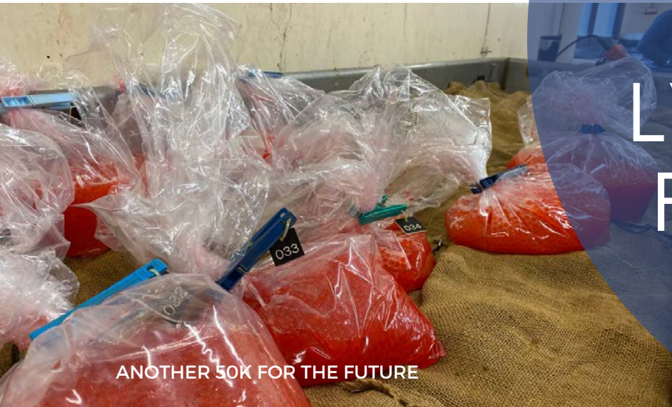
ANOTHER 50K FOR THE FUTURE