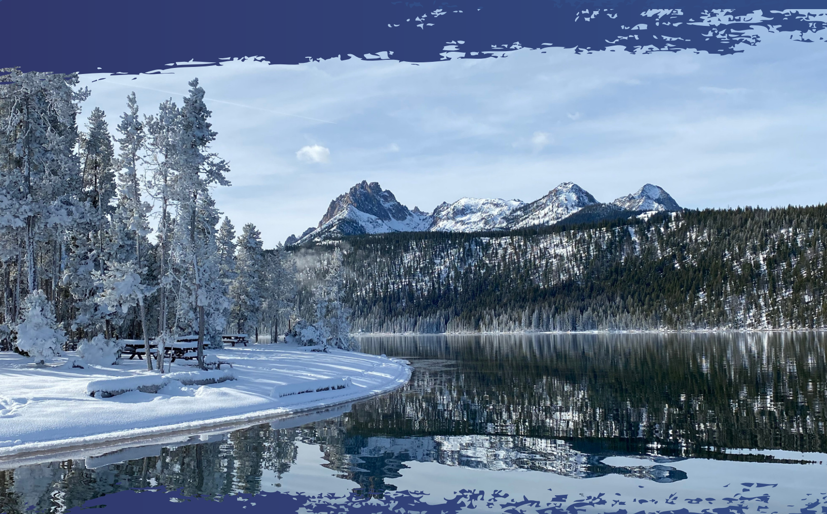
REDFISH LAKE - STANLEY, IDAHO