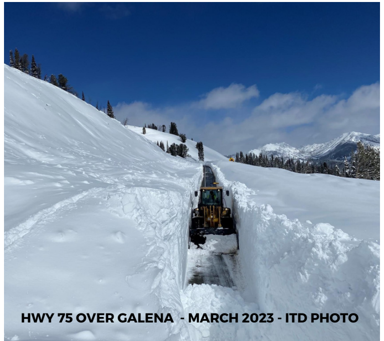
HWY 75 OVER GALENA - MARCH 2023