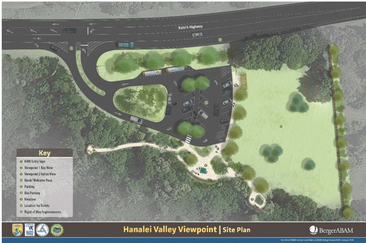
Figure 3. Hanalei Viewpoint Site Plan