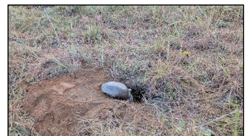
Gopher tortoise and burrow.

PROTECTED STATUS. The eastern indigo snake is protected by the USFWS, Florida Fish and Wildlife Conservation Commission, and Georgia Department of Natural Resources. Any attempt to kill, harm, harass, pursue, hunt, shoot, wound, trap, capture, collect, or engage eastern indigo snakes is prohibited by the U.S. Endangered Species Act. Penalties include a maximum fine of $25,000 for civil violations and up to $50,000 and/or imprisonment for criminal offenses. Only authorized individuals with a permit (or an Incidental Take Statement associated with a USFWS Biological Opinion) may handle an eastern indigo snake.