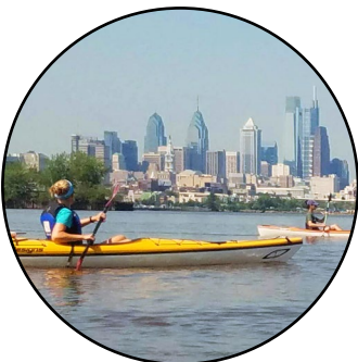
Left to right: Volunteers installed native plants to serve as pollinator habitat / Caesar Rodney School District; Large machinery was used to remove the Lenape Dam along the Brandywine River / Brandywine Red Clay Alliance; Kayaker enjoying views of Philadelphia / National Wildlife Federation.

To learn more about the Fish and Wildlife Service’s DRBRP visit bit.ly/30MmkvD or NFWF visit bit.ly/44cW0QQ . *All statistics and figures include BIL funds.