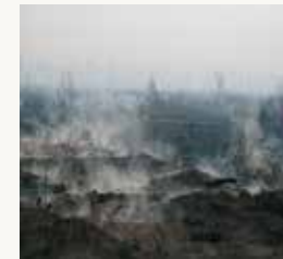
Lateral West Fire/USFWS

Severe wildfires have also left a mark on the swamp. In 2008, the South One Fire lasted 121 days and burned 4,8000 acres. It was followed in 2011 by the Lateral West Fire, which burned 6,300 acres.