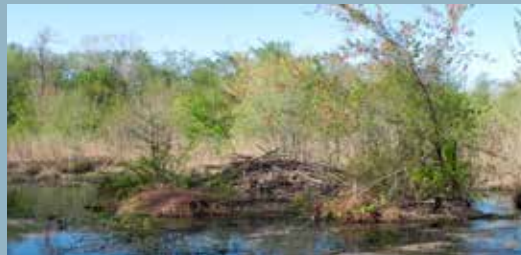
Beaver Lodge in Cypress Marsh

The Cypress Marsh is home to several beaver lodges, including one that is visible from West Ditch Road. Look for river otters, turtles, wood ducks, great blue herons, mallards, and especially in the spring, many varieties of songbirds.