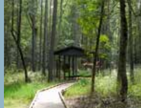
Underground Railroad Boardwalk

The Dismal Swamp maroon story is also a featured exhibit in the National Museum of African American History and Culture on the National Mall in Washington, DC.