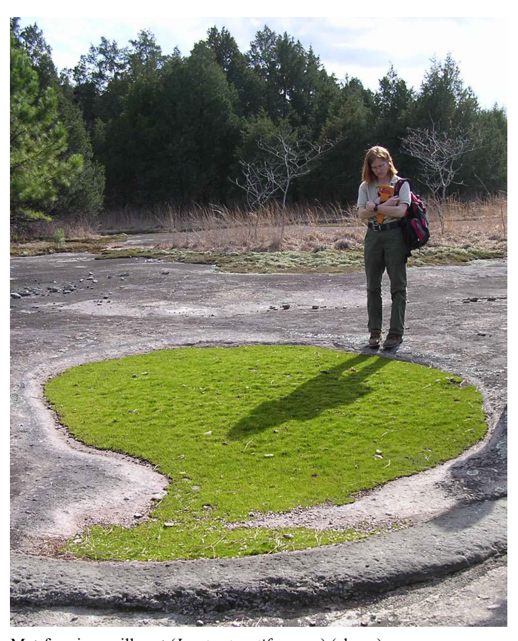
Mat-forming quillwort (Isoetes tegetiformans) (above)

These three plant species grow in shallow, ephemeral pools on granite outcrops. Granite outcrops are found in the Piedmont region of Alabama, Georgia, and South Carolina. The pools have sandy, low nutrient soils and hold water for periods in the winter and spring. Little amphianthus grows, blooms, and sets seeds during this short period when the pools hold water. This is the most common of the three species, occurring on many of the outcrops throughout the state.