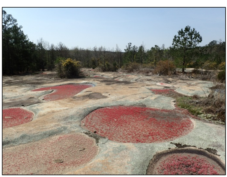
Little amphianthus (Amphianthus pusillus) (above)

The two quillwort species tend to occur in pools that are deeper and hold water for longer periods. Mat-forming quillworts are known from the eastern portion of the state on outcrops with an underlying porphyritic granite geology. Black-spored quillwort occurs in the central and western portion of the state on outcrops with an underlying granitic gneiss or non-porphyritic geology.