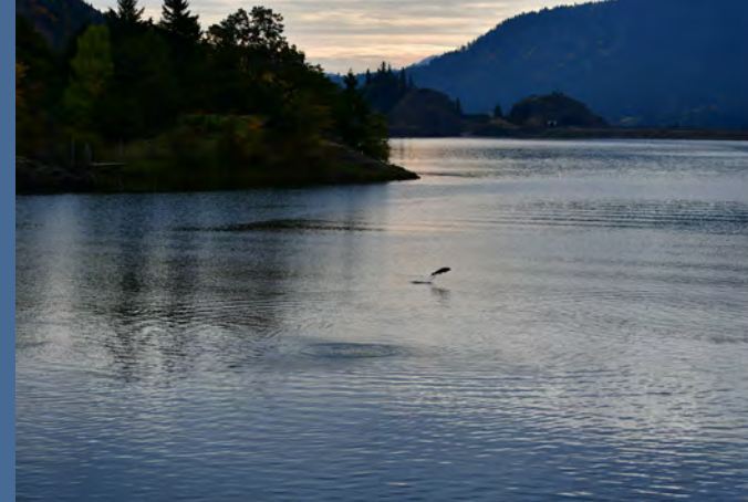
Salmon jumping in Drano Lake, Washington.