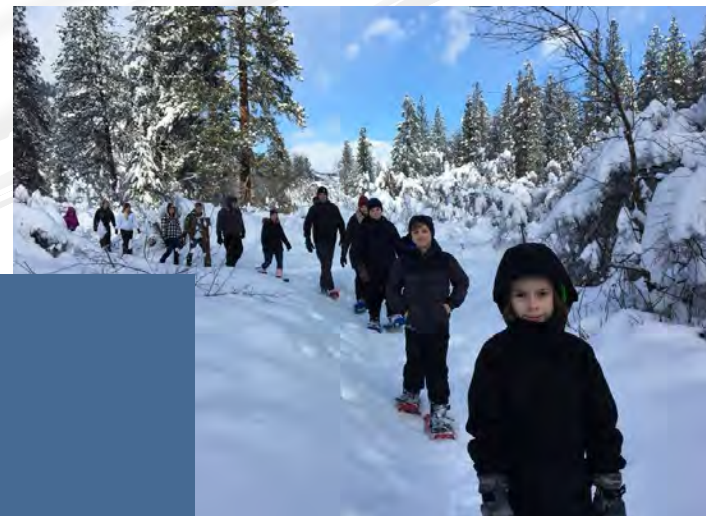
A snowshoeing tour at Leavenworth National Fish Hatchery.

Hunters, anglers, and outdoor enthusiasts are the backbone of conservation. We serve as a bridge between natural resources and recreation. From raising and releasing fish to teaching the joy of fishing and target shooting, we ensure that conservationists of all ages and abilities can connect to nature.