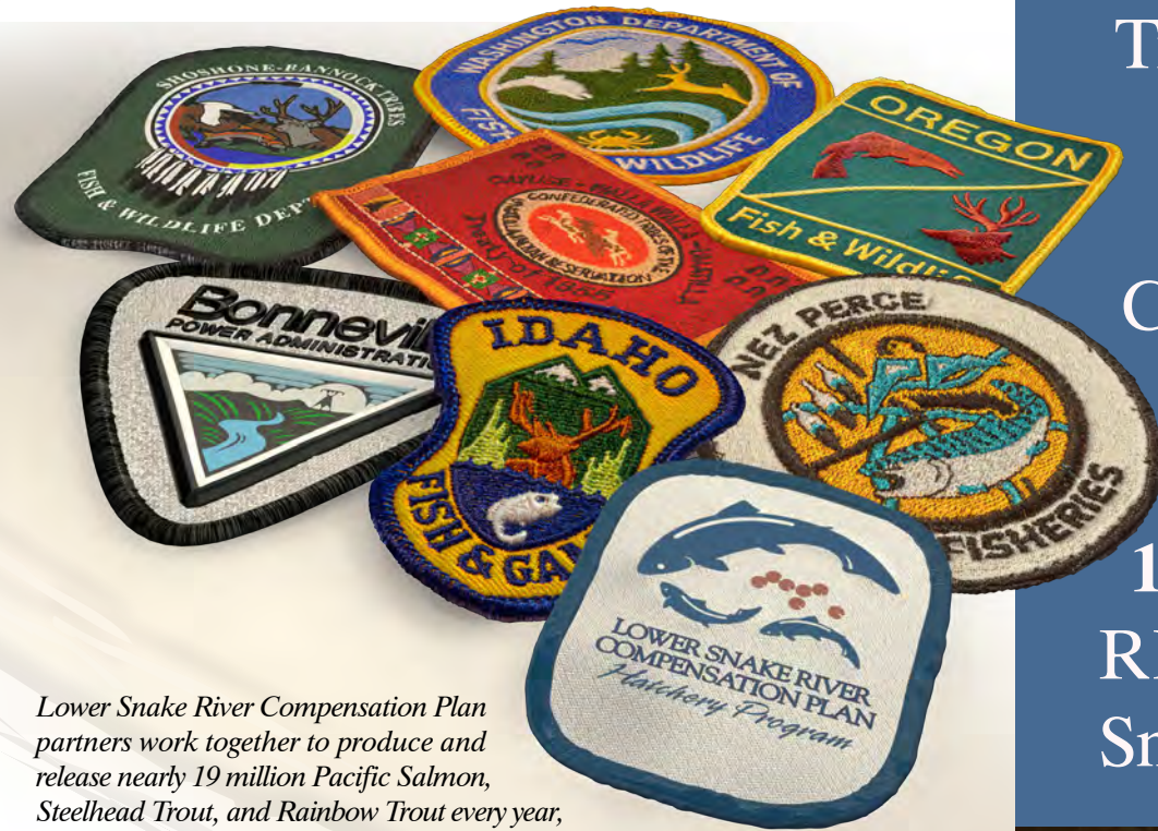
Lower Snake River Compensation Plan partners work together to produce and release nearly 19 million Pacific Salmon, Steelhead Trout, and Rainbow Trout every year, monitor fish health, and evaluate the program's hatchery operations. 3D Graphics: Matt How/USFWS

Equitable ocean harvests of Pacific salmon provide the United States, Canada, and tribal nations with billions of dollars in revenue, thousands of jobs, and cultural connections for people that have fished in the region since time immemorial. The Service, in collaboration with the States of Alaska, Washington, and Oregon, the Northwest Indian Fisheries Commission, Columbia River Inter-Tribal Fish Commission, area tribes, and NOAA-Fisheries, provided technical and policy support that helped the Pacific Salmon Commission in 2018 develop a 10-year conservation and harvest plan and re-negotiate Coho and Chum Salmon Annexes under the Pacific Salmon Treaty. Service science and data, which includes the annual release of over 43 million hatchery fish and Coded-Wire Tagged returning adults, also helps West Coast States establish their own harvest management regulations and better protect ESA-listed stocks.