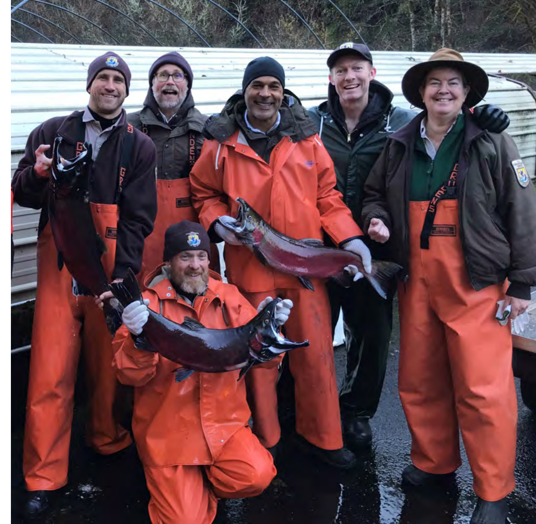
Staff from Eagle Creek National Fish Hatchery, the Columbia River Fish and Wildlife Conservation Office, Columbia River Gorge Complex, and Regional Office during one of the hatchery's Coho Salmon spawning days.