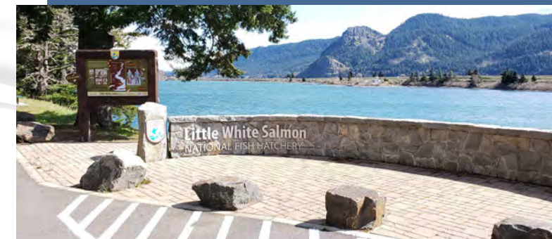
Little White Salmon National Fish Hatchery entryway with improved road access and signage.

The hatchery, which produces 9.4 million salmon annually, also added visitor information kiosks, expanded sidewalk access, picnic facilities, and additional parking during improvements to its one-mile entrance road adjacent to Drano Lake's western shoreline. Upgrades also include a new entrance gate and interpretive walking trail with engraved basalt guideposts showcasing the hatchery property's natural and cultural history.