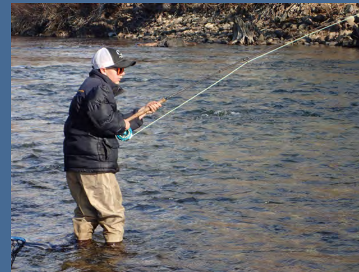
An angler fishes in the Methow River. In 2019 the Service finalized Fishing Plans for Spring Creek, Little White Salmon, Leavenworth, and Entiat National Fish Hatcheries.