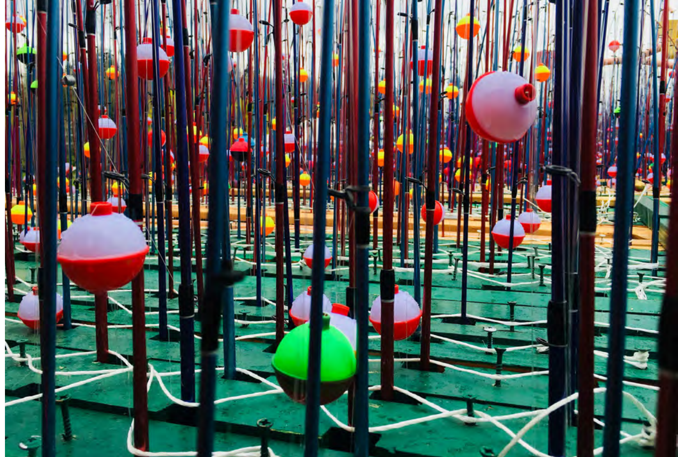
Klineline Pond Kids Fishing Day.

167 EVENTS or activities promoting fishing, hunting, access