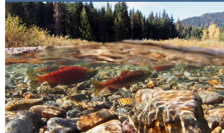
Sockeye Salmon.