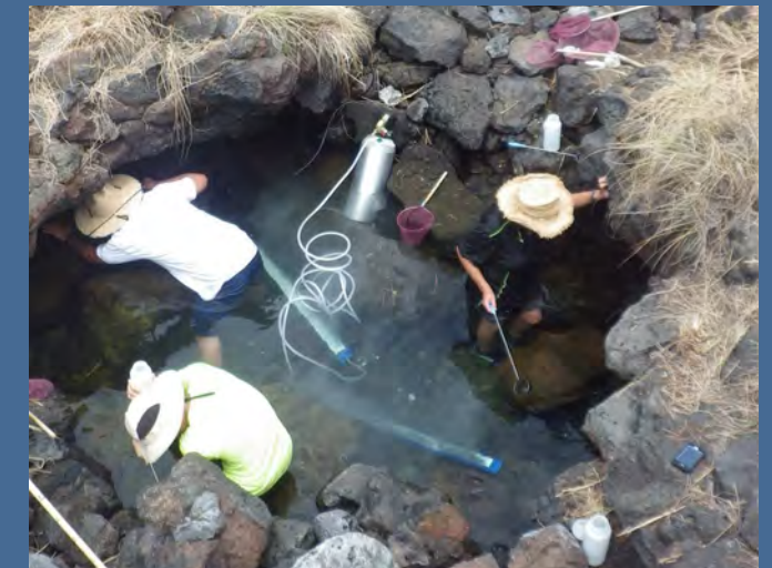
Removing invasive species and biosolids from anchialine pool.