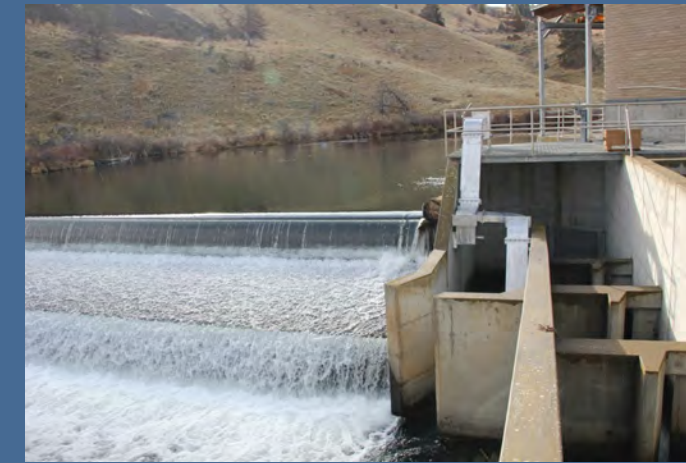
Warm Springs National Fish Hatchery's energy network received several upgrades in 2018-2019. The hatchery also installed at Lamprey Passage System in 2018 that helps adult Pacific Lamprey access to the Upper Warm Springs River.

The hatchery's two emergency generators --installed in 1976 -- were also replaced to increase energy efficiency and ensure that full backup power is available when needed. The upgrades are vital for a facility that annually raises 750,000 Chinook Salmon in a high desert environment where yearly temperatures fluctuate between subfreezing and triple digits.