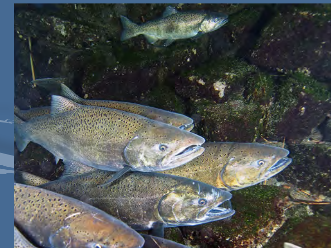
Chinook salmon.

The Pacific Region has adopted the Fish Inventory System (FINS) as its single regionwide database for storing fish culture data for its 14 National Fish Hatcheries. Transition to FINS, an Internet-based system, provide the foundation for substantially improving our ability to manage and share with partners the Columbia - Pacific Northwest Region's hatchery data in a more holistic, effective, efficient, and timely manner.