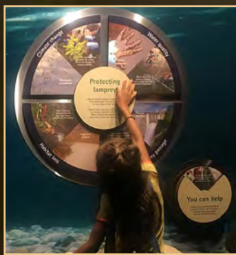
In 2019, the Service, Oregon Zoo, and eight Northwest Tribes worked together to establish the Northwest's first full-fledged exhibit highlighting the ecological and cultural importance of Pacific Lamprey.

176 PARTNERS in the Pacific Lamprey Conservation Initiative