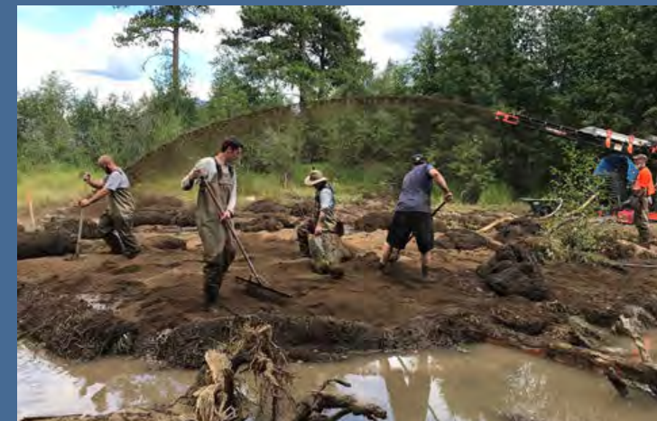
Restoring wetlands and stream habitat at Hancock Springs.