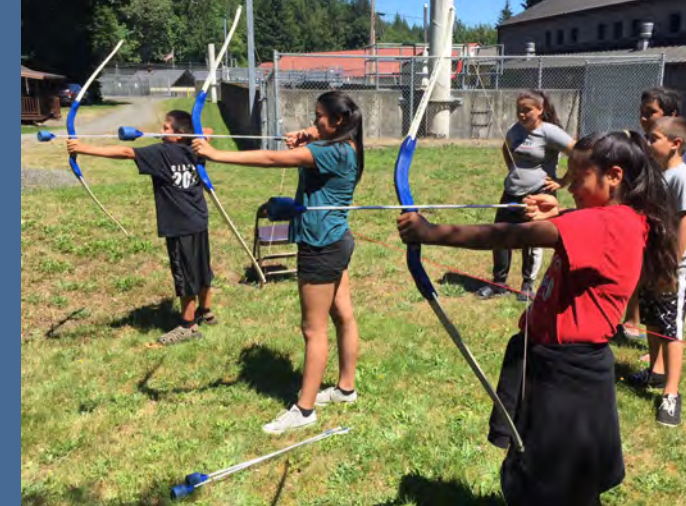
Campgoers take aim at aquatic invasive species targets during the 10th annual Youth Fisheries Academy.

Leavenworth also hosts Camp Biota, an outdoor skills and science camp co-developed for Spanish-speaking migrant middle schoolers by hatchery staff and Washington's North Central Educational Services District. Now in its third year, the program graduated its first 20 students in 2018, many of whom had never before camped, practiced archery lessons, or visited a hatchery.