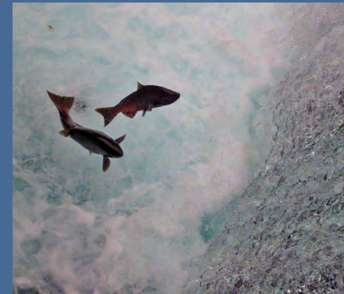
Adult spring Chinook Salmon.

The extra time allows staff to clean raceways and release yearlings before 'ponding' the new fry outside, which reduces the amount of feeding required, lowers overall fish numbers in outside raceways, and decreases moving stress on young salmon. Less phosphorous entering the creek helps the hatchery address compliance requirements under its new National Pollutant Discharge Elimination System permit.