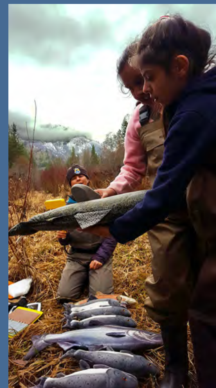
Students at Camp Biota, which is hosted at Leavenworth National Fish Hatchery every spring.

173,000 Annual Visitors to our facilities