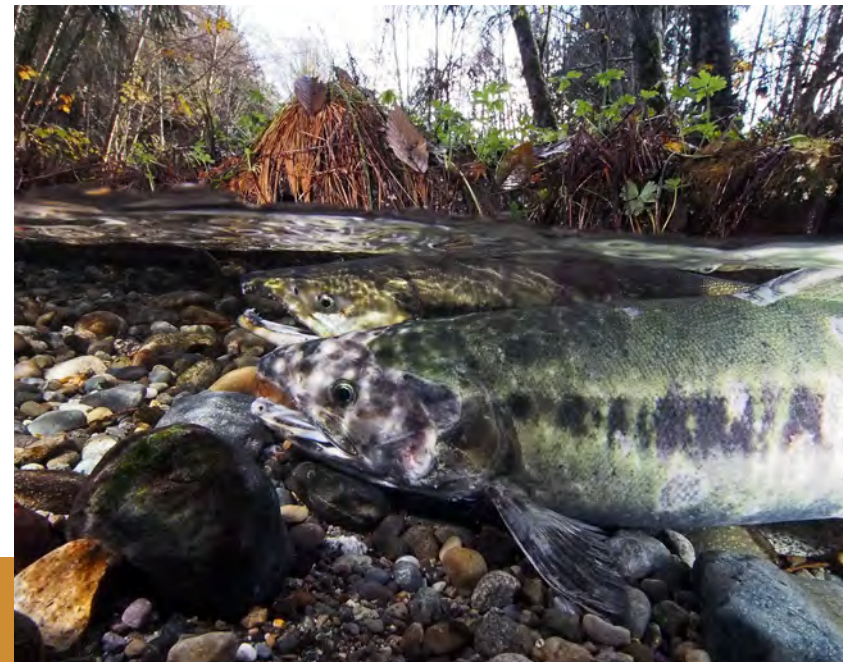
Chum Salmon.