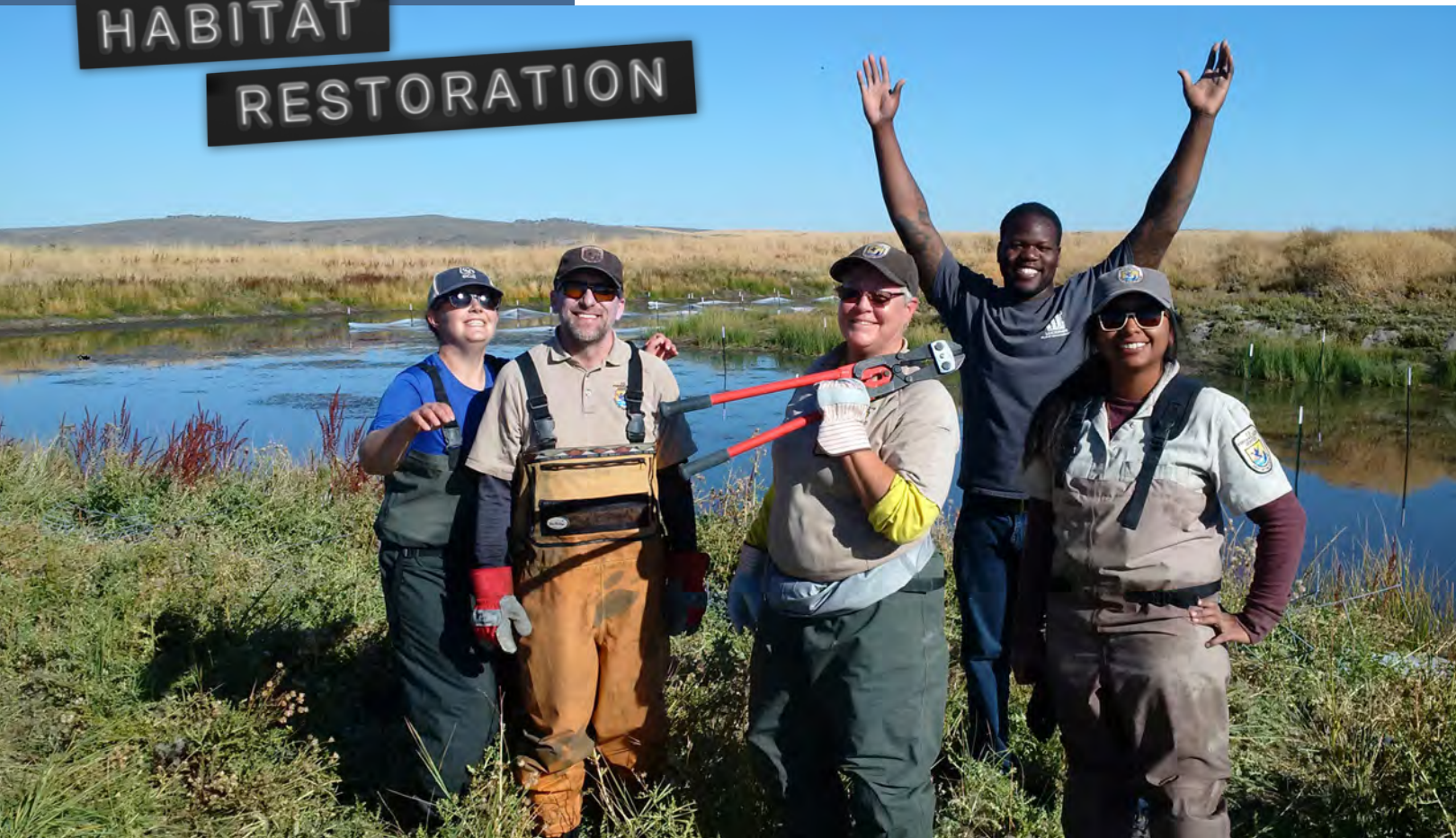
Service staff from the Malheur National Wildlife Refuge, Columbia River Fish and Wildlife Conservation Office, and Abernathy Fish Technology Center are working together and with partners to restore the refuge's aquatic habitat.