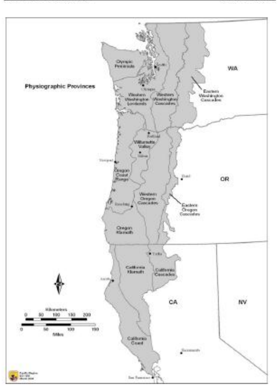
STEE FINAL SPOTTED OWN, RECOVERY PLAN