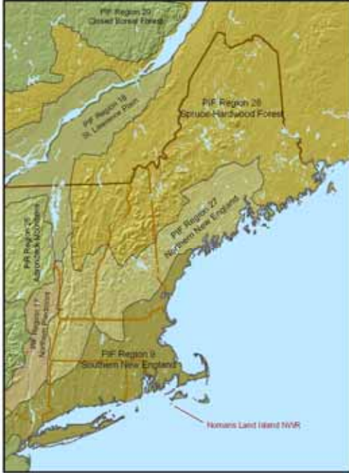
Partners in Flight Physiographic Areas