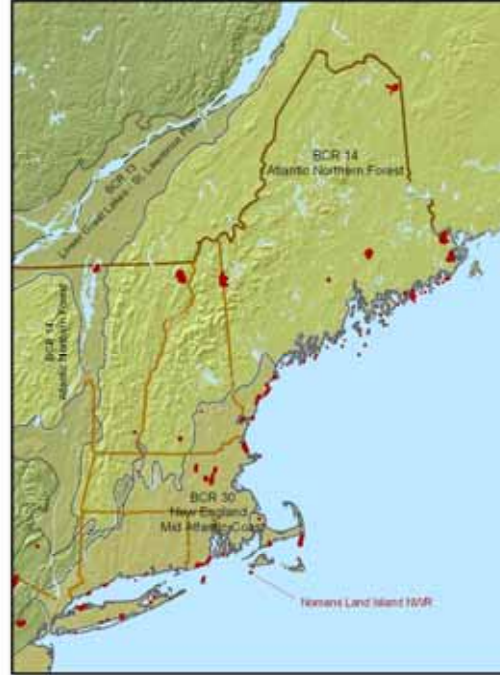
Bird Conservation Regions