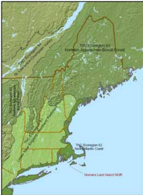
The Nature Conservancy Ecoregions