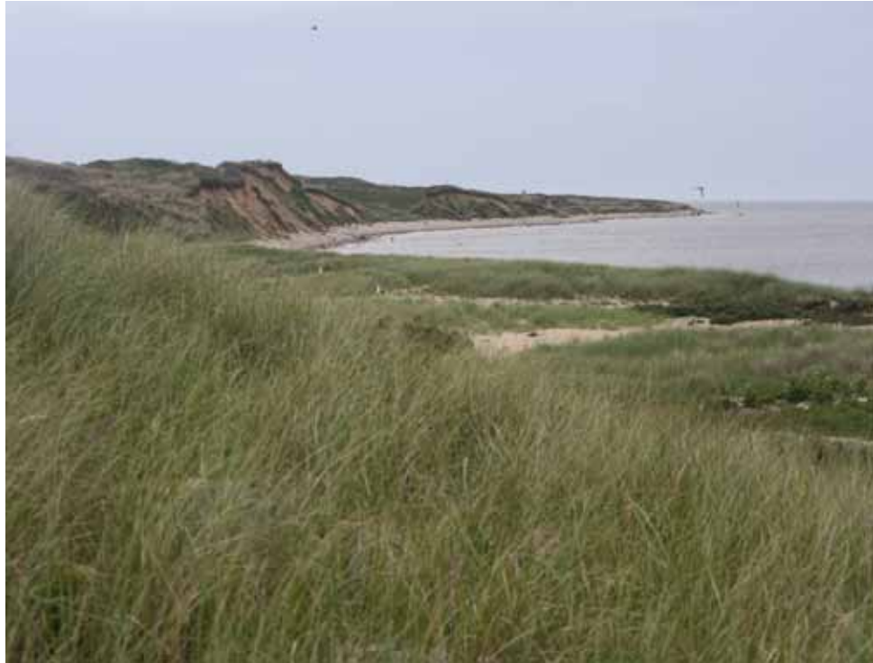
Refuge cliffs and dunes