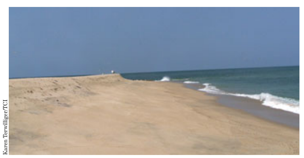
Changing refuge beaches

coastal ecosystems, because they are one of the major influences on the amount and quality of habitat for beach-nesting species (MA DFG 2006).