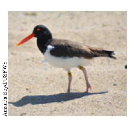
American oystercatcher with band