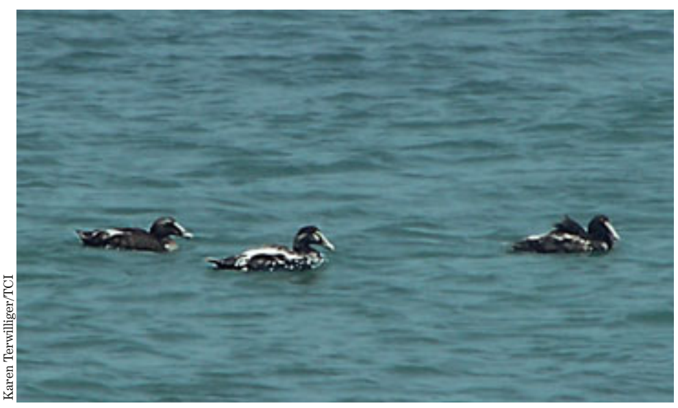
Common eiders in nearshore waters