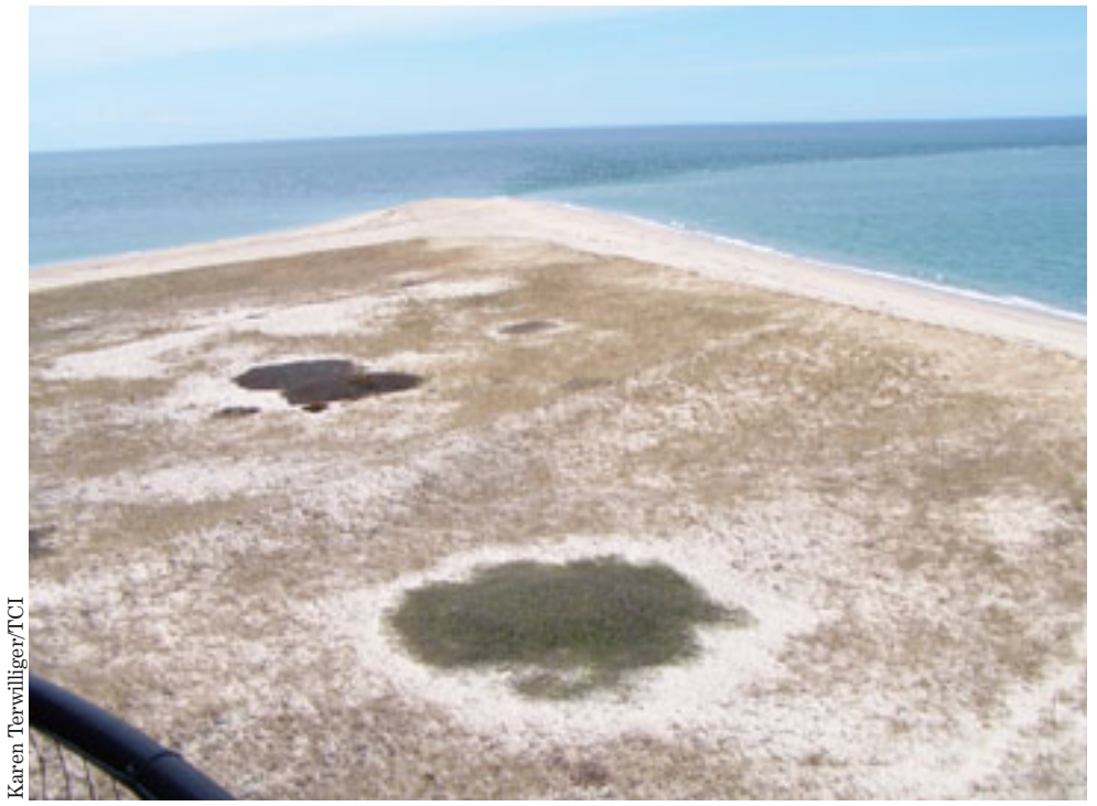
Tip of Nantucket National Wildlife Refuge featuring the rip at Great Point