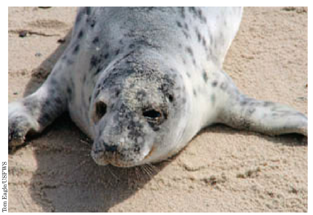
Gray seal pup

Counts for hauled-out seals on the refuge in 2008 ranged between 50 and 250 in April and May on a given day (TTOR 2008). Due to the presence of the least tern colony on TTOR lands, the point was closed to the public, so people did not have access to the seals, essentially preventing most human interaction. Those that were seen trying to approach the seals were educated about legal and safety issues, and were turned away (TTOR undated). In 2010, counts of hauled-out seals at the tip of Nantucket NWR varied throughout the season from a high of 200 in early summer to a low of 8 in August before climbing back to 70 in September. In 2011, a high count of 446 seals occurred in May (A. Boyd, personal communication, 2011). Throughout the summer, boats were observed at the point seal-watching. In addition, there were several observed instances of boats speeding around the point that resulted in propeller injuries to seals (E. Wunker, personal communication, 2010). If gray seal numbers regionwide are increasing, then it will be increasingly important to emphasize education about the presence of the seals and what that means for beachgoers.