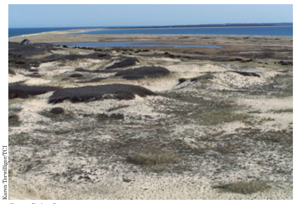
Great Point Lagoon

You may view this policy on the Web site http://www.fws.gov/northeast/nativeamerican/imp_plan.html (accessed March 2011).