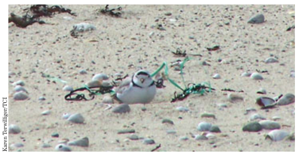
Piping plover on nest