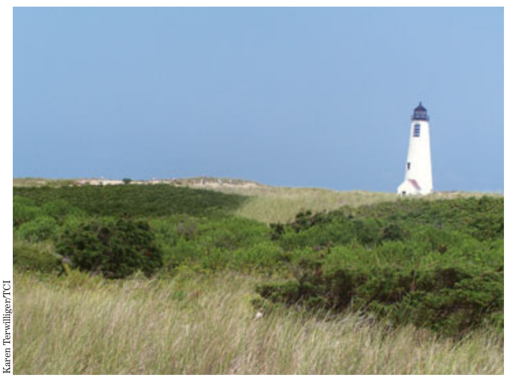
Great Point Lighthouse