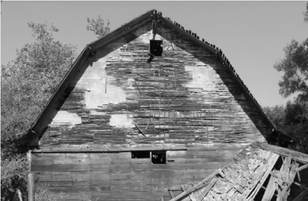
Designated a San Diego County Historic Site in 1996.

The Refuge Complex has received funding to design and implement a stabilization plan for the Barn at the Oaks, a historic barn located within the San Diego NWR. The Barn at the Oaks, which was constructed some time between 1895 and 1936, is a gambrel roof, balloon frame wood barn with a field stone and concrete foundation and horse stalls. Around 1928, the property was converted from a farm operation to a school for boys. In 1936, the property was leased to Esther Riddle for the school which operated until 1957.