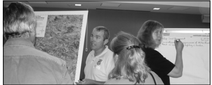
More than 70 people attended the Public Scoping Meetings.

We would like to thank everyone who participated in the scoping process for the San Diego National Wildlife Refuge (NWR or Refuge) Comprehensive Conservation Plan (CCP). More than 70 individuals representing the interests of private property owners, hunters, trail users, environmental organizations, land conservancies, public agencies, and others, attended the public scoping meetings held this past June. Many others contributed written comments either electronically or by mail. We received input addressing over 150 different issues ranging from law enforcement and fire management to public use and habitat protection.