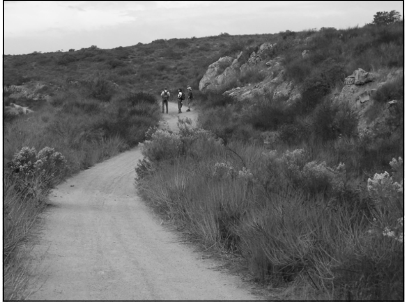
Many of the comments reflected a desire to see a designated system of multiple use trails established on the Refuge.

Tribes, organizations, and agencies received a copy of Planning Update 1 . Two public scoping meetings were conducted in mid-June and comments were solicited on the Refuge website. These actions generated more than 150 different comments. All of these comments are now being considered and evaluated as part of the development of potential management strategies for the Refuge. The issues, suggestions, and concerns expressed during the scoping process will provide valuable assistance to us as we formulate the vision and goals for the Refuge and establish priorities for actions related to wildlife and habitat management, refuge operations, and public use.