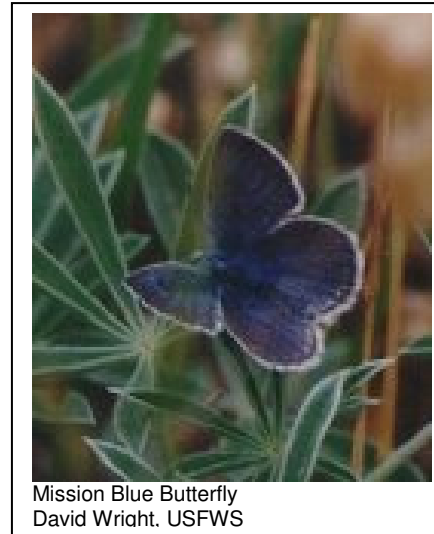
Mission Blue Butterfly

5-YEAR REVIEW: Completed February 2010. No change recommended. www.fws.gov/ecos/ajax/docs/five_year_review/doc3216.pdf (285 KB)