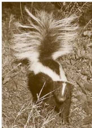
Striped Skunk/V. B. Scheffer