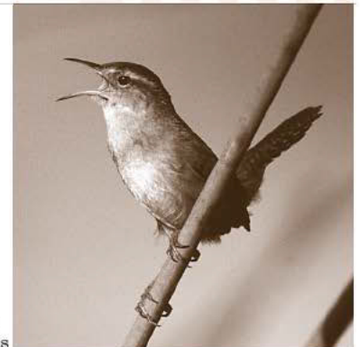
Marsh Wren