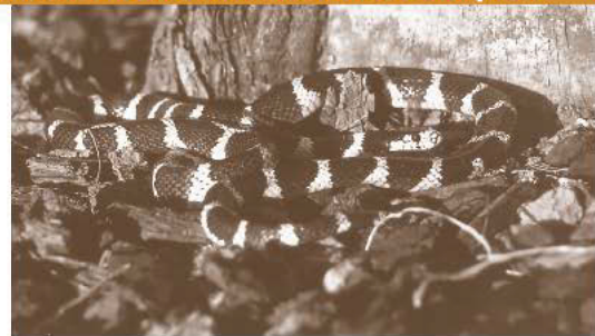
Common Kingsnake