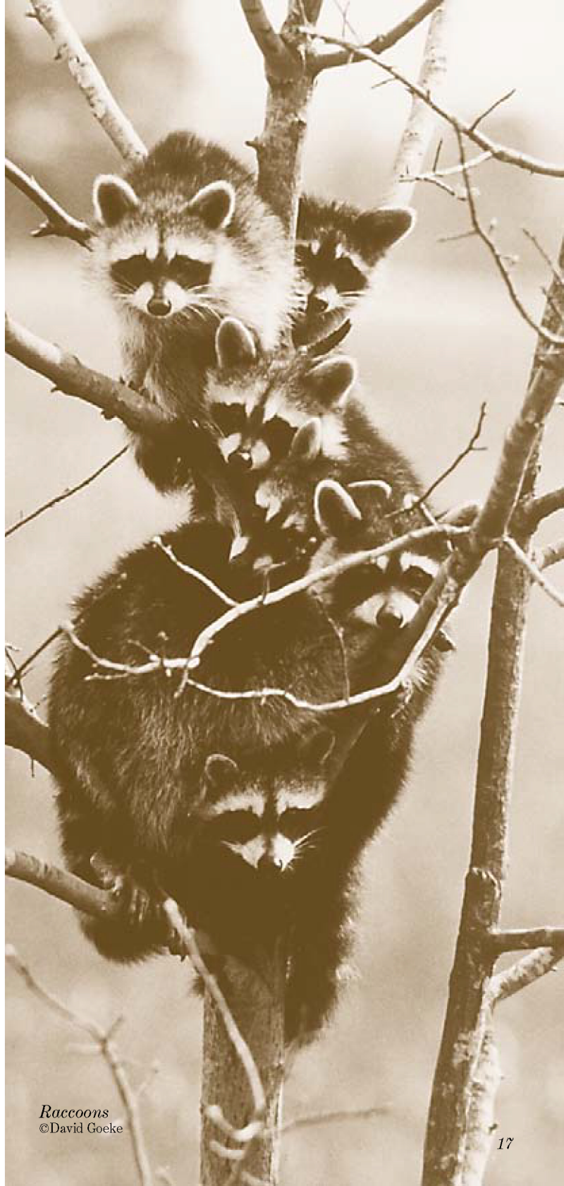
Raccoons