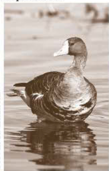
Greater White-fronted Goose

Geese begin arriving at the refuges in September.