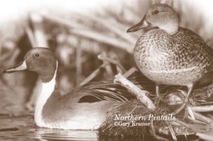
Northern Pintails