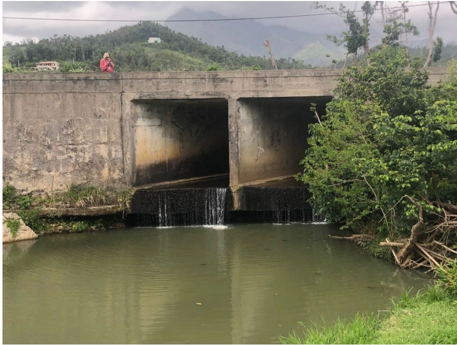
Figure 5. Poor design has resulted in scour and degradation below culvert and obstruction to fish passage.

that simulates the natural streambed. Open-bottomed structures should contain substrate that matches the natural stream channel.