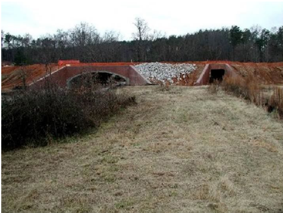
Figure 6. Bankfull Bottomless Arch Culvert with Floodplain Relief Drain.

Implementation of a replacement project requires a high level of information and site-specific data regarding stream hydrology and geomorphology, as well as engineering and construction expertise. Project design criteria include several components as described below.