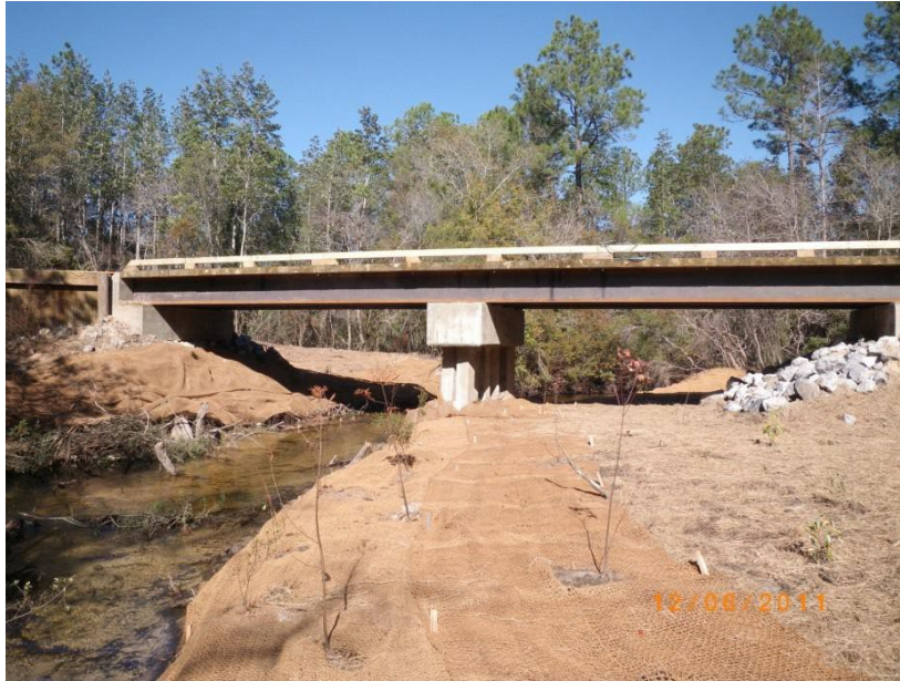
Figure 3. Bridge with Floodplain and Height Capacity for 100 yr Flows.