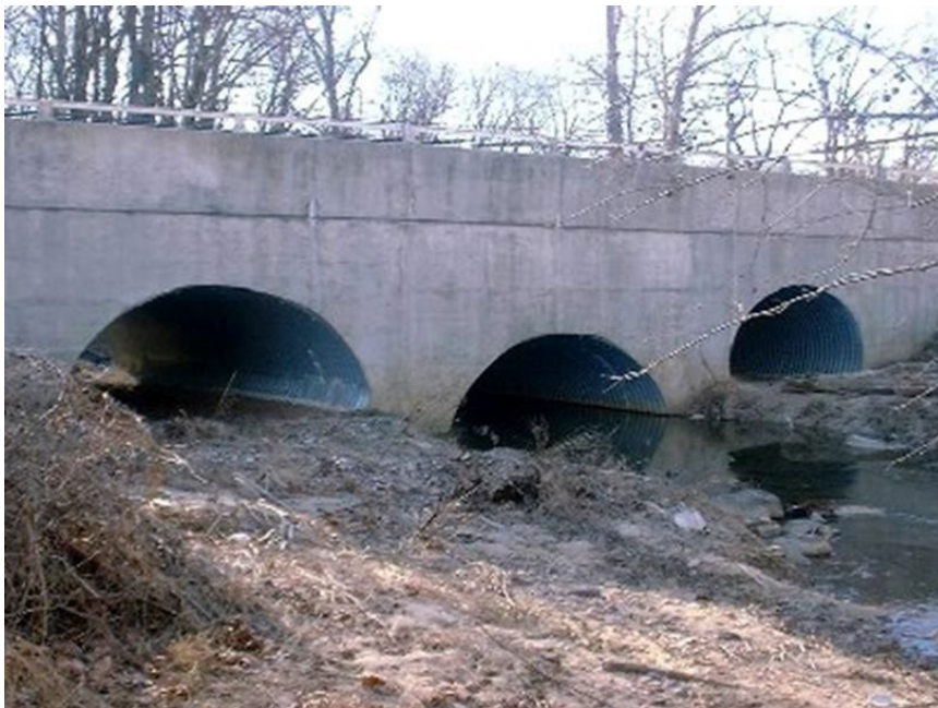
Figure 4. Bankfull Channel Culvert with Flood Relief Culverts at Floodplain Elevation.