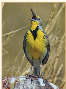
Western meadowlark males develop a repertoire of up to a dozen songs and may switch the songs they sing in response to an intruder.