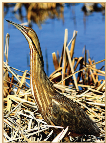
American Bittern