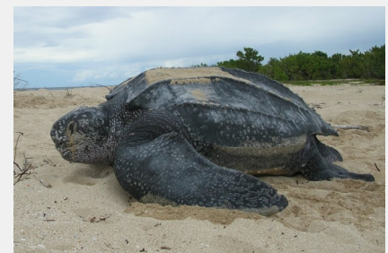
Leatherback sea turtle, Caribbean Islands NWR Complex

GA: Blackbeard; LA: Breton; VI: Navassa; PR: Buck Island, Cayo Luis Peña, Culebrita, Desecheo, Mona 1 , Monito 1 .