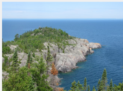
Lighthouse Island, Huron NWR

IL/MO: Barns, Beaver, Chatton, Crains, Flannigan, Fox, Haps, Harlow, Island Number 419, Kaskaskia, La Grange, Long, Long Island Lake, Rockwood, Shandrew, Slim, Wilkinson; MI: Big Charity, Calf, Cattle, Gull, Harbor, Hat, Humbug, Lighthouse, Little Charity, McIntyre, Poverty, Rocky, Scarecrow, St. Martin, Standerson, Sugar, Thunder Bay; OH: West Sister; WI: Black Oak, Detroit, Gravel, Hog, Kleps, Pilot, Plum, Spider.