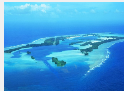
Palmyra Atoll NWR