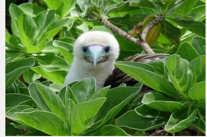
Red-footed booby, Palmyra Atoll NWR

In 2021, FWS NWRS Headquarters and Regional Invasive Species and Integrated Pest Management Coordinators undertook an exercise to