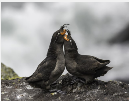
Crested auklets, Alaska Maritime NWR

The following list of 146 islands/atolls represent opportunities for recovery of high priority trust resources through the eradication/control of one or more invasive species.