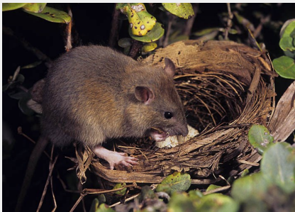
Black rat depredating a nest

Islands host a disproportionate share of the world's biodiversity relative to their total area. Islands are also particularly vulnerable to loss of that biodiversity from anthropogenic threats, in particular, invasive species. The introduction of invasive species usually results in direct and indirect harm to island species by predation, competition, or alteration of habitat. For example, accidental introduction of the black rat at Palmyra Atoll National Wildlife Refuge (NWR) impacted native seabird, crab, and plant populations, ultimately resulting in fewer nutrients flowing into the coral reef ecosystem.