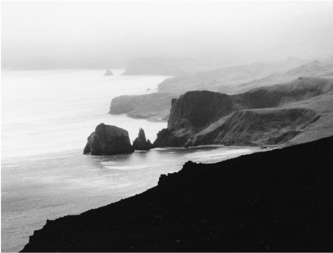
FIGURE 3. General aspect of the fog-laden landscape of northeastern St. Matthew Island, Alaska, in the Bull Seal Point area (Sites L, M, and P); steep rock cliffs rise from the Bering Sea. St. Matthew Island is more mountainous and is richer in streams and wetlands than St. Paul Island. Common lichen species within the photograph area are Alectoria nigricans , A. ochroleuca , Cetraria ericetorum , Cladonia mitis , C. rangiferina , C. stellaris , Cladonia amaurocrea , C. borealis , C. fimbriata , C. gracilis , Flavocetraria cucullata , F. nivalis , Lobaria linita , Parmelia omphalodes , Peltigera aphthosa , P. britannica , P. membranacea , P. scabrosa , Pertusaria alaskensis , Pseudophebe pubescens , Stereocaulon intermedium , Thamnolia vermicularis , Umbilicaria cylindrica , U. polyphylla , and Xanthoria elegans .

wardsii , Geum rossii , Papaver radicum , Pedicularis langsдорфii , P. lanata , Potentilla villosa , and Silene acaulis . Grassy banks and upland meadows are frequent, particularly near the sea. Some conspicuous species from these areas are Pedicularis verticillata , Ranunculus eschscholtzii , R. sulphureus , and Valeriana capitata . On St. Paul Island, there are few wetland species and only one true bog; Sphagnum is rare. Sandy shores and dunes are extensive and are characterized by meadow species such as Elymus mollis , Honckenya peploides , and Lathyrus maritimus .