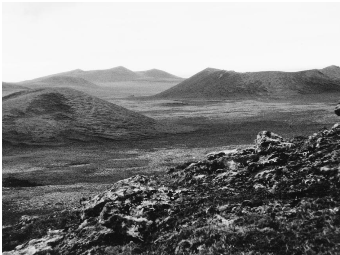
FIGURE 2. General aspect of the landscape of southwestern St. Paul Island, Alaska, in the Cone Hill area (Site I). Old volcanic cones rise approximately 100 m above the surrounding terrain. The island is mostly low-lying (<180 m) with no streams and nearly no wetlands. Common species collected in this area are Cetraria ericetorum , Cladina mitis , Cladonia bellidiflora , C. gracilis , C. maxima , Melanelia hepatizon , Parmelia omphaloides , Peltigera malacea , Stereocaulon arenarium , S. intermedium , and Tuckermannopsis chlorophylla .