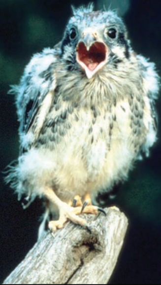
American kestrel young