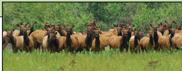
Elk at W.L. Finley NWR

Hunting. Hunting generated more commentary than any other topic. More than half of all respondents mentioned it. Many people urged us to expand hunting programs at the refuges, particularly for waterfowl or elk. The most common reason cited was that since duck stamp fees support refuges, refuges should provide hunting opportunities.