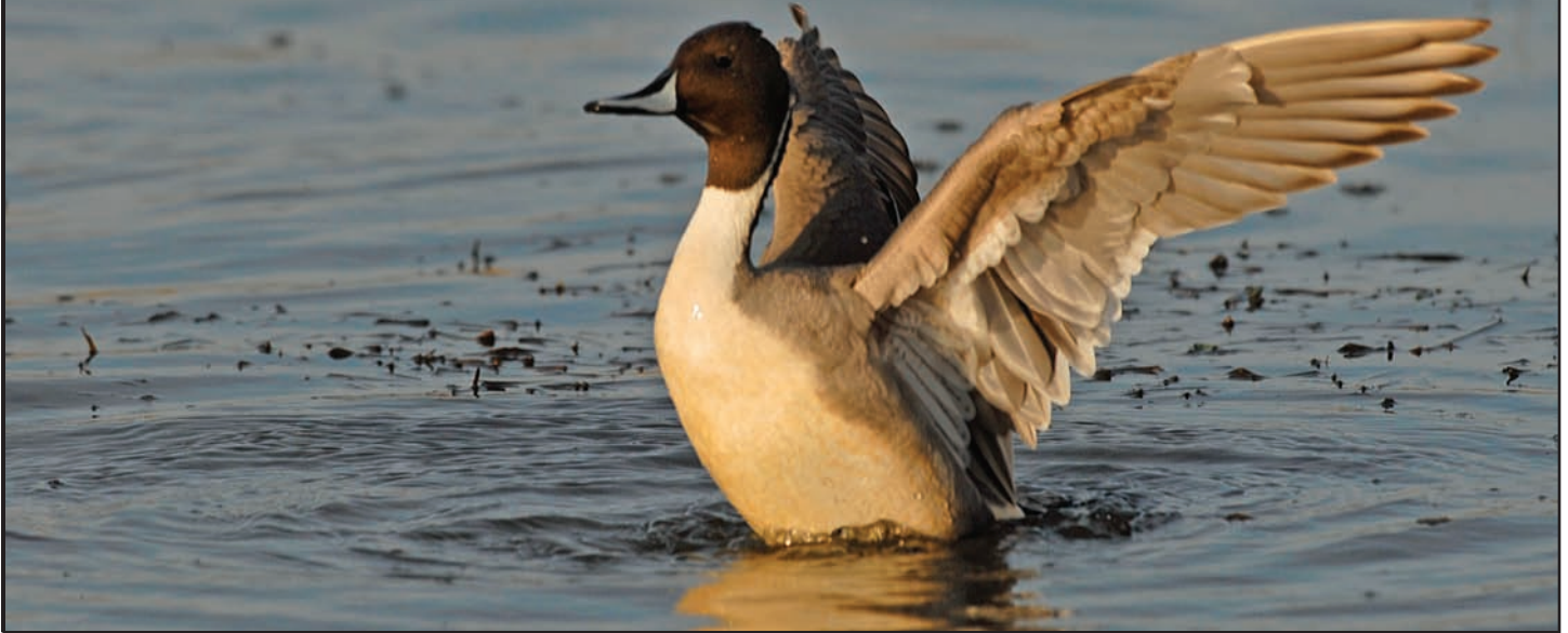
A Northern pintail comes to rest at Baskett Slough NWR