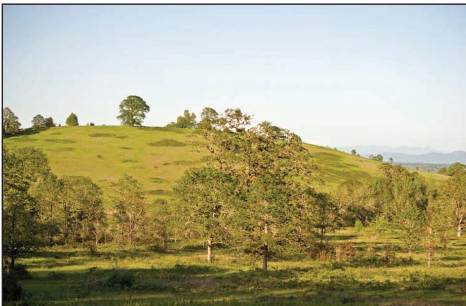
Bald top oak savanna at William L. Finley NWR

weed control activities would occur. Overall, refuge farming program costs would increase and goose use would likely decrease.