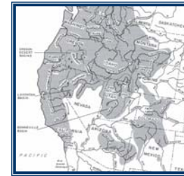
Map and goal of the WNTI isto speed the pace of conservation actions and projects.

In Region 6, there is one nationally recognized FHP: Western Native Trout Initiative (WNTI). There are two candidate FHPs: Great Plains Prairie Partnership (GPP) and Desert Fishes (DFHP). who plan to apply for recognition in 2008/2009. Their geographic scopes are represented below.