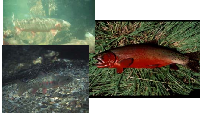
Region 6 cutthroat trout that WNTI restoration and recovery projects focus on are Bonneville cutthroat, Colorado River cutthroat, greenback cutthroat, Westslope cutthroat, Yellowstone cutthroat and Rio Grand Cutthroat trout. Shown above are Westslope, Green back, and Bonneville. (From Top and clockwise)

Fisheries provides coordination support to FHPS and implements habitat restoration projects in partnership with other Federal, State, Tribal and private entities.