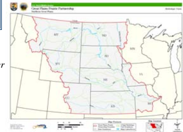
Map and GPP FHP Draft Mission: Working Together to Protect, Conserve, and Restore Aquatic Resources of Rivers and Streams Throughout the Northern Prairies of the Central U.S.."