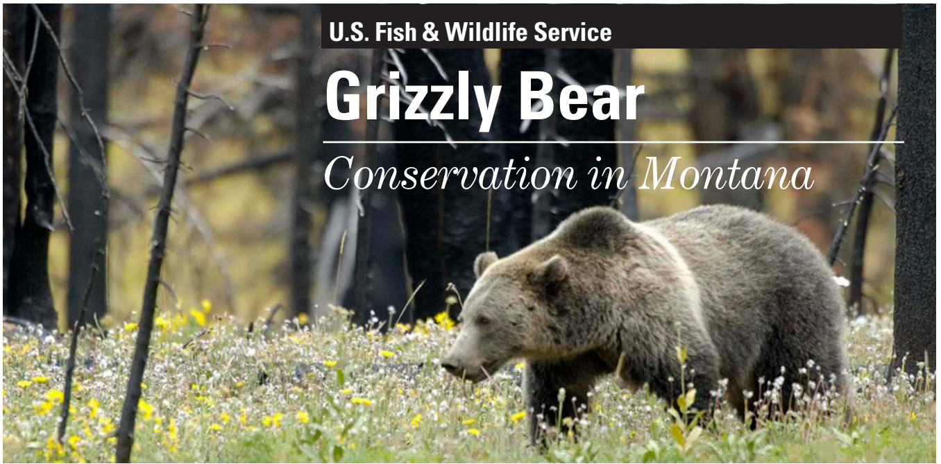
Grizzly Bear in Yellowstone National Park