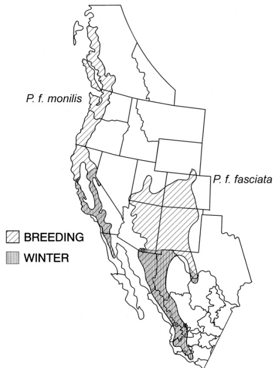
Figure 1. Distribution of Pacific Coast ( P. f. monilis ) and Interior ( P. f. fasciata ) band-tailed pigeons in North America (after Braun et al. 1975).