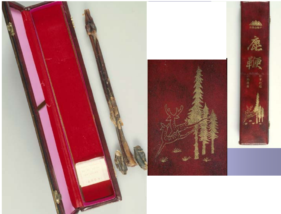
Fig. 7. A putative deer penis in a decorative box. Serological assay determined the tissues to be bovine.

Serological analysis using immunodiffusion determined that dried tissue from the corpus cavernosum (shaft) of the penis was consistent with bovine tissue. The tests were non-reactive to cervine antisera, indicating that the penis was not tissue from a member of the deer family, but was from a bull and, therefore, from the bovine family.