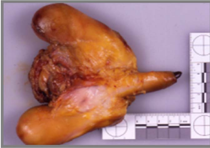
Fig. 1. Genuine tiger penis, raw state. Underneath the foreskin of a real tiger's penis is the glans , which is studded with small spicules called barbs (See close-up in Fig. 2).

penis tip (~ 2 cm), and these barbs or spicules are very small (< 0.7 mm) in even the largest cats and are barely noticeable when the penis is dried.