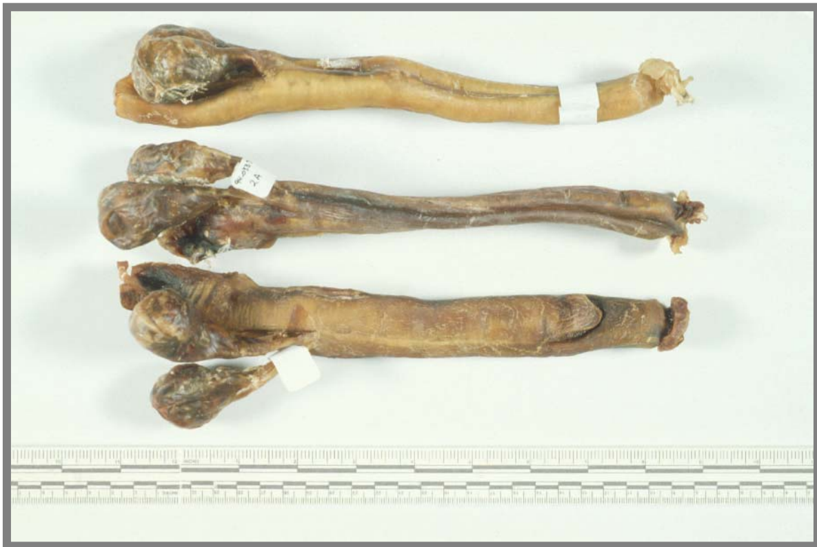
Fig.6. Examples of cattle (upper and middle) and horse (lower) genitalia.

Genitals of other domestic mammals have been dried and sold as tiger penises. For example, horses and dogs have been used as substitutes. They are sliced and consumed as tea or soup as traditional medicine for strength and virility. Unlike tiger penises, however, deer, horse, and cattle penises lack a baculum. Figures 6 and 7 show specimens of cattle and horse.