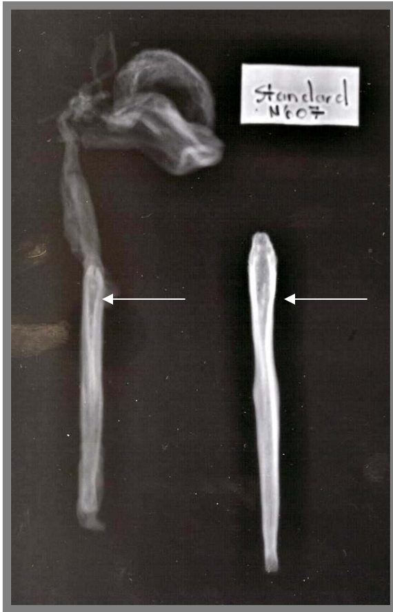
Fig. 8. Radiograph (x-ray) of dried dog genitals on left, showing the presence of the distinctive groove (arrow) in the baculum or os penis . At right is an os penis bone of a slightly larger dog x-rayed at the same time.