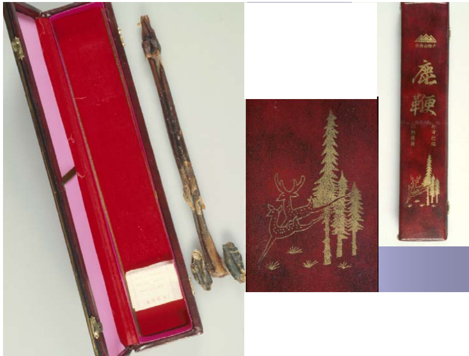
Fig. 7. A putative deer penis in a decorative box. Serological assay determined the tissues to be bovine.

Serological analysis using immunodiffusion determined that dried tissue from the corpus cavernosum (shaft) of the penis was consistent with bovine tissue. The tests were non-reactive to cervine antisera, indicating that the penis was not tissue from a member of the deer family, but was from a bull and, therefore, from the bovine family.