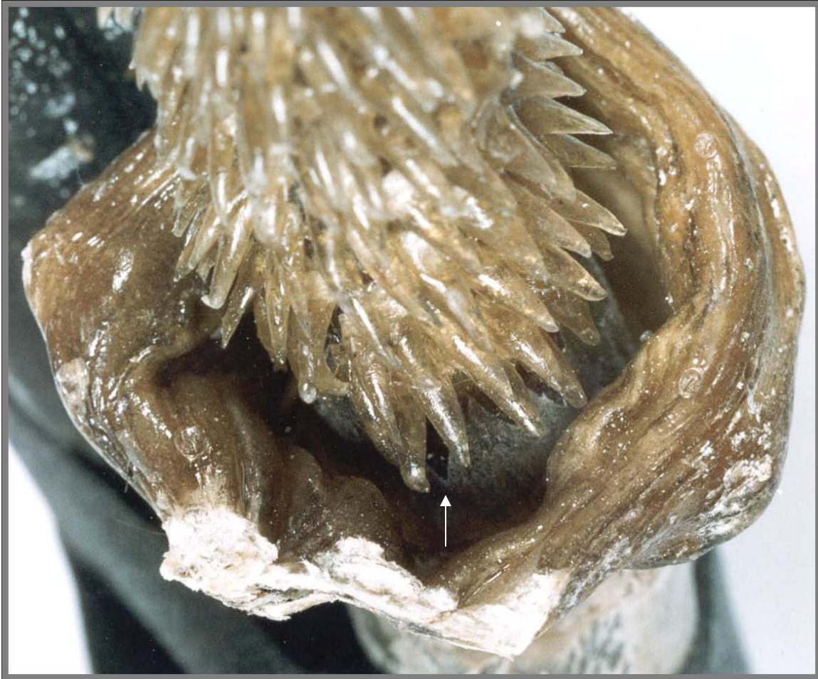
Fig. 4. Looking at the base of a bull's penis carved to simulate a tiger's penis. This is how cattle genitals are made to be used as replacements for genuine tiger parts. Notice the V-shaped cuts in the tissue underneath the lowest barbs (arrow).