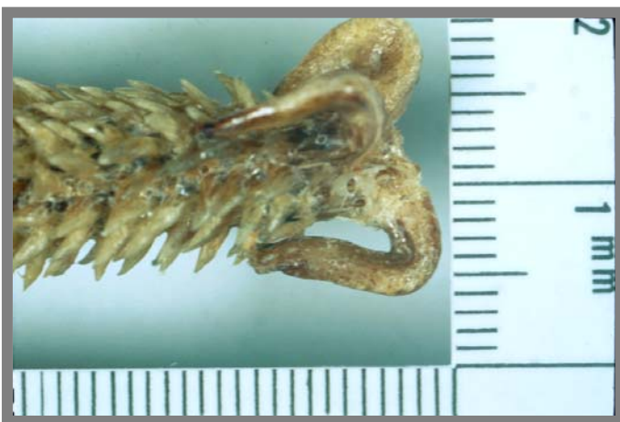
Fig. 5. Extravagantly carved tip of a bull's penis.