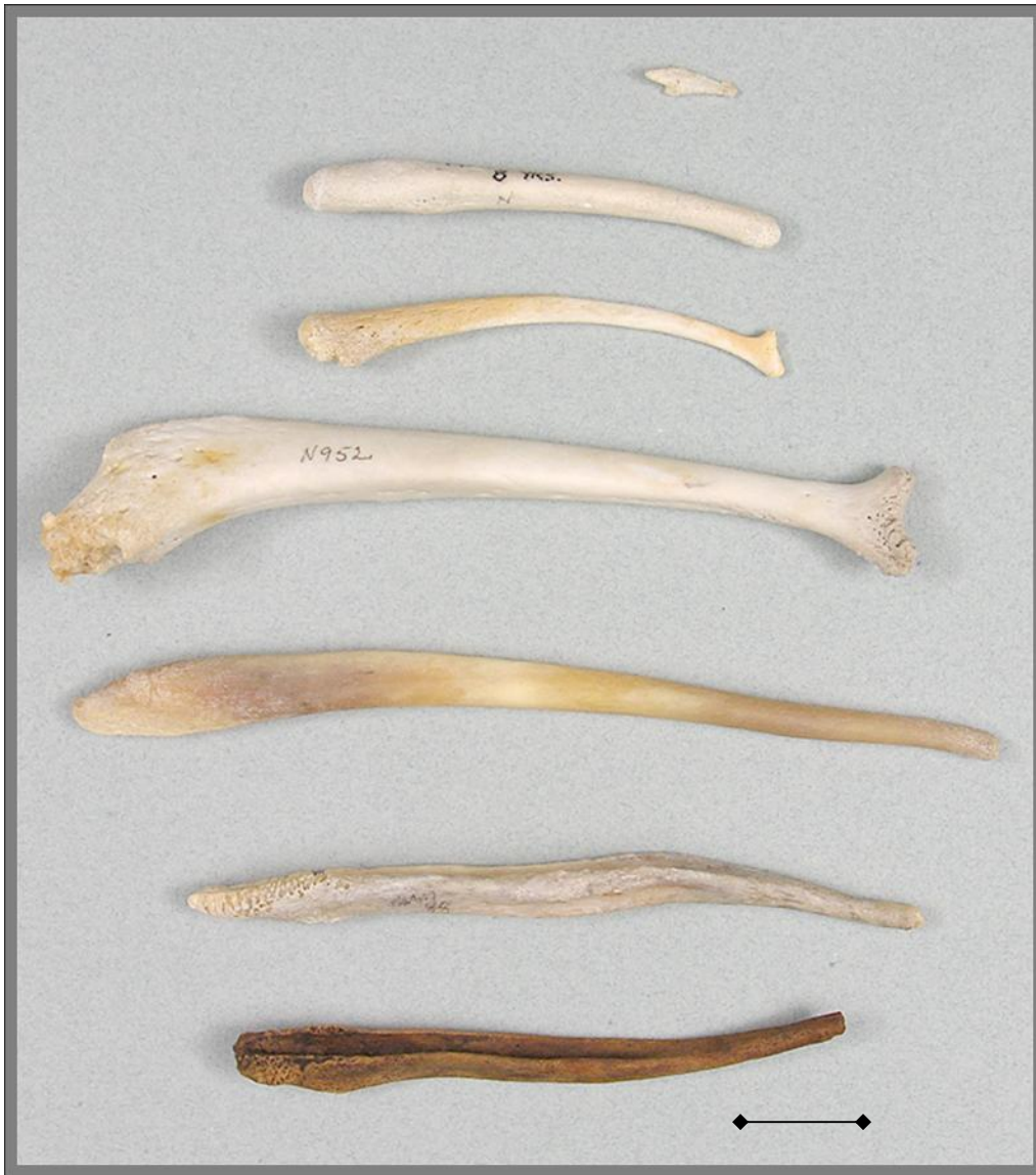
Fig. 9. These carnivore bacula might be seen in x-rays of dried genitalia sold for traditional medicines. From top are cleaned penis bones of tiger, true seal (juvenile), fur seal (juvenile), sea lion, brown bear, wolf, and dog. (Scale line is approx. 2 cm long.)