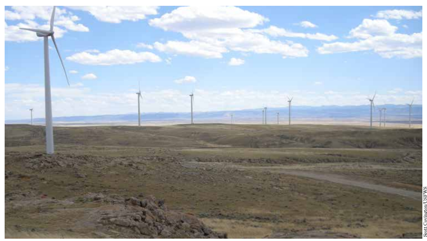
Wind turbines across the Wyoming prairie.

(before or after resource impacts occur). Regardless of the delivery mechanism, species conservation strategies and other landscape-level conservation plans are expected to provide the basis for establishing and operating compensatory mitigation sites and programs.