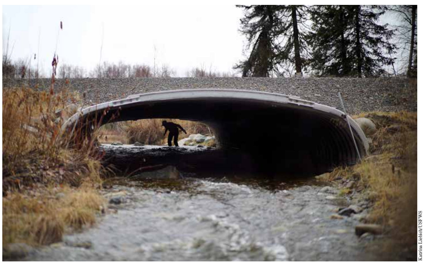
A fish passage engineer inspects new fish-friendly culvert.