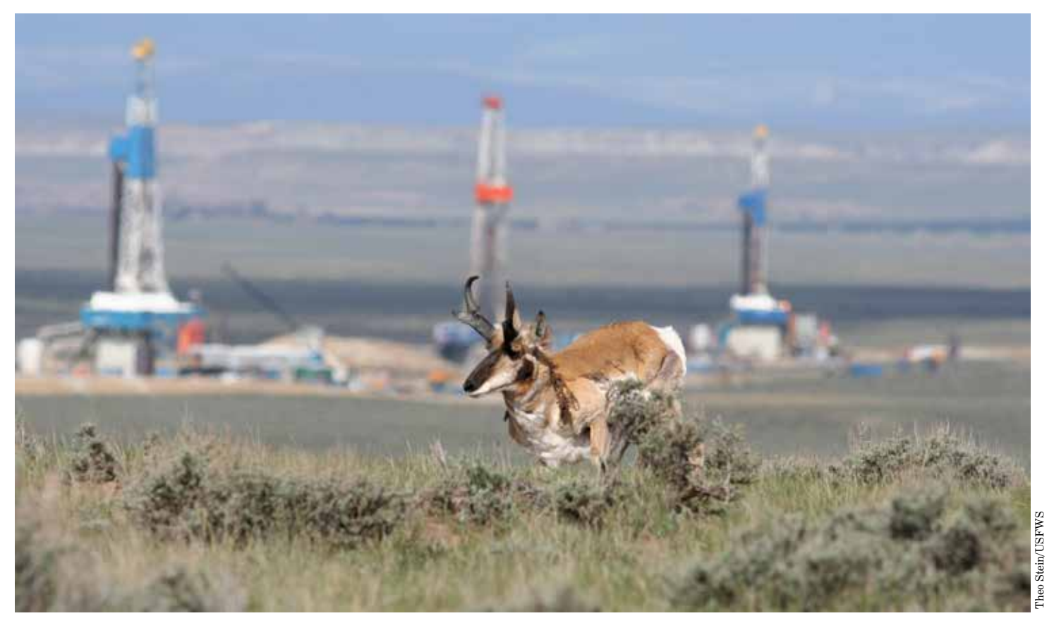
A pronghorn seen in the Pinedale Anticline natural gas field in Wyoming.