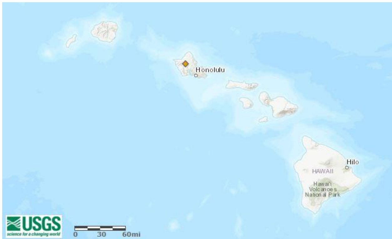
Figure 2. Known distribution of Xenentodon cancila in the United States. Map from Fuller (2018).