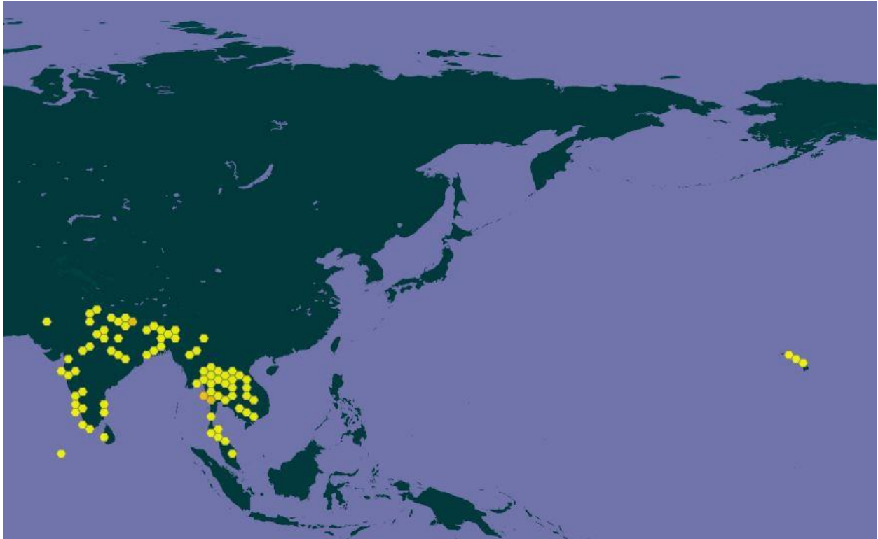
Figure 1. Known global distribution of Xenentodon cancila , reported from southern Asia from Pakistan to Vietnam, and in Hawaii. Map from GBIF Secretariat (2018).