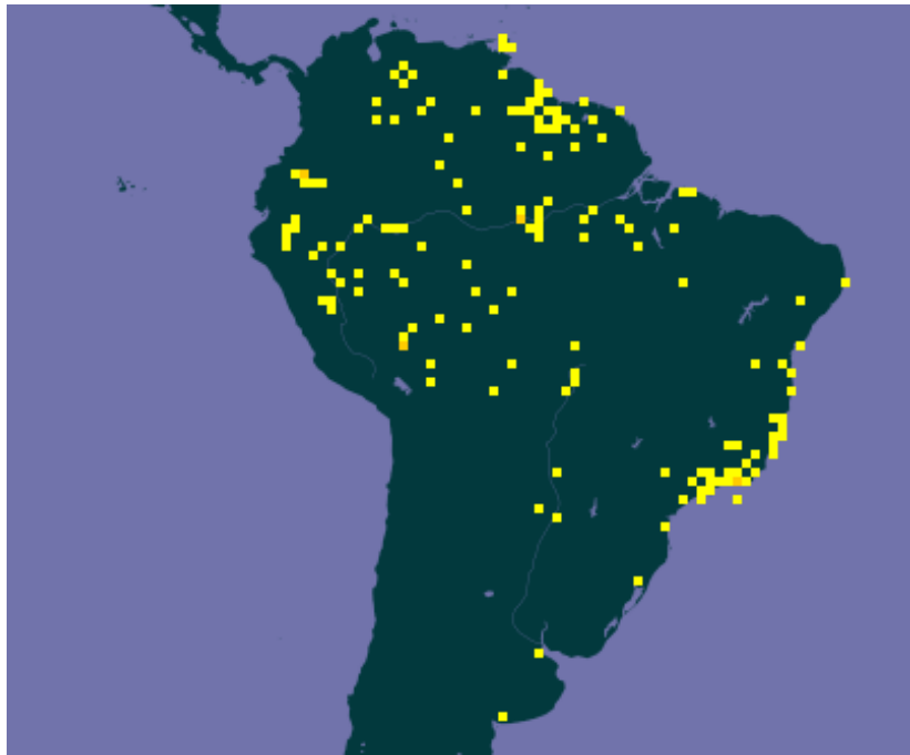
Figure 1. Known global distribution of C. callichthys . Map from GBIF (2016). The southernmost point on the map and two points in North America (unpictured) were excluded from climate matching because they do not represent current established populations.