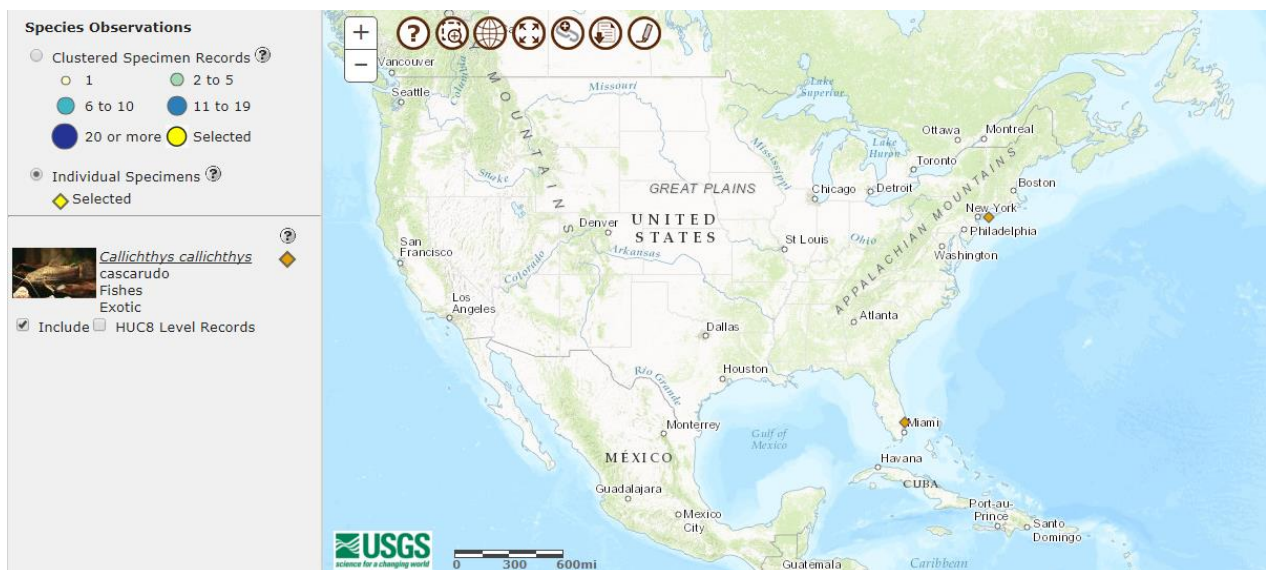
Figure 2. Known records of C. callichthys in the U.S. None of the records represent established populations. Map from Nico (2017).