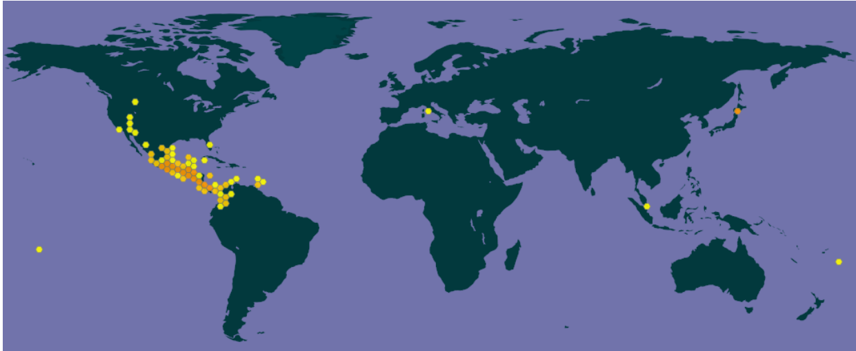
Figure 1. Known global distribution of Poecilia sphenops . Map from GBIF Secretariat (2019). The southern limit of the native distribution of P. sphenops is unresolved in the literature (see Section 1); the widest available interpretation of native range (extending south to Colombia) was used in the climate matching analysis. Points in Italy and Japan represent populations established in thermal waters (Piazzini et al. 2010, Amaoka et al. 2001), so these points were not included in the climate matching analysis. No georeferenced occurrences are available for the species distribution in Brazil or Hungary. See Figure 2 for information on U.S. distribution.