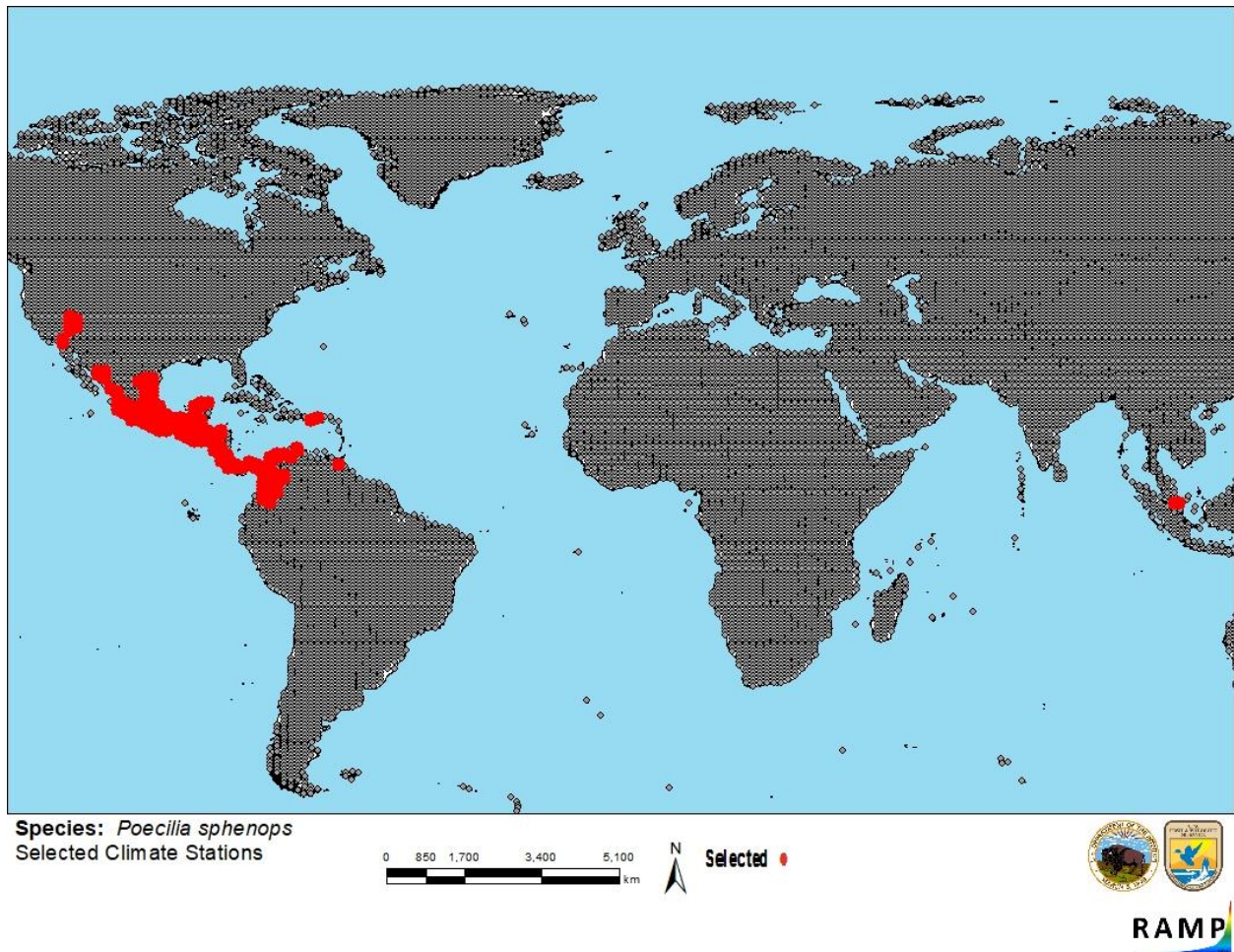
Figure 3. RAMP (Sanders et al. 2018) source map showing weather stations selected as source locations (red; United States, Mexico, Belize, Guatemala, El Salvador, Honduras, Nicaragua, Costa Rica, Panama, Colombia, Trinidad and Tobago, Singapore) and non-source locations (gray) for Poecilia sphenops climate matching. Source locations from GBIF Secretariat (2019) and Nico et al. (2019).