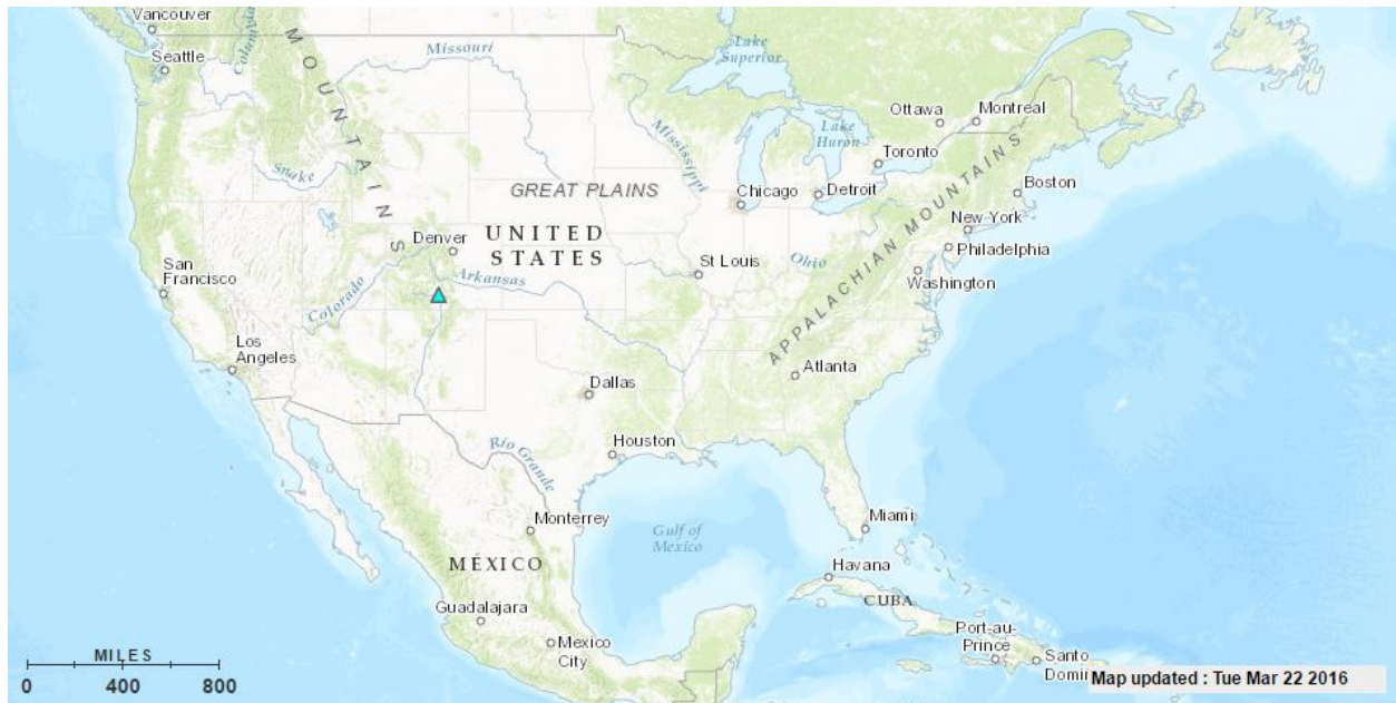
Figure 2. Known distribution of Paracheirodon innesi in the United States. Map from Nico (2016).

The introduction in Colorado was in geothermal waters and failed to establish a population (Nico 2016); it was not used as a source point for the climate match.