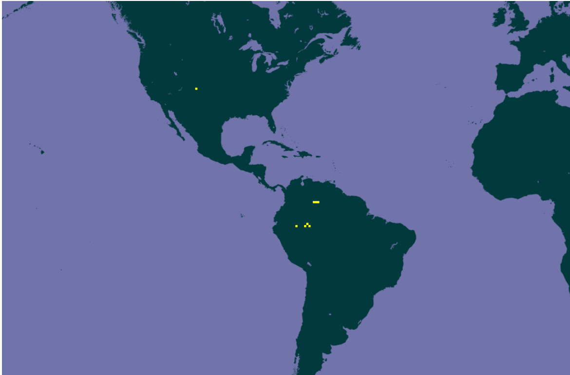
Figure 1. Known global distribution of Paracheirodon innesi . Map from GBIF Secretariat (2016).

Introductions were recorded for Singapore, Spain, the Philippines, and Canada. Only the introduction to Singapore listed the population as established but no geographic data was given for that population. None of these potential populations were used as source locations for the climate match.