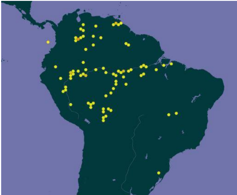
Figure 1. Known global distribution of Oxydoras niger . Locations in Bolivia, Brazil, Colombia, Ecuador, Guyana, Peru, and Venezuela. Map from GBIF Secretariat (2019). Location in the Pacific Ocean off of Colombia was not used to select source locations for the climate match. Oxydoras niger is a freshwater fish and no literature supports any marine locations. The most southern location in Brazil was not used to select source locations for the climate match because no literature supports an established population in this river basin.