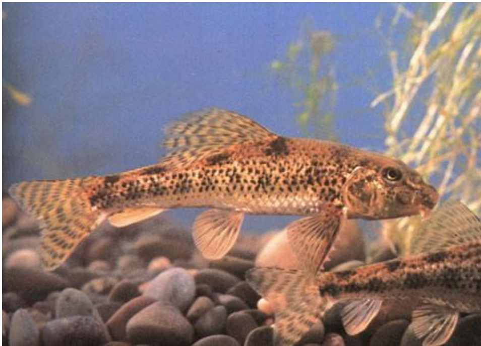
Photo: Chinese Academy of Fishery Sciences. Licensed under Creative Commons Attribution-Noncommercial 3.0 Unported License. Available: http://www.fishbase.se/photos/PicturesSummary.php?ID=22903&what=species . (October 2016).

U.S. Fish & Wildlife Service, August 2012 Revised, October 2016 Web Version, 4/2/2018