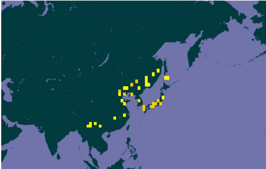
Figure 1. Known global established locations of Abbottina rivularis . Map from GBIF (2016). One record from Africa was excluded due to incorrect location.