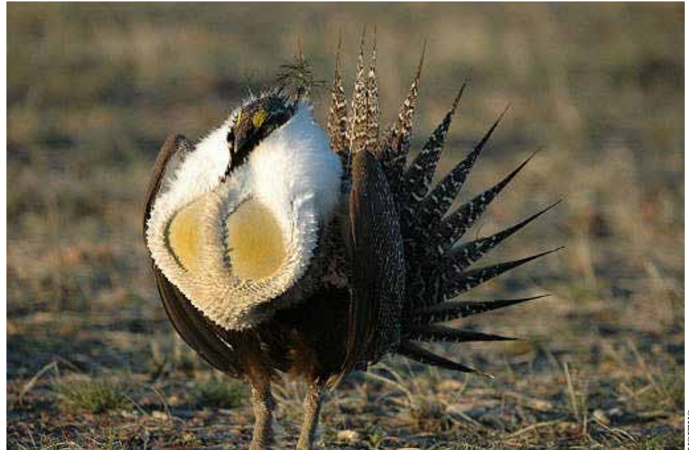
Gunnison sage grouse.

The foundation supporting recovery plans is a Species Status Assessment (SSA). A SSA includes much of the information and analyses previously