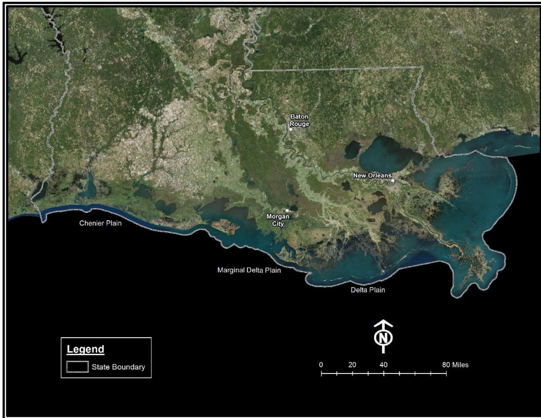
Figure 1. Map of the Louisiana coast.