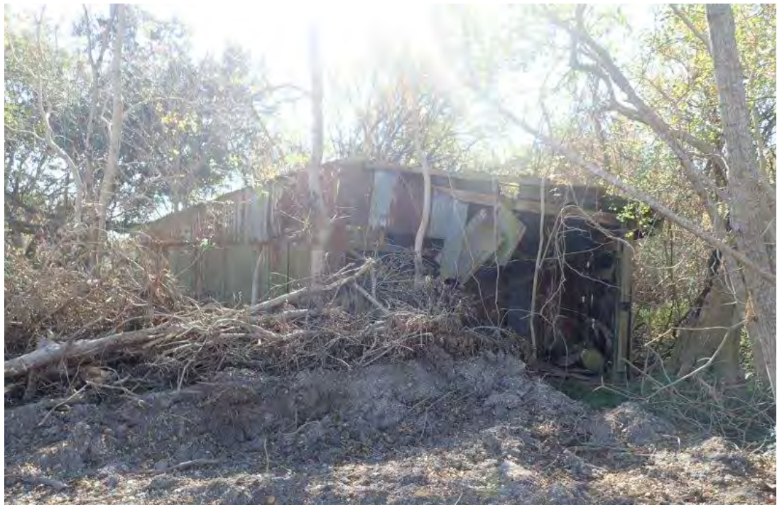
Photograph 63. Abandoned Shed (29°39'49.56"N, 89°57'55.61"W)