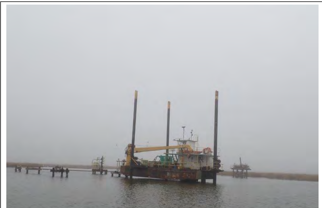
Photograph 100. Site 11: Well Field Structures (29°32'33.60"N, 89°53'32.08"W)