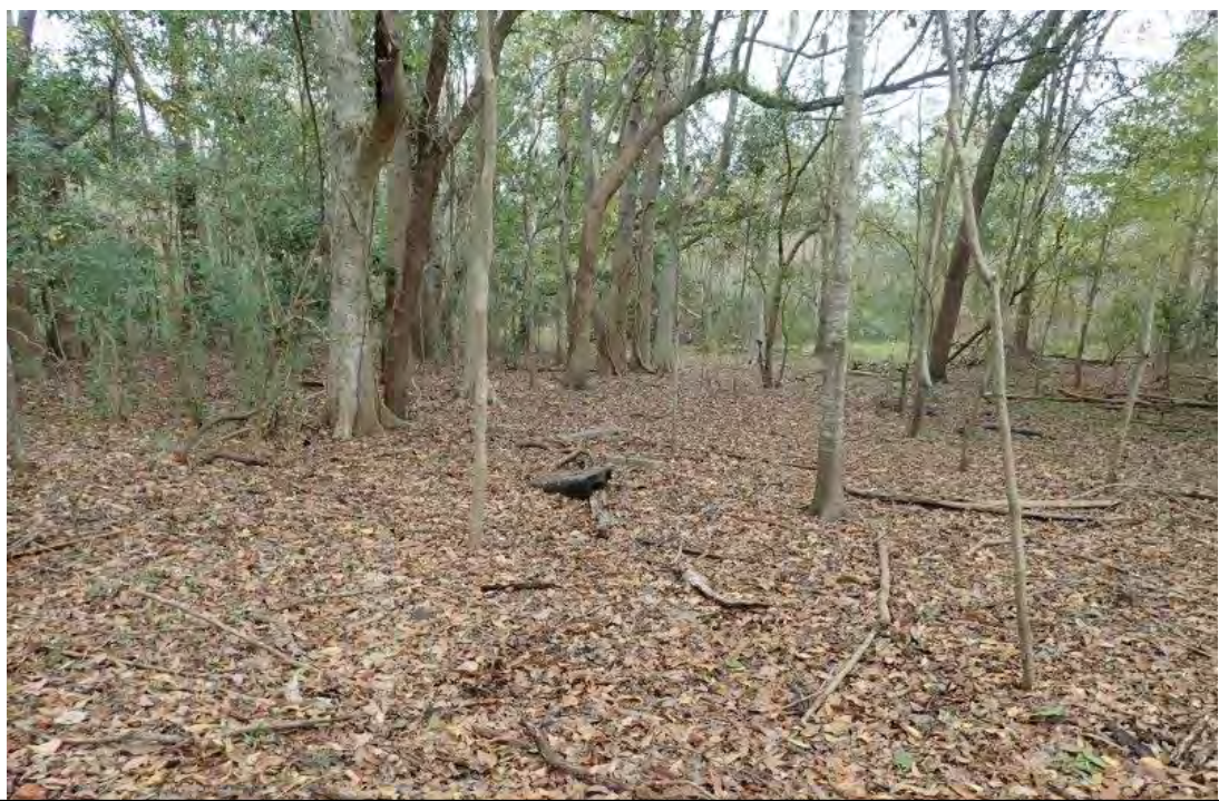
Photograph 76. Possible Former Home Site (29°39'27.86" N, 89°58'20.98" W)