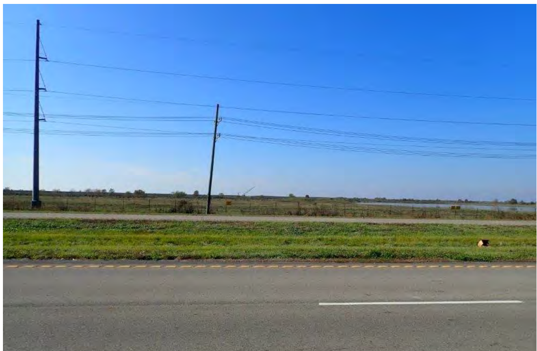
Photograph 28. Overview of Highway Area 1 Facing West