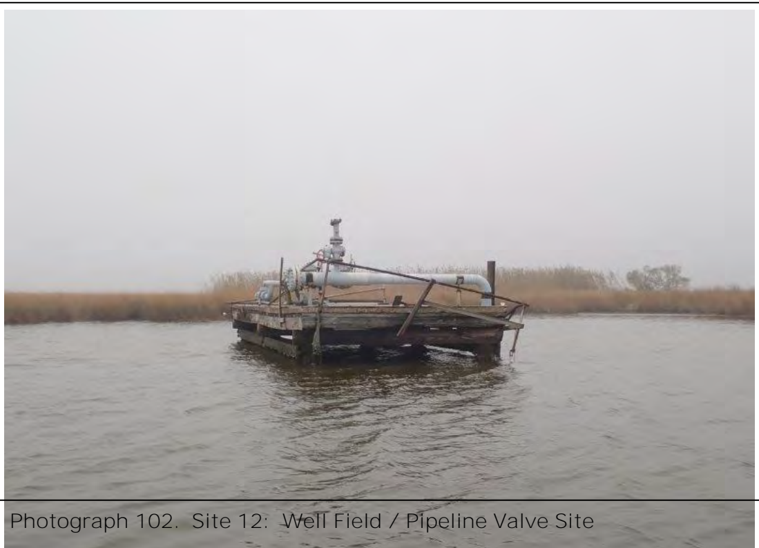
Photograph 102. Site 12: Well Field / Pipeline Valve Site