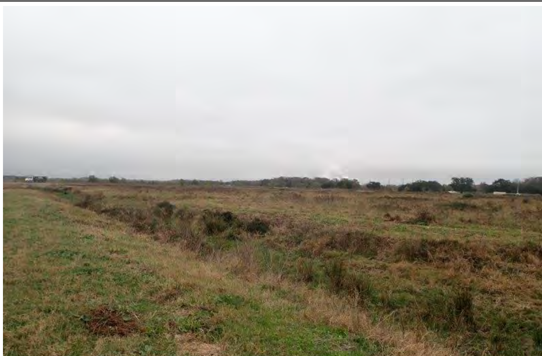
Photograph 37. Overview of Pasture Area 1 Facing North (29°39'12.66"N, 89°58'38.04"W)