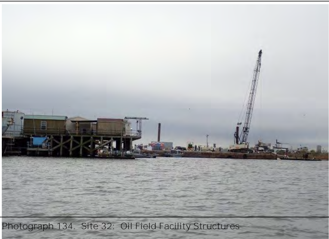
Photograph 134. Site 32: Oil Field Facility Structures