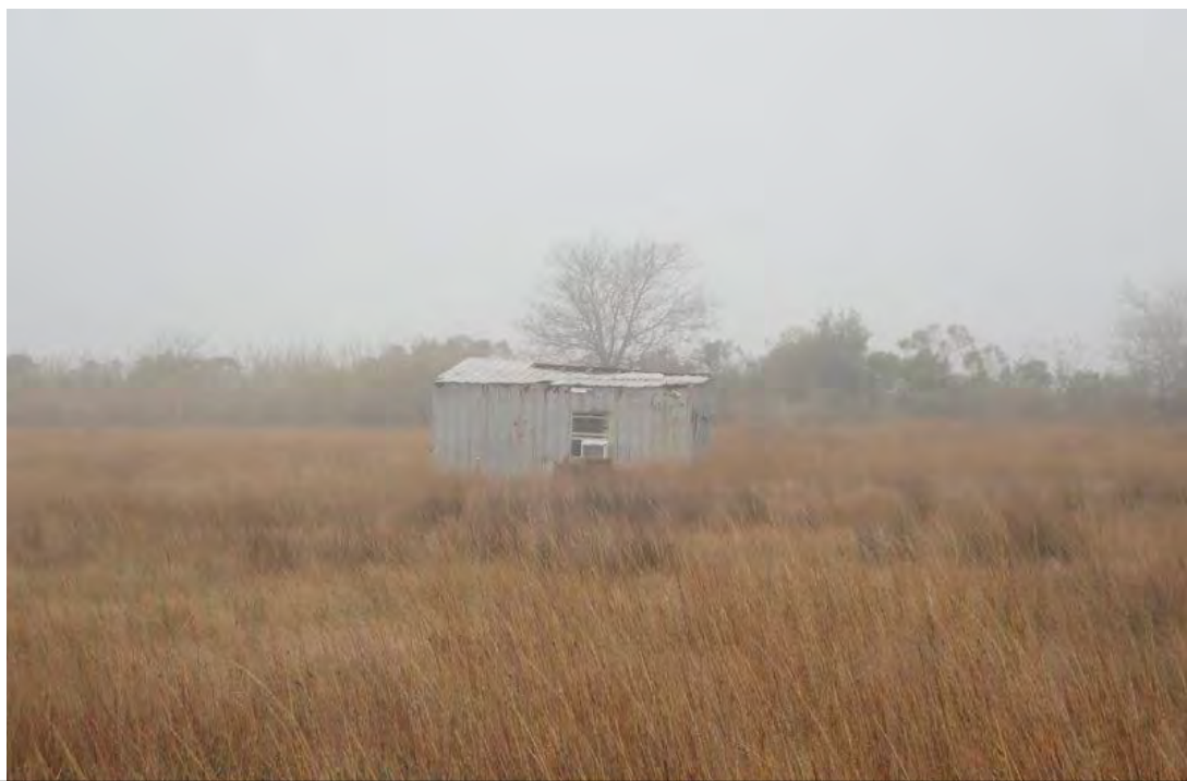
Photograph 105. Site 15: Displaced Camp Structure (29°31'44.24"N, 89°54'15.17"W)