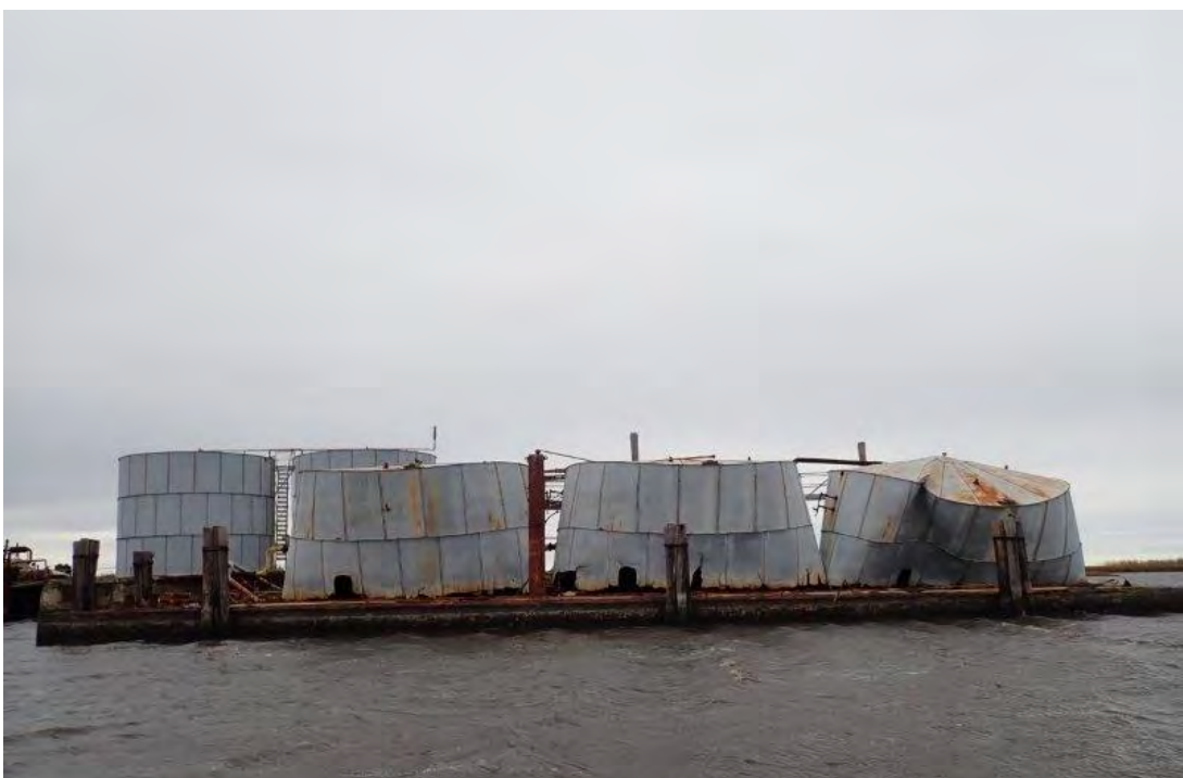
Photograph 114. Site 22: Damaged Oil Field Facility (29°30'39.01"N, 89°59'9.13"W)