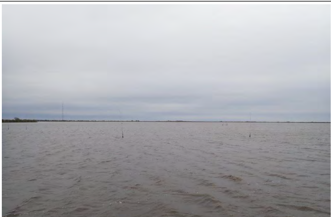
Photograph 54. Overview of Outfall Area 2 Facing East