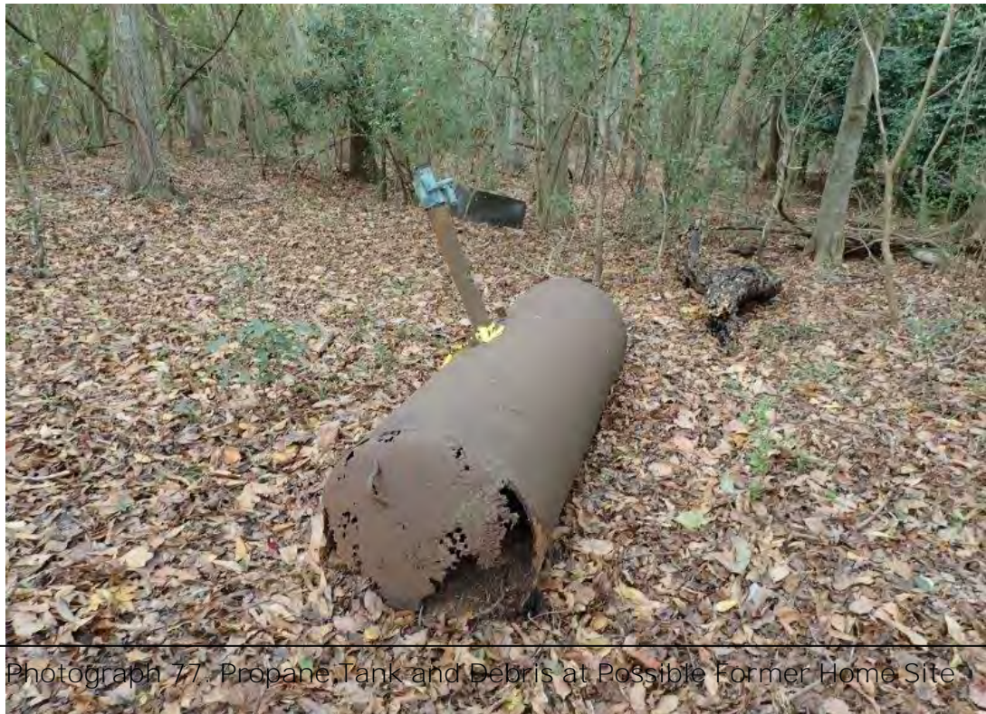
Photograph 77. Propane Tank and Debris at Possible Former Home Site