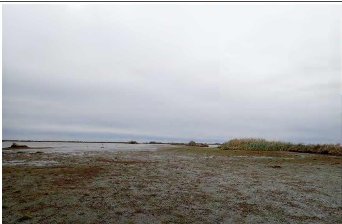
Photograph 60. View from West Access Channel Area 1 Facing South (29°38'16.52"N, 90°0'10.39"W)