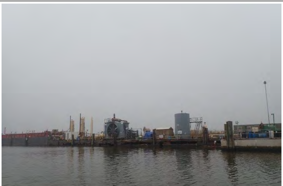
Photograph 98. Site 9: Oil Field Facility on Barges (29°33'17.01"N, 89°54'14.32"W)