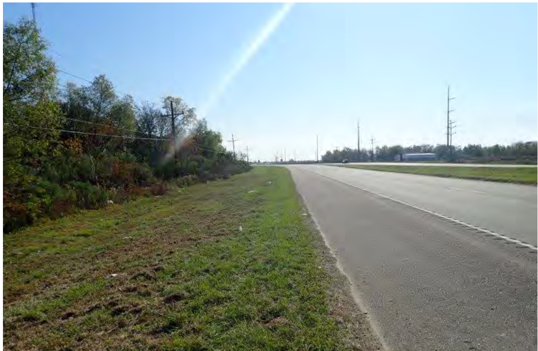
Photograph 27. Overview of Highway Area 1 Facing South