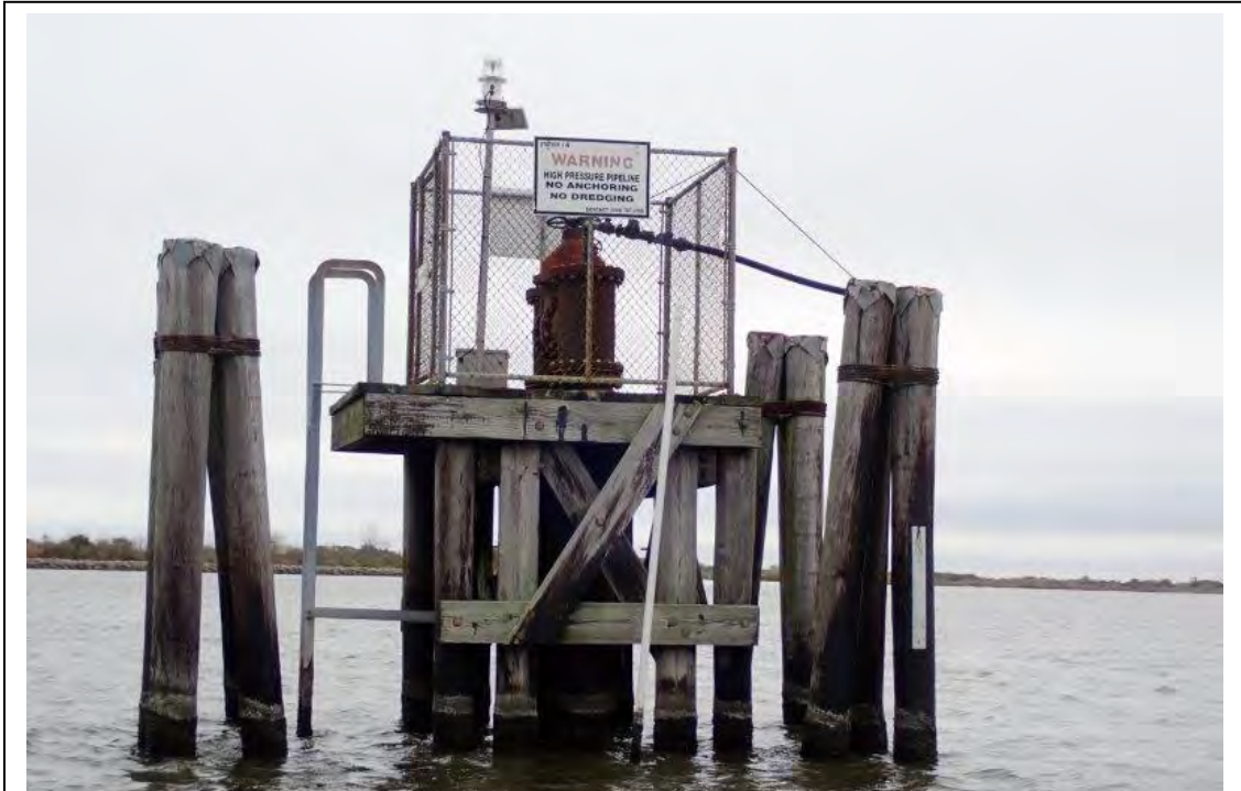
Photograph 137. Site 33: Pipeline Valve Platform (29°36'11.77"N, 90°4'28.50"W)