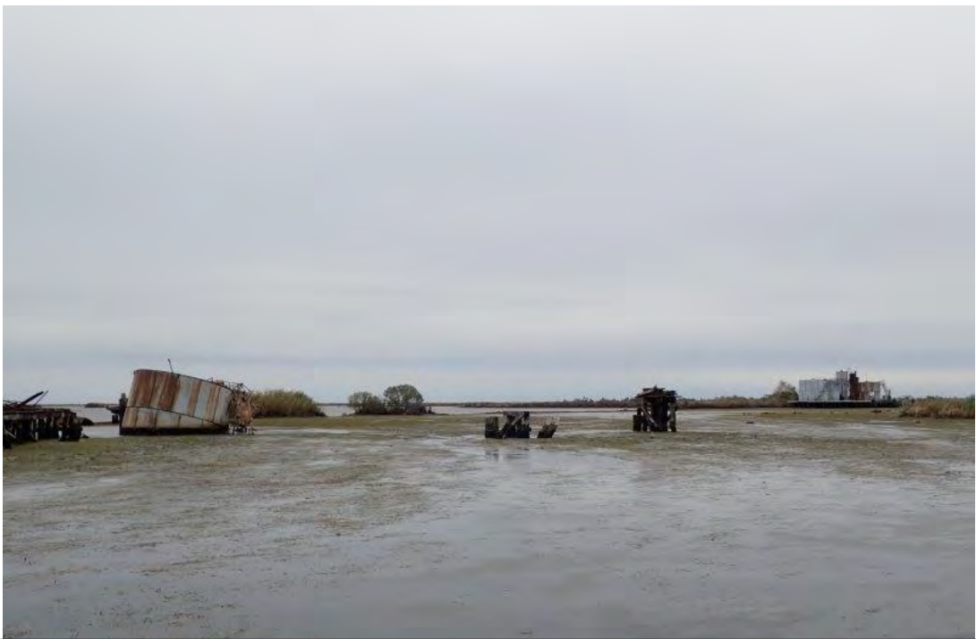
Photograph 87. Site 2: Damaged Oil Field Facility