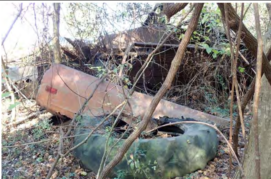
Photograph 74. Metal Waste Pile