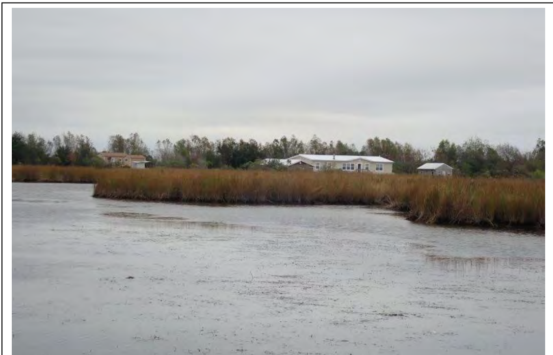
Photograph 138. Site 34: Camp and Boatshed Complex (29°36'13.14"N, 90°3'37.24"W)