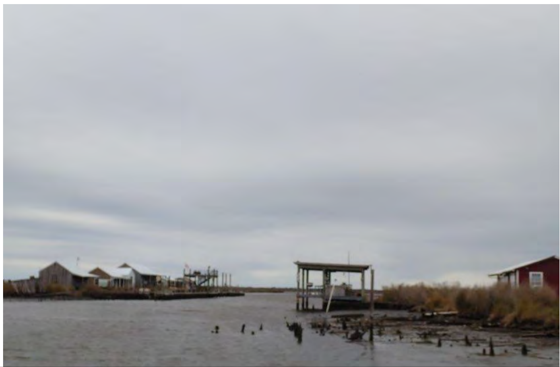
Photograph 95. Site 7: Multiple Camp Structures (29°35'31.93"N, 89°56'38.79"W)