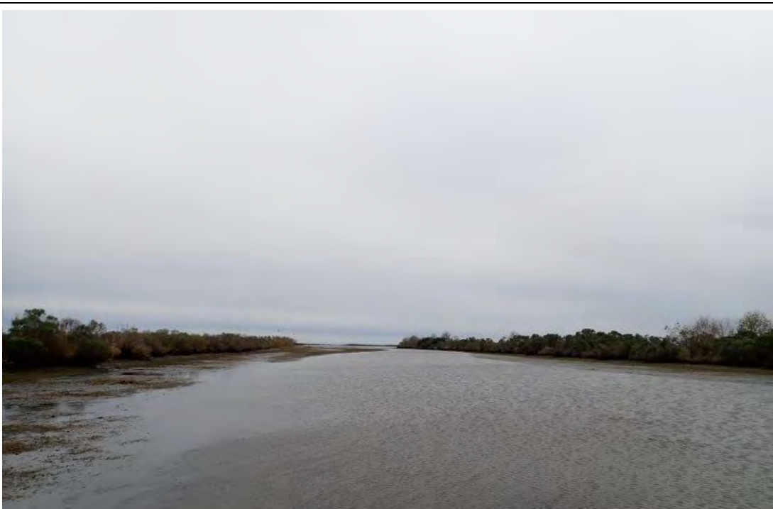
Photograph 62. View from West Access Channel Area 3 Facing South (29°39'30.51"N, 90°0'17.19"W)