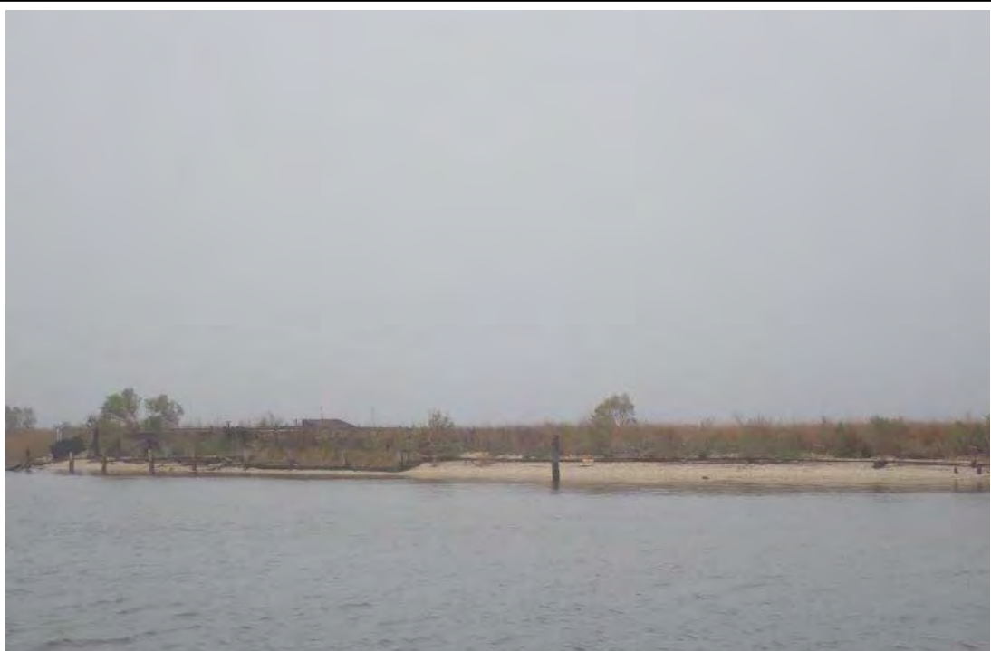
Photograph 108. Site 18: Damaged Oil Field Facility (29°32'22.89"N, 89°54'16.42"W)