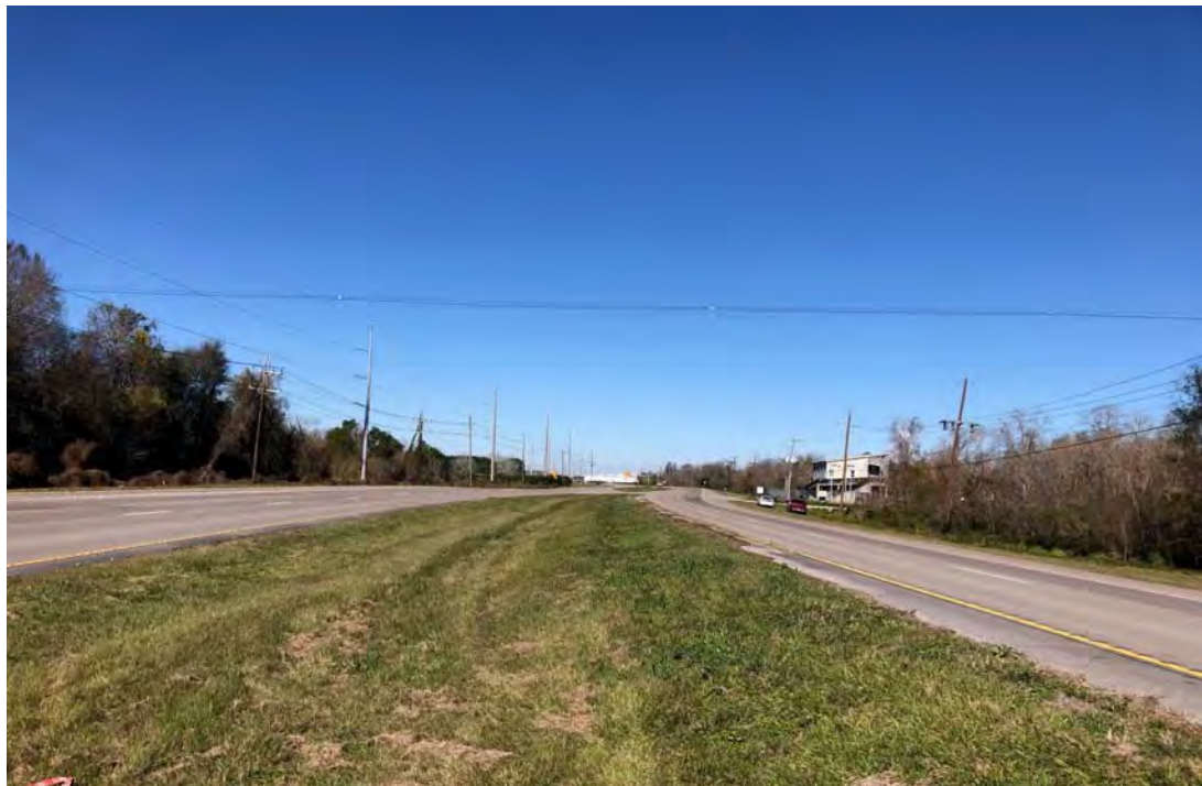
Photograph 33. Overview of Highway Area 3 Facing North (29°39'43.14"N, 89°58'31.14"W)