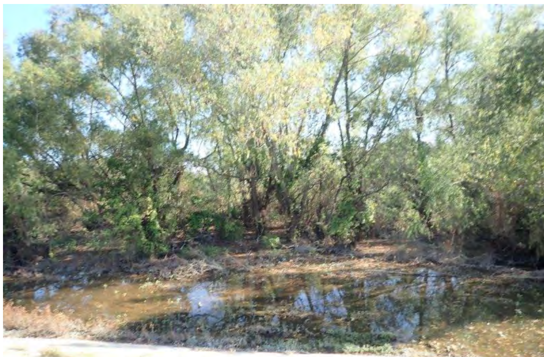
Photograph 2. Overview of Mississippi River Levee Area 1 Facing East