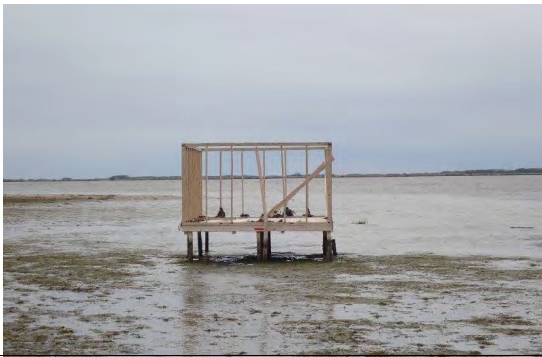
Photograph 83. Partially Constructed Camp (29°38'35.02"N, 90°0'6.35"W)