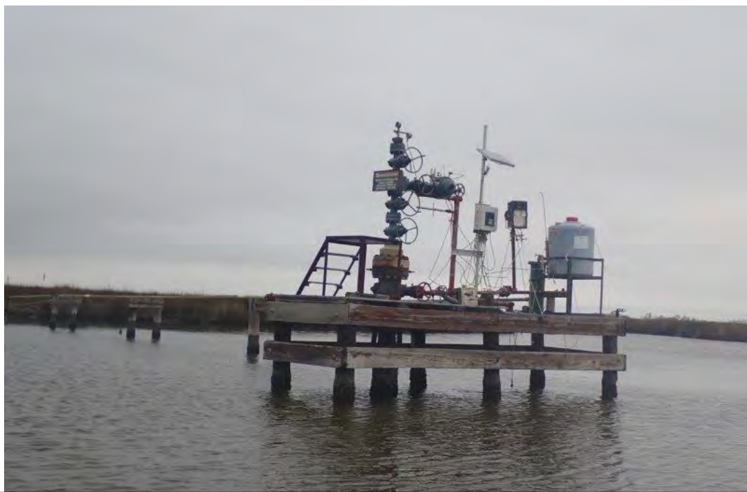
Photograph 145. Site 40: Well Platform (29°35'40.39"N, 90°1'37.96"W)