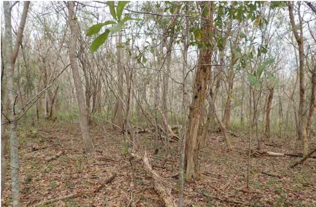
Photograph 17. Overview of Wooded Area 3 Facing North (29°39'28.95"N, 89°58'14.64"W)