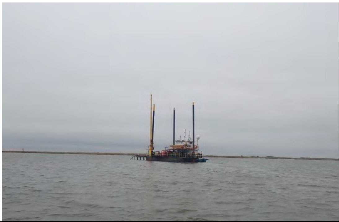
Photograph 127. Site 28: Well Platforms