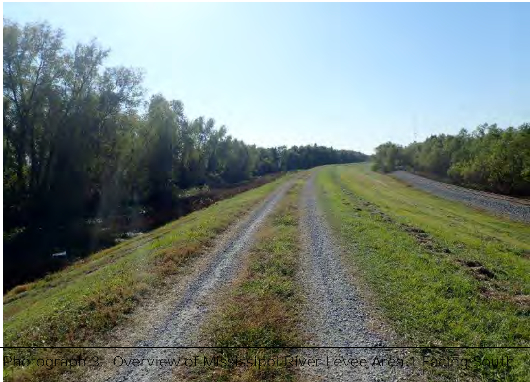
Photograph 3. Overview of Mississippi River Levee Area 1 Facing South