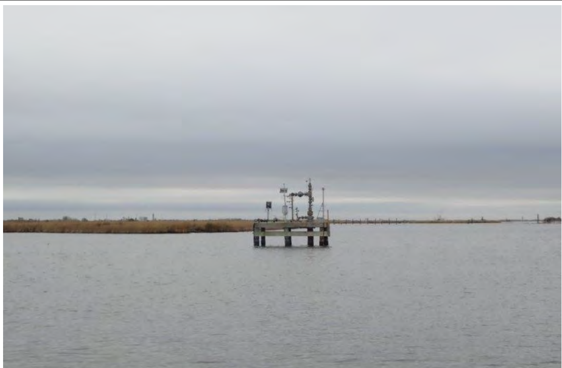
Photograph 135. Site 32: Oil Field Facility Structures