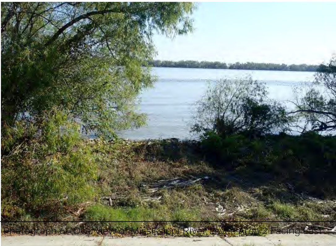
Photograph 6. Overview of Mississippi River Levee Area 2 Facing East