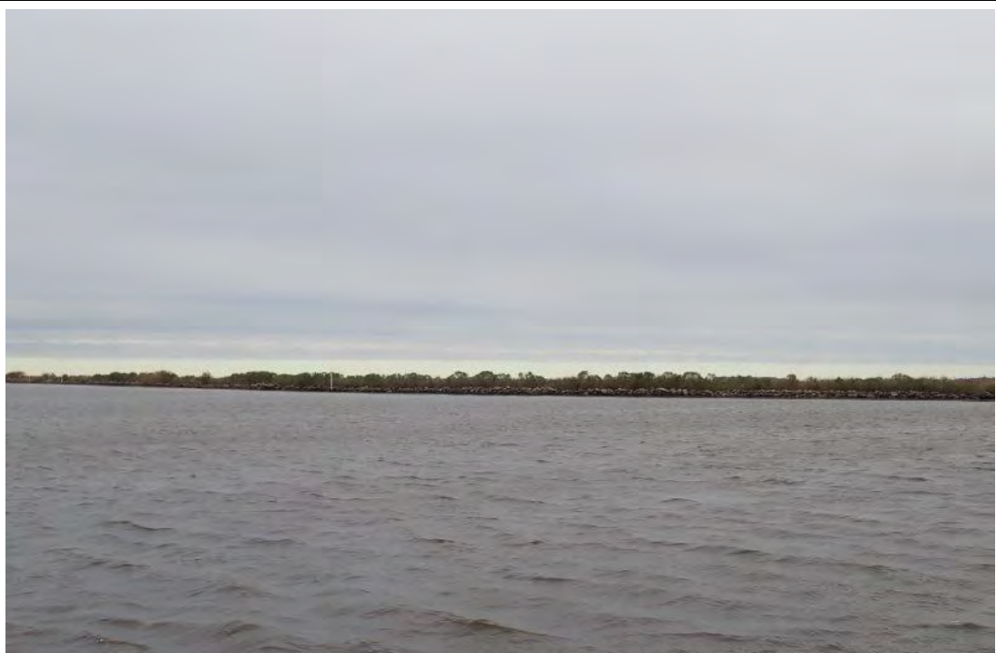
Photograph 49. Overview of Outfall Area 1 Facing North (29°38'27.11"N, 89°59'29.45"W)