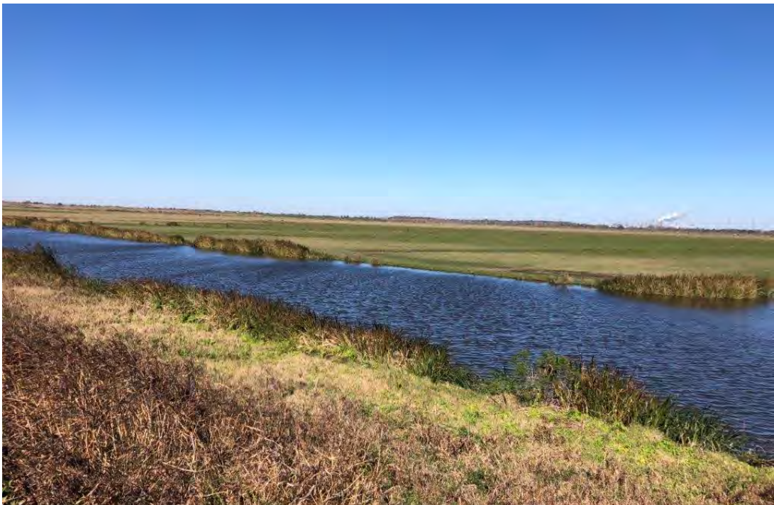
Photograph 45. Overview of Parish Levee Area Facing North GPS: 28.6241 N, 89.5129 W