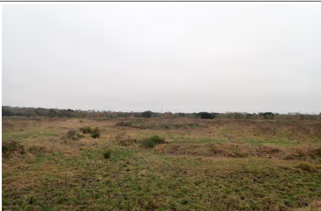
Photograph 38. Overview of Pasture Area 1 Facing East