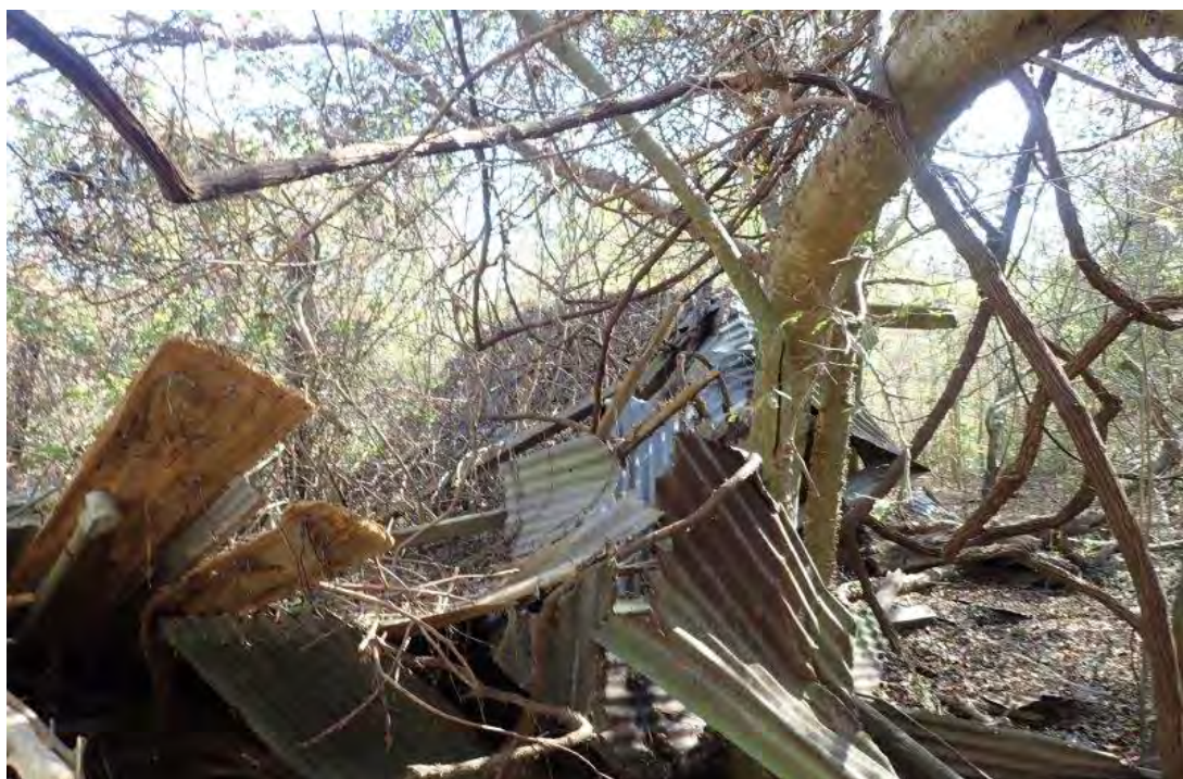
Photograph 66. Abandoned Barn