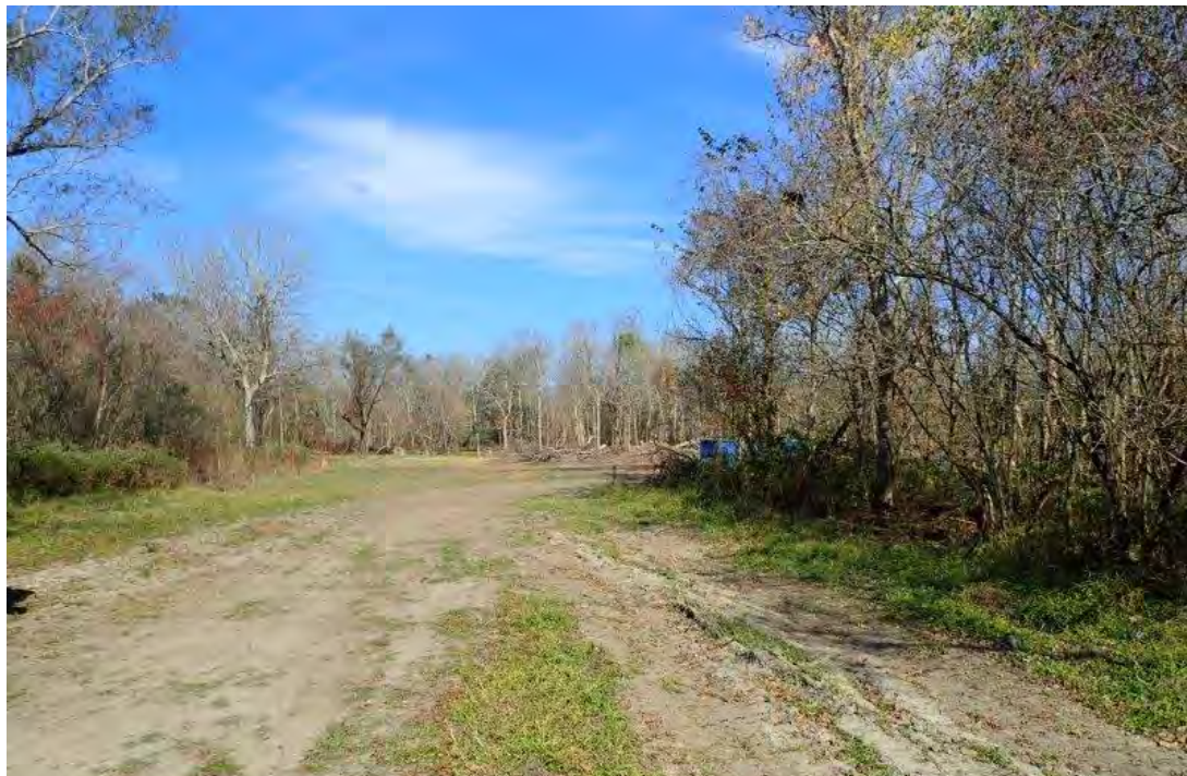
Photograph 9. Overview of Wooded Area 1 Facing North (29°39'39.82"N, 89°57'59.45"W)