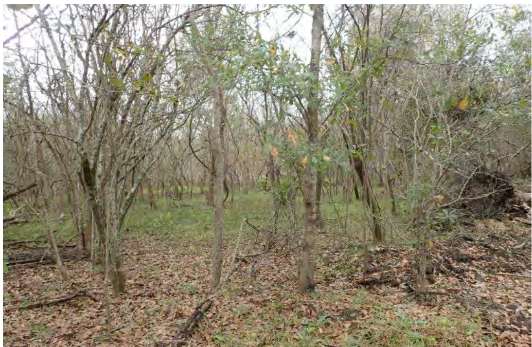
Photograph 16. Overview of Wooded Area 2 Facing West