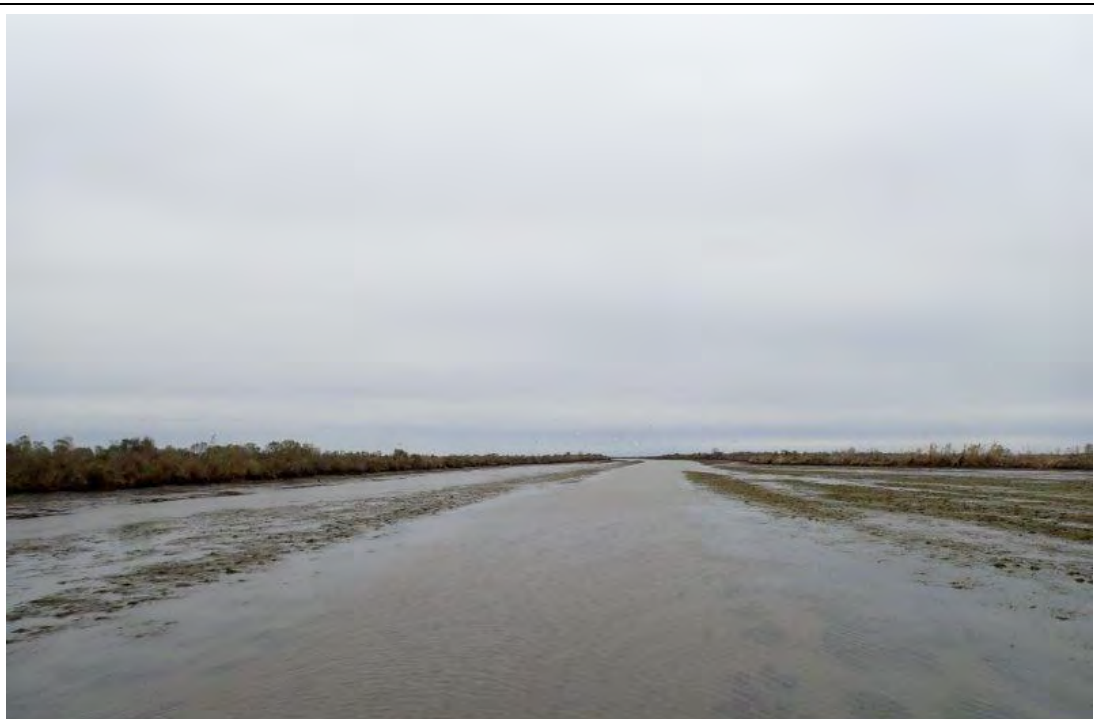
Photograph 58. View from East Access Channel Area 2 Facing South (29°37'55.15"N, 89°59'14.74"W)