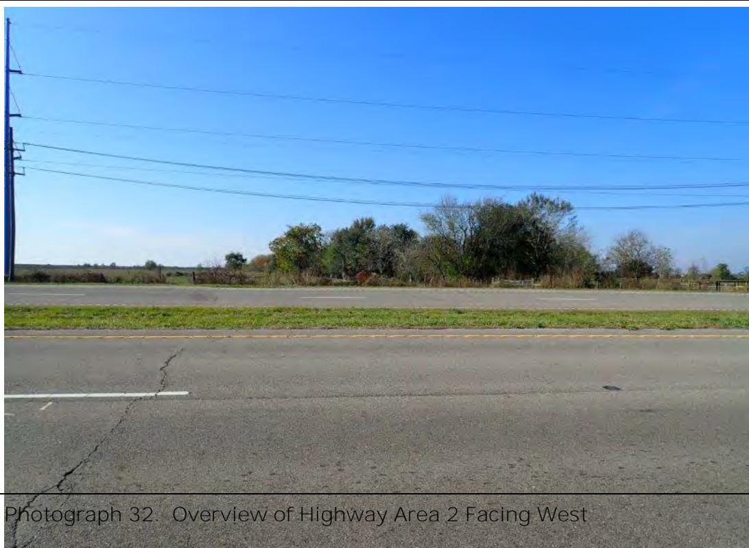
Photograph 32. Overview of Highway Area 2 Facing West