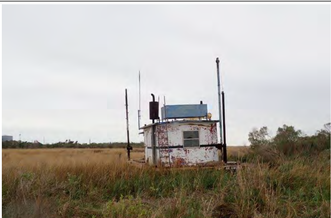
Photograph 118. Site 22: Storm Damaged Work Boat