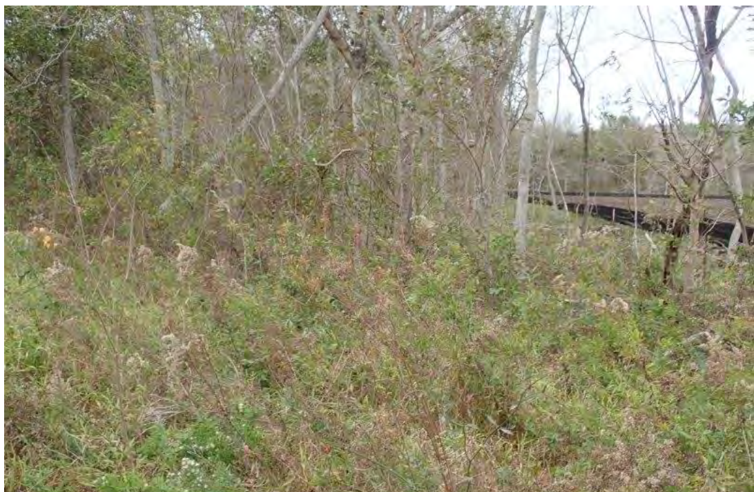
Photograph 24: Overview of Wooded Area 4 Facing West