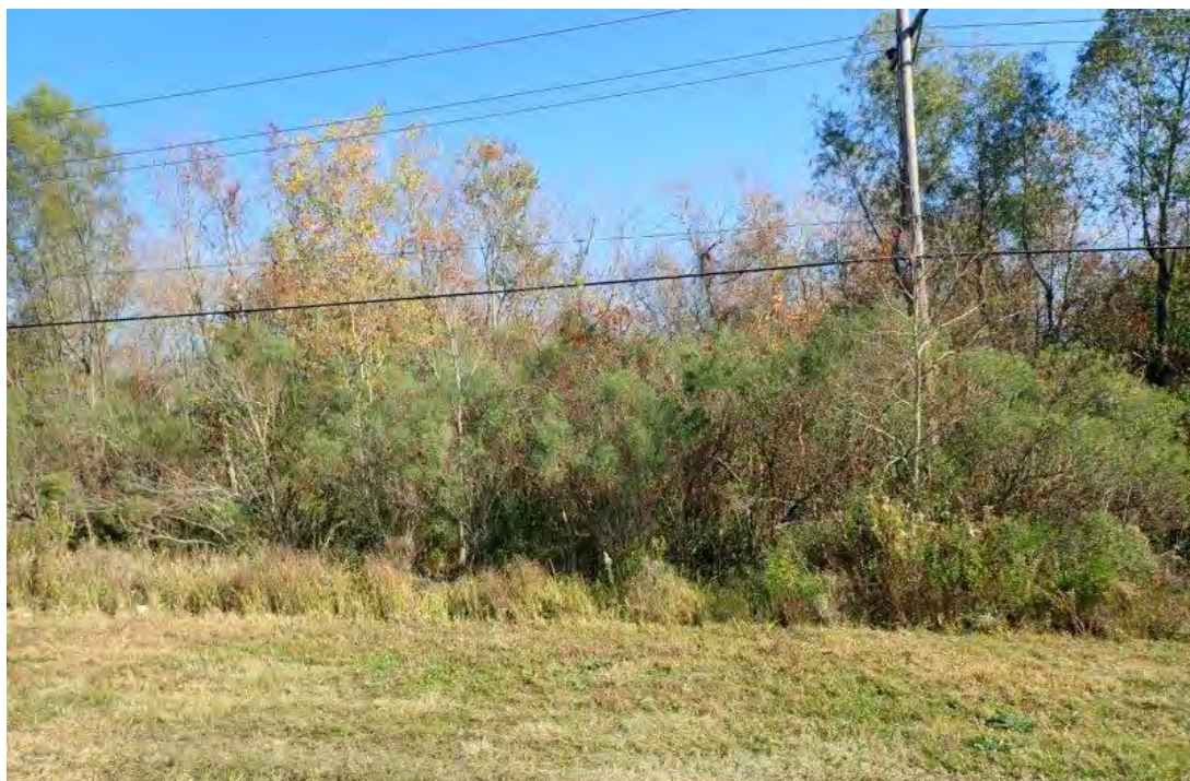
Photograph 26. Overview of Highway Area 1 Facing East