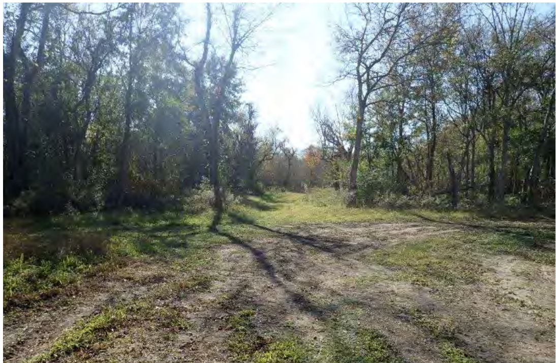
Photograph 11. Overview of Wooded Area 1 Facing South