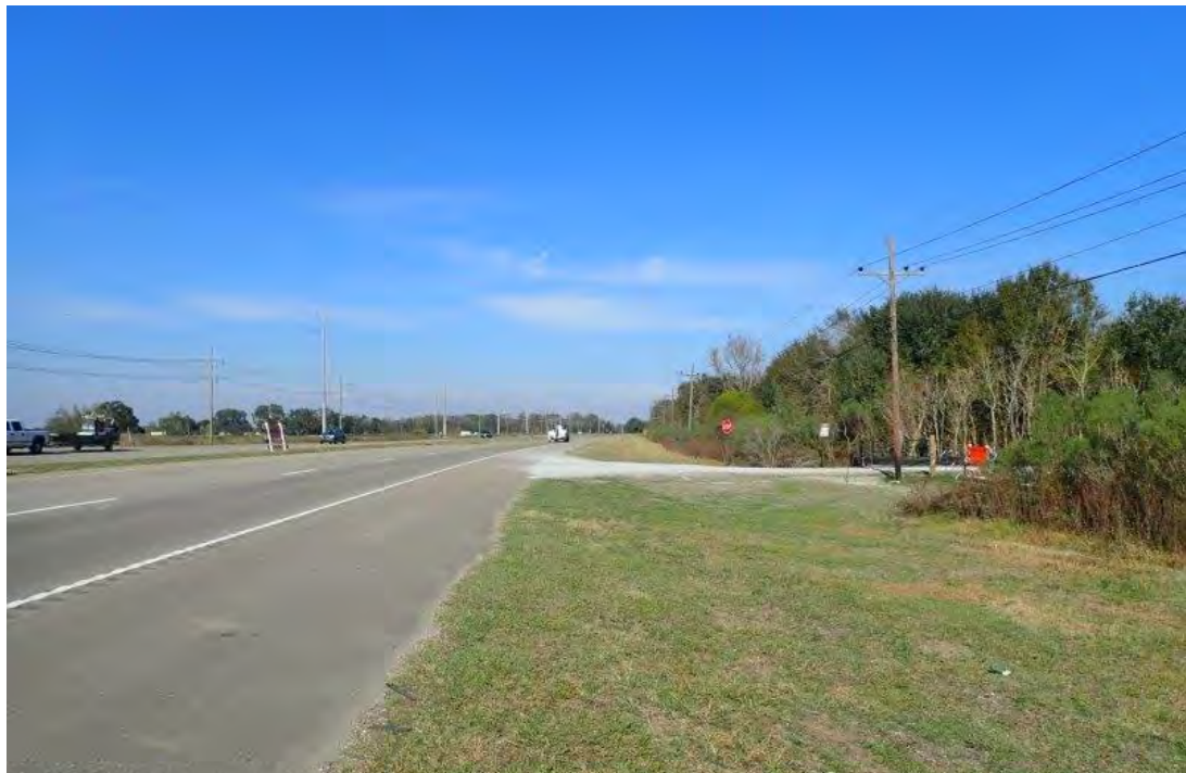
Photograph 29. Overview of Highway Area 2 Facing North (29°39'14.22"N, 89°58'15.60"W)