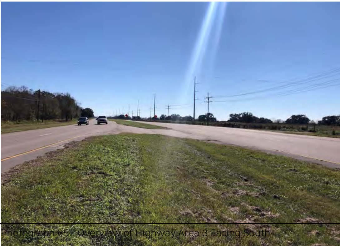
Photograph 35 - Overview of Highway Area 3 Facing South