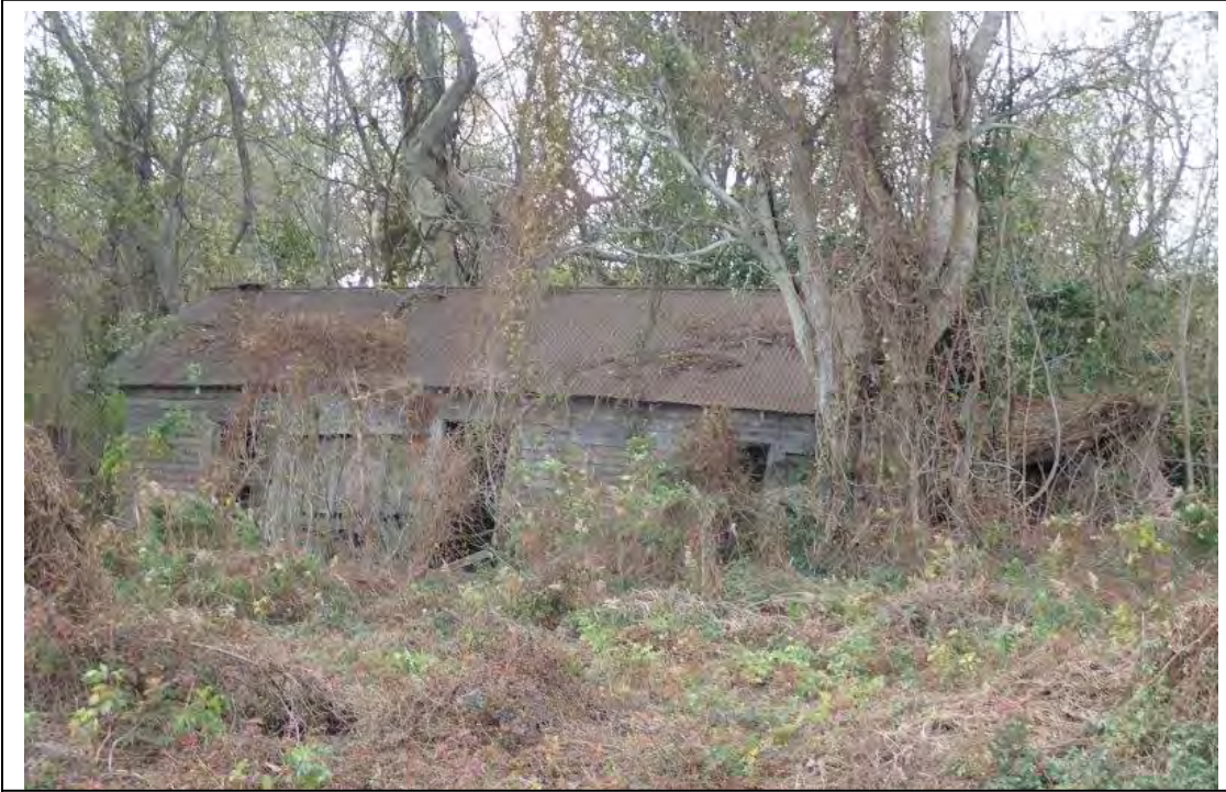
Photograph 79. Abandoned Wooden House (29°39'47.77"N, 89°58'34.01"W)