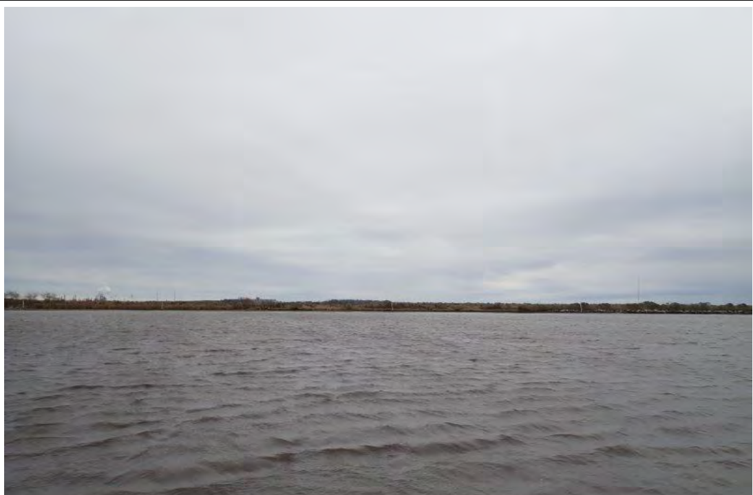
Photograph 53. Overview of Outfall Area 2 Facing North (29°38'26.47"N, 89°59'46.56"W)