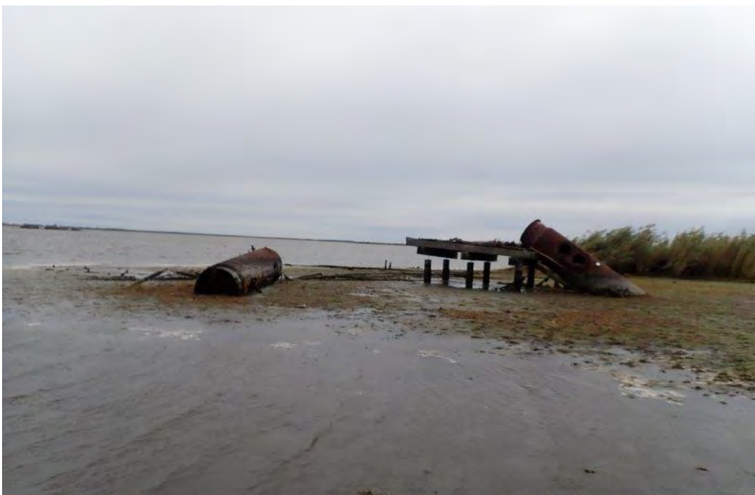
Photograph 89. Site 2: Damaged Oil Field Facility