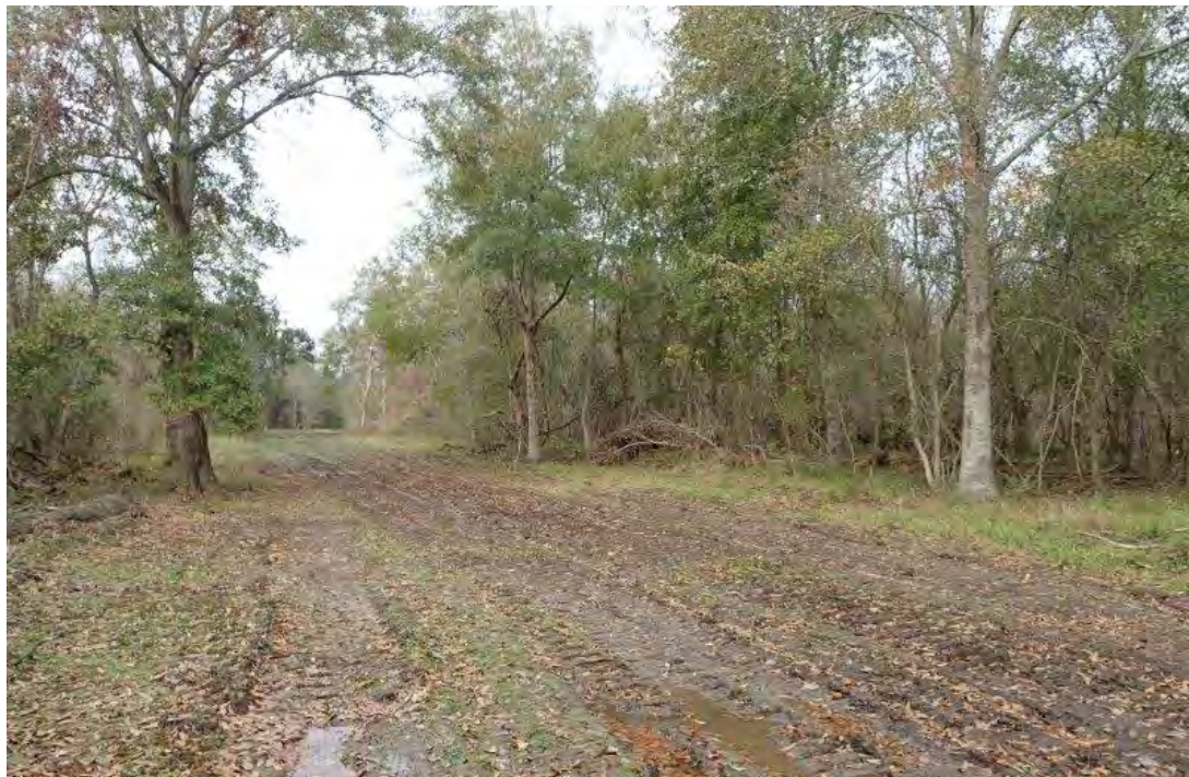
Photograph 13. Overview of Wooded Area 2 Facing North (29°39'32.80"N, 89°58'6.08"W)