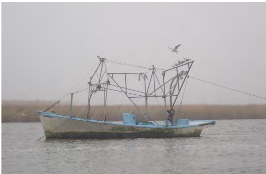
Photograph 103. Site 13: Moored Shrimp Boat (29°31'46.20"N, 89°54'5.84"W)