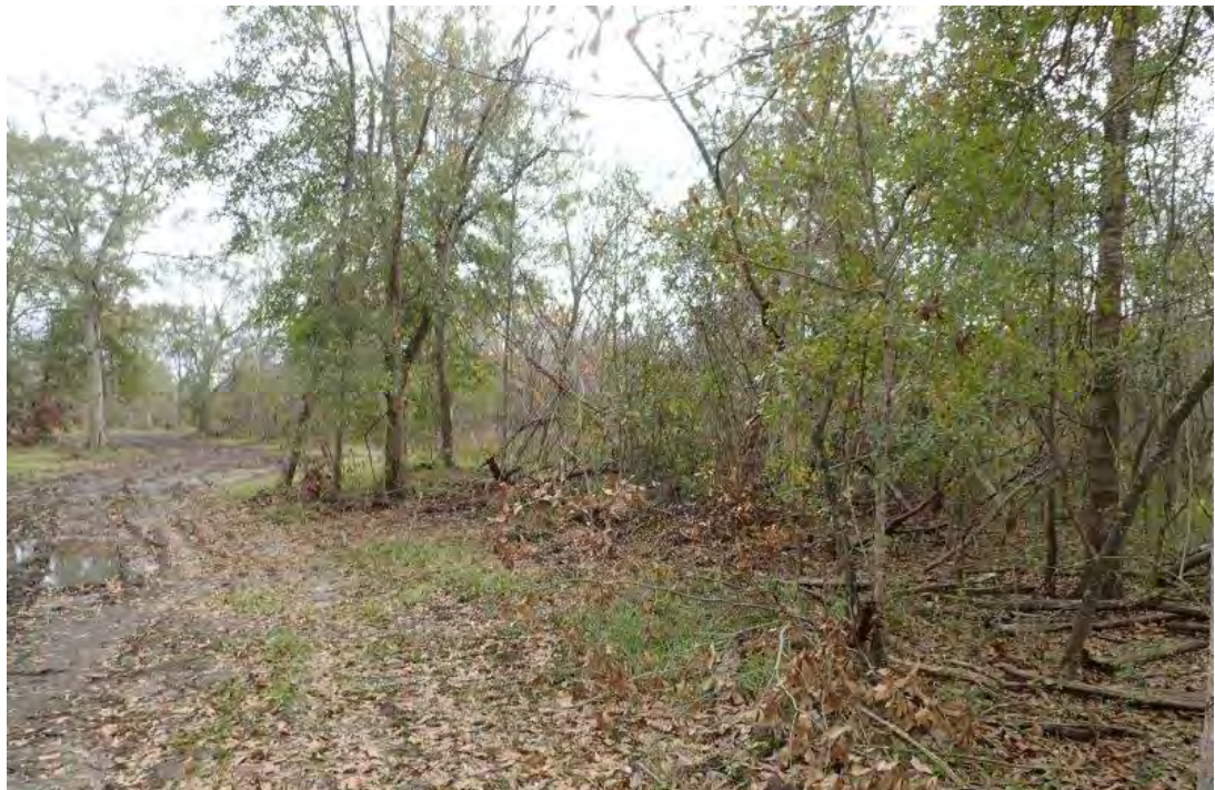
Photograph 15. Overview of Wooded Area 2 Facing South