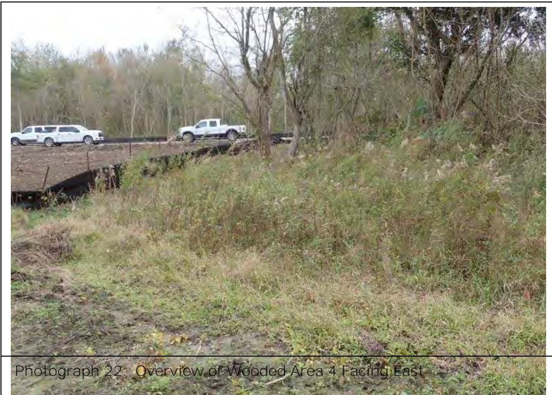
Photograph 22. Overview of Wooded Area 4 Facing East