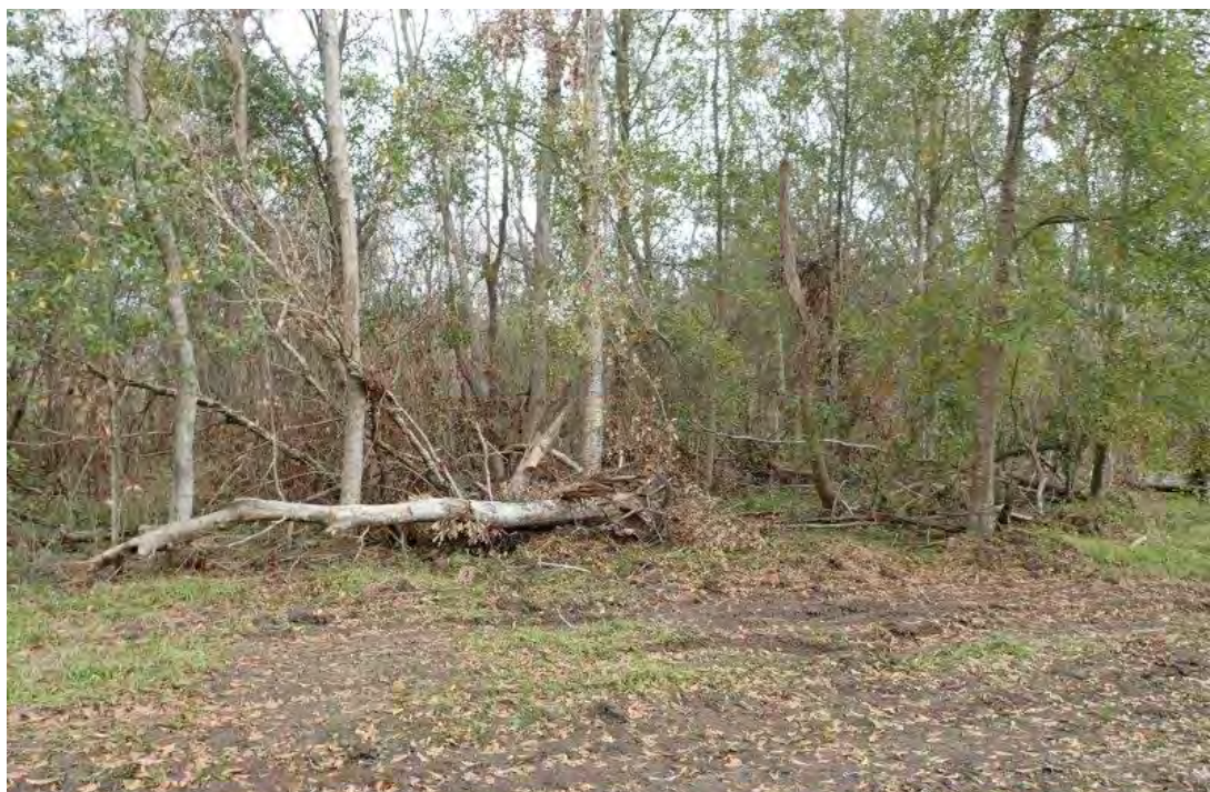
Photograph 14. Overview of Wooded Area 2 Facing East