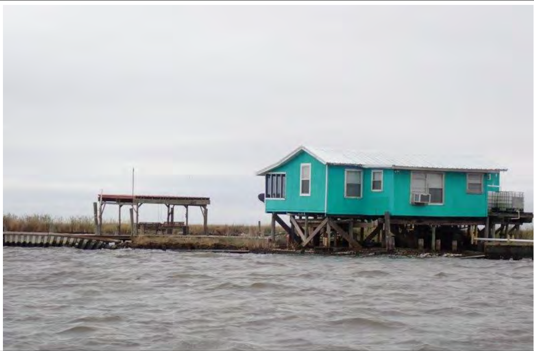
Photograph 123. Site 26: Camp Structures (29°32'7.74"N, 90°3'58.79"W)