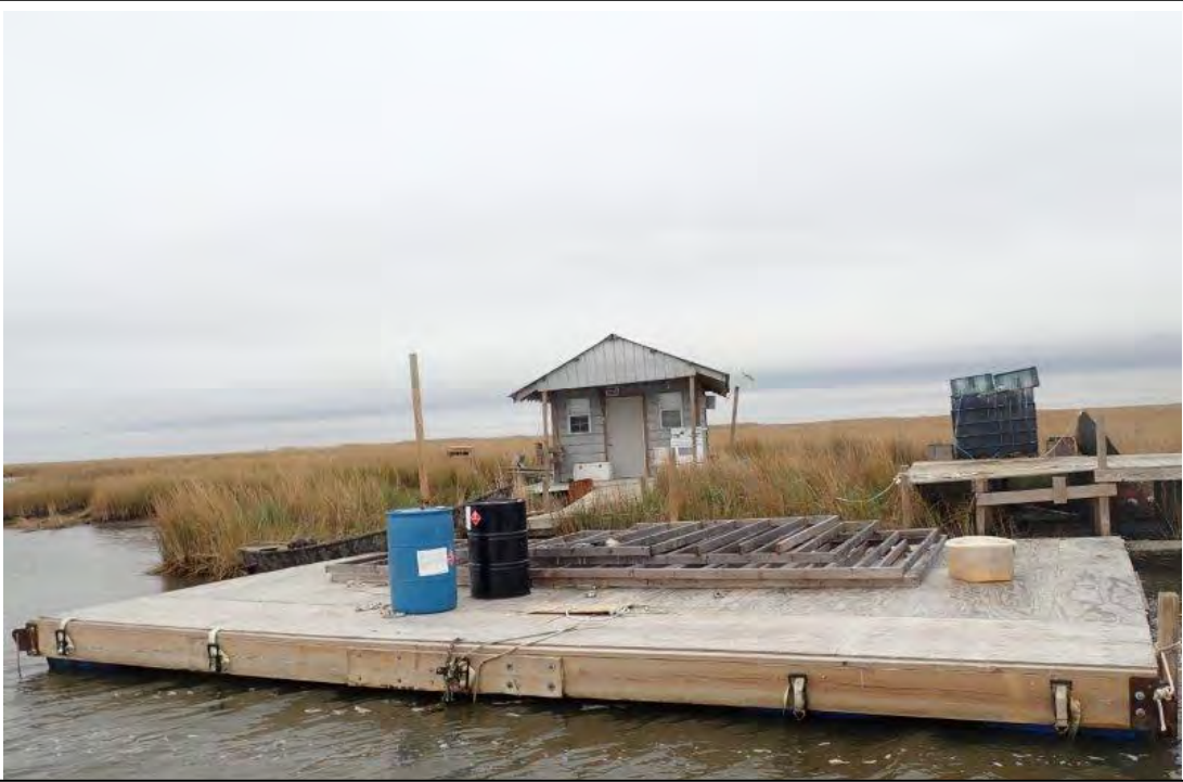
Photograph 121. Site 24: Camp with Pier (29°30'51.50"N, 90°3'31.52"W)