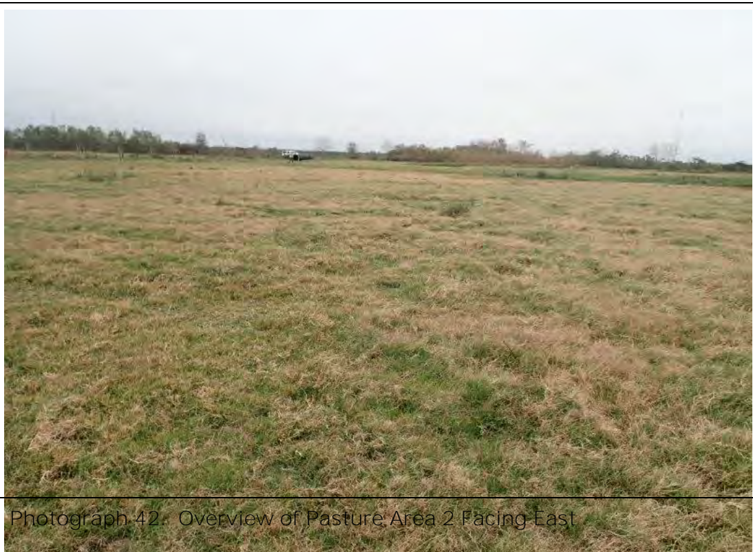
Photograph 42. Overview of Pasture Area 2 Facing East