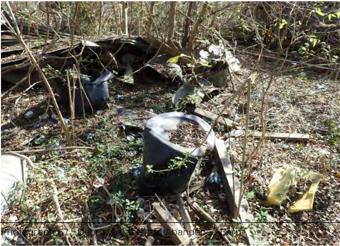
Photograph 67. Debris Adjacent to Abandoned Barn