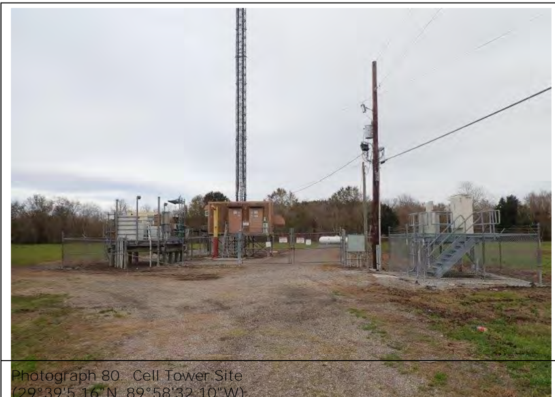
Photograph 80. Cell Tower Site (29°39'5.16"N, 89°58'32.10"W)