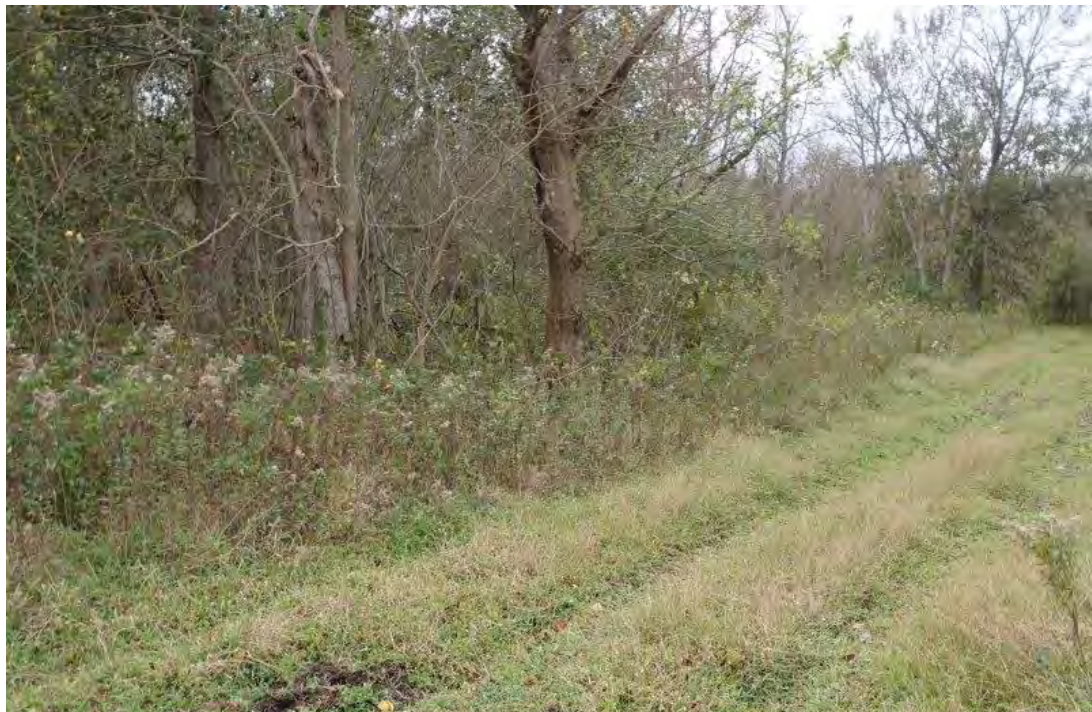
Photograph 23: Overview of Wooded Area 4 Facing South