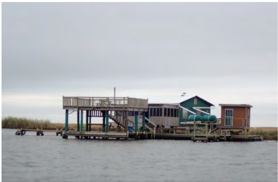
Photograph 131. Site 31: Camp Structure (29°33'24.44"N, 90°4'25.75"W)