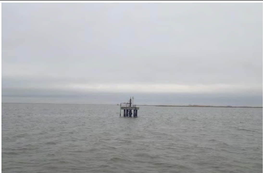
Photograph 126. Site 28: Well Platforms (29°32'33.33"N, 90°3'5.48"W)