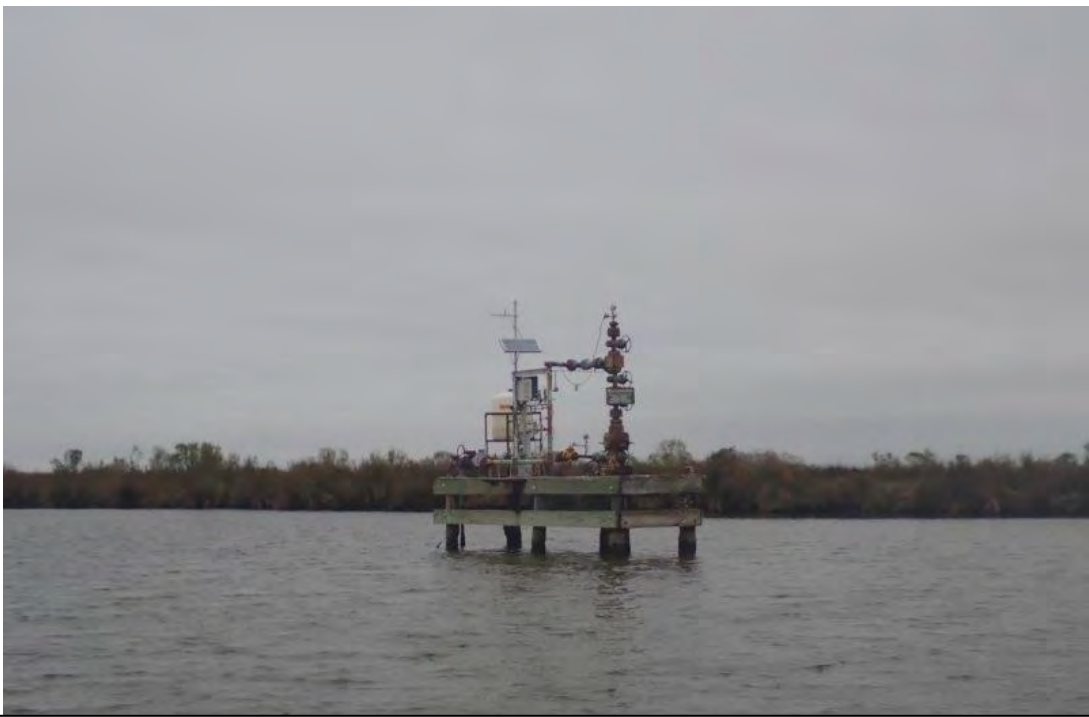
Photograph 143. Site 39: Well Platform (29°34'7.73"N, 90°1'21.76"W)