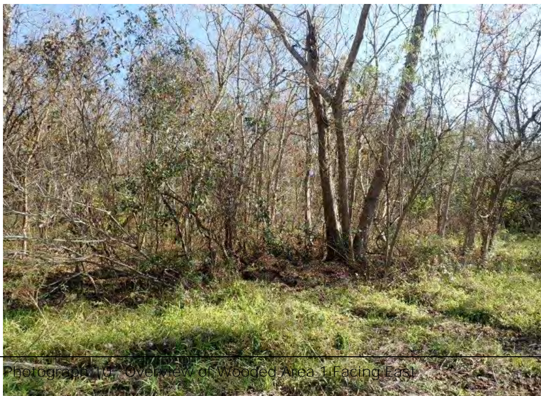
Photograph 10. Overview of Wooded Area 1 Facing East