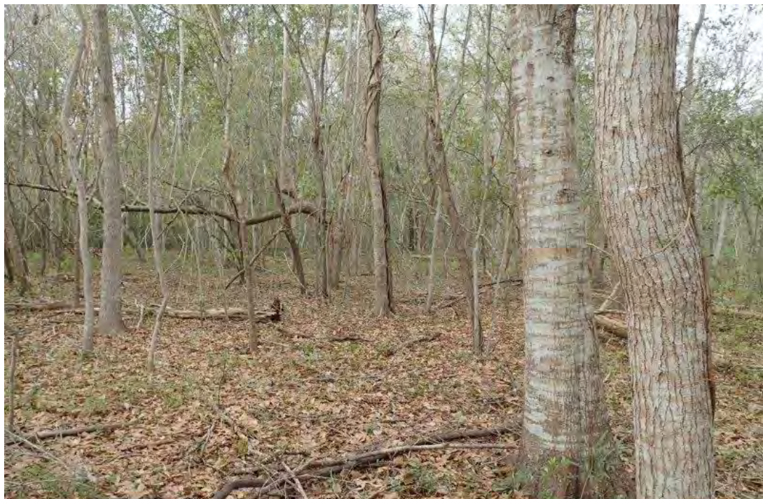
Photograph 20. Overview of Wooded Area 3 Facing West