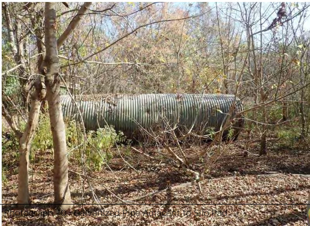
Photograph 70. Galvanized Pipe Adjacent to Silo Pad