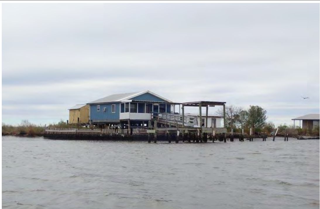
Photograph 93. Site 6: Multiple Camp Structures (29°36'1.46"N, 89°57'14.04"W)