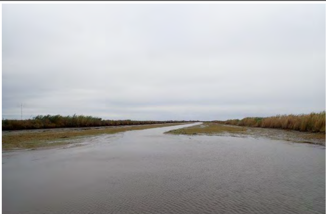
Photograph 57. View from East Access Channel Area 1 Facing Southeast (29°38'8.72"N, 89°59'37.03"W)