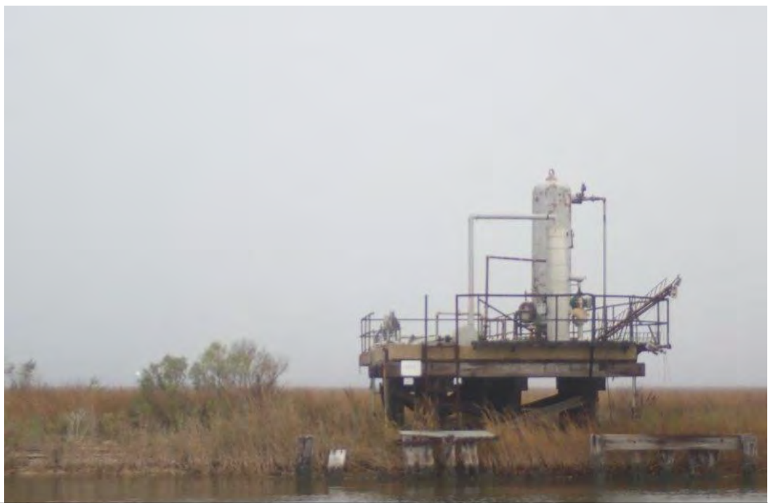
Photograph 109. Site 18: Oilfield Condensate Structure