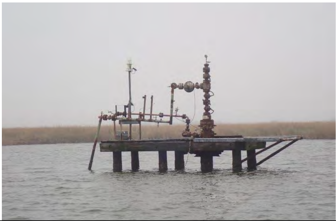
Photograph 107. Site 17: Well Platform (29°32'19.86"N, 89°54'22.60"W)