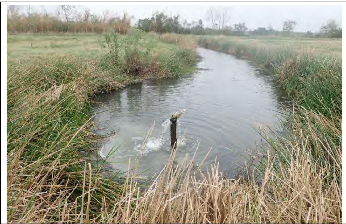
Photograph 82 - Flowing Water Well (29°38'46.67"N, 89°58'56.68"W)