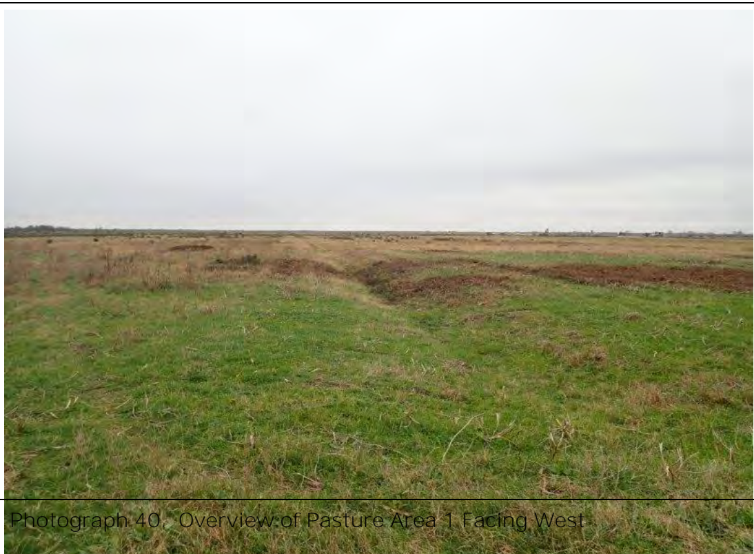
Photograph 40. Overview of Pasture Area 1 Facing West