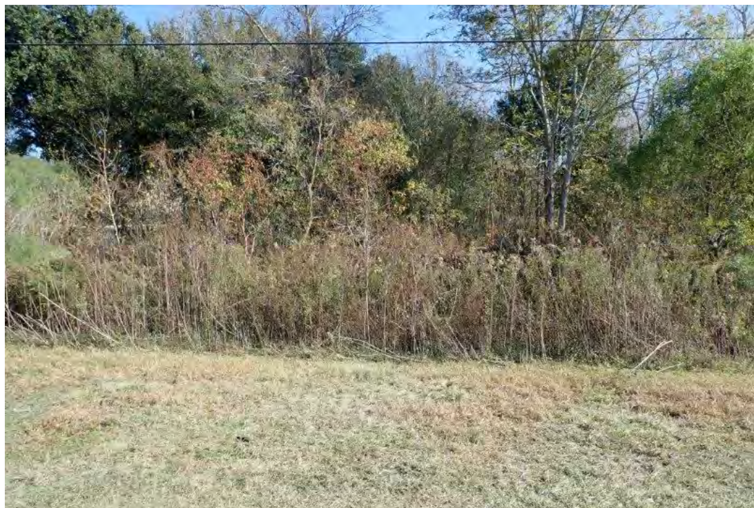
Photograph 30. Overview of Highway Area 2 Facing East