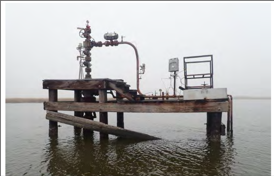
Photograph 99. Site 10: Well Platform (29°33'2.33"N, 89°54'36.00"W)