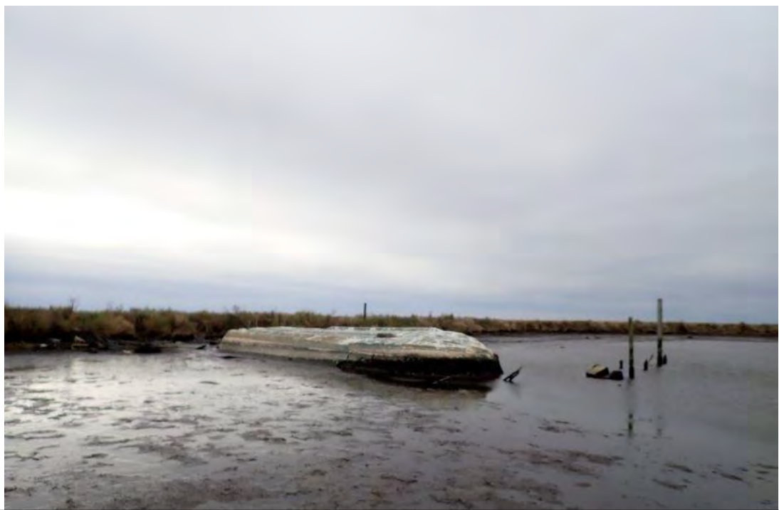
Photograph 91. Site 4: Capsized Boat (29°35'20.83"N, 89°58'28.13"W)