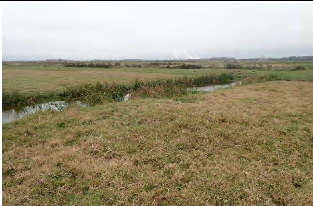
Photograph 41. Overview of Pasture Area 2 Facing North (29°39'48.30"N, 89°59'5.12"W)