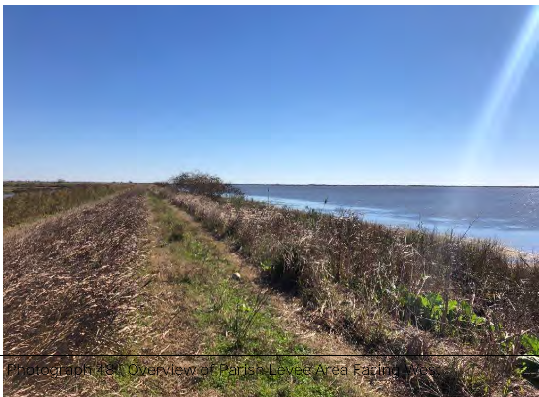
Photograph 48: Overview of Parish Levee Area Facing West