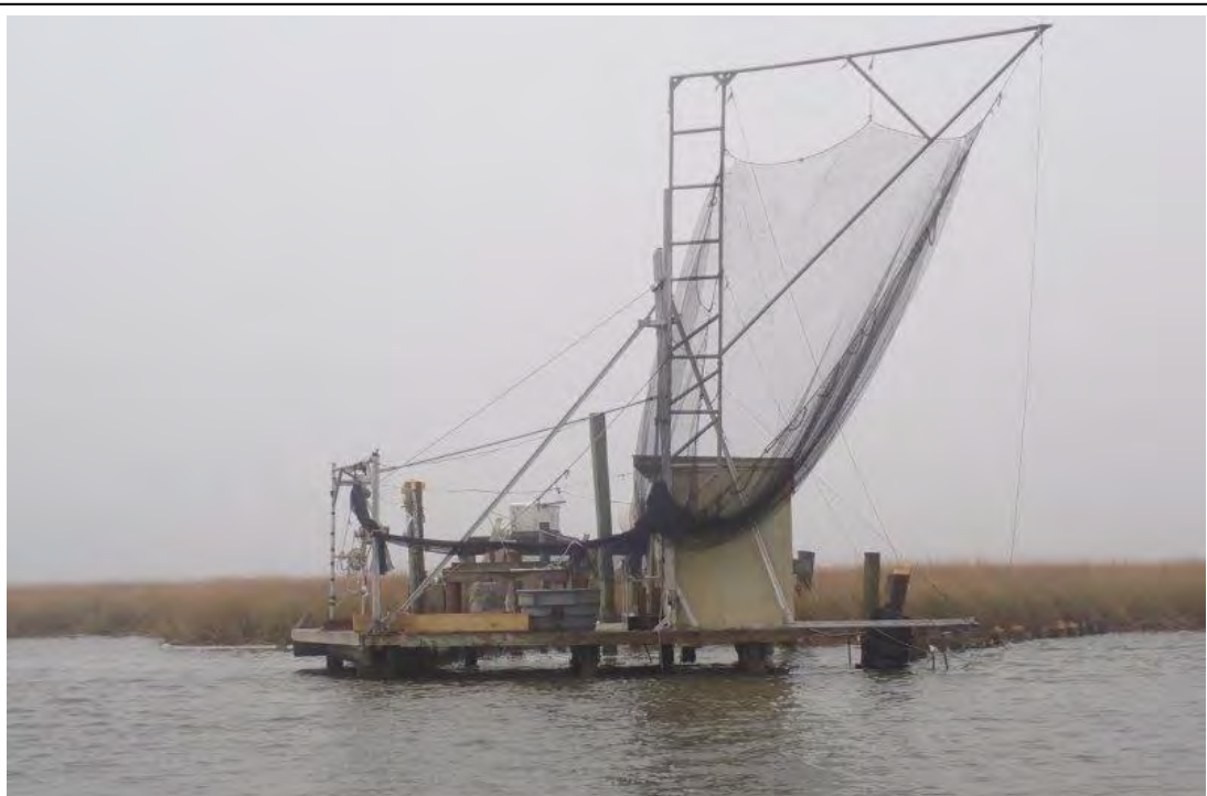
Photograph 104. Site 14: Shrimp Net Platform (29°31'38.24"N, 89°54'12.39"W)