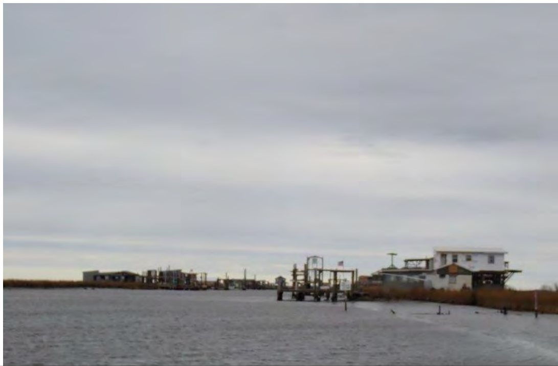
Photograph 111. Site 19: Grouping of Camps (29°33'17.97"N, 89°57'16.83"W)