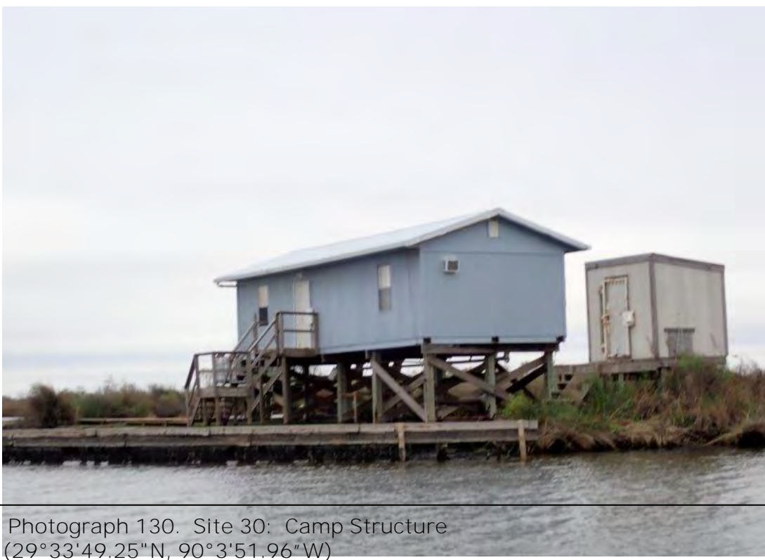
Photograph 130. Site 30: Camp Structure (29°33'49.25"N, 90°3'51.96"W)