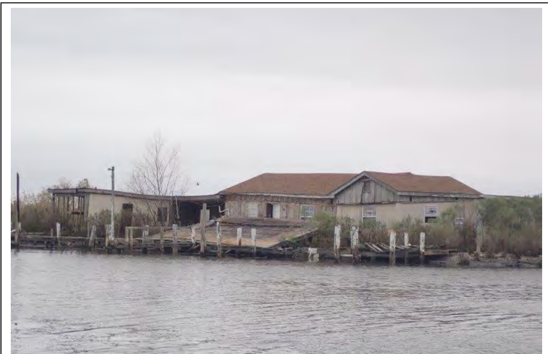
Photograph 140. Site 36: Abandoned Camp and Boatshed Complex (29°36'47.12"N, 90°2'59.27"W)