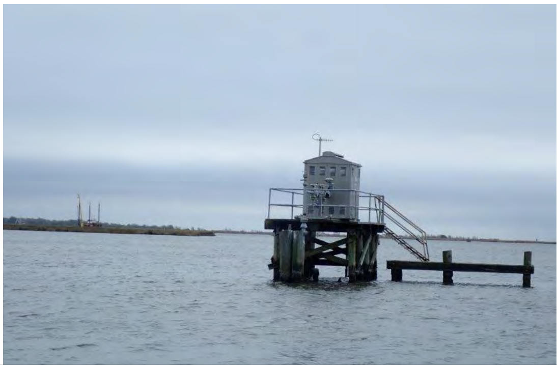
Photograph 125. Site 27: Oil Field / Pipeline Metering Platform (29°32'40.15"N, 90°3'36.20"W)