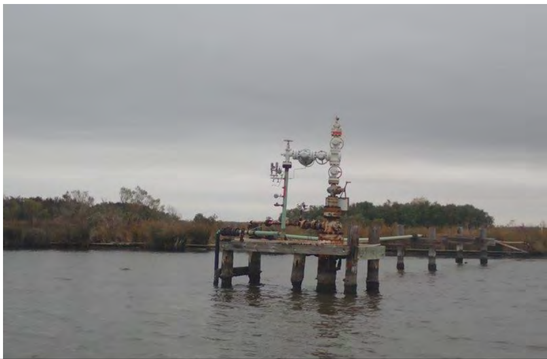
Photograph 147. Site 42: Well Platform (29°35'49.93"N, 90°1'43.70"W)