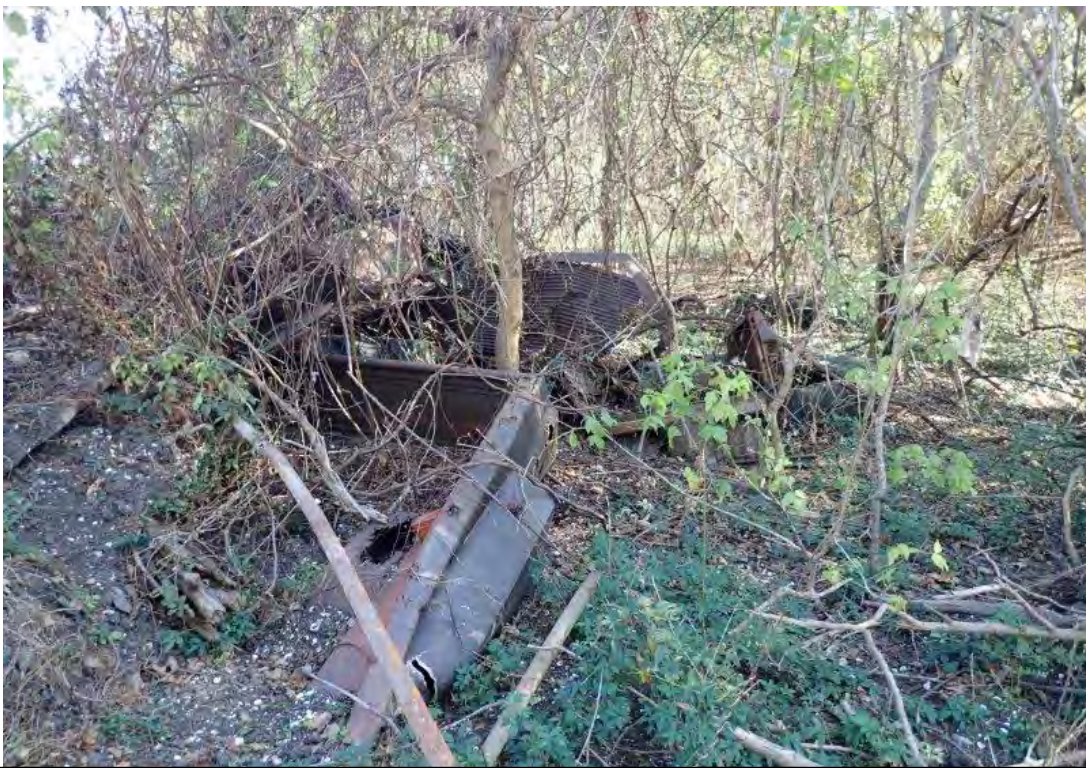
Photograph 72. Metal Waste Pile (29°39'48.18"N, 89°58'19.20"W)