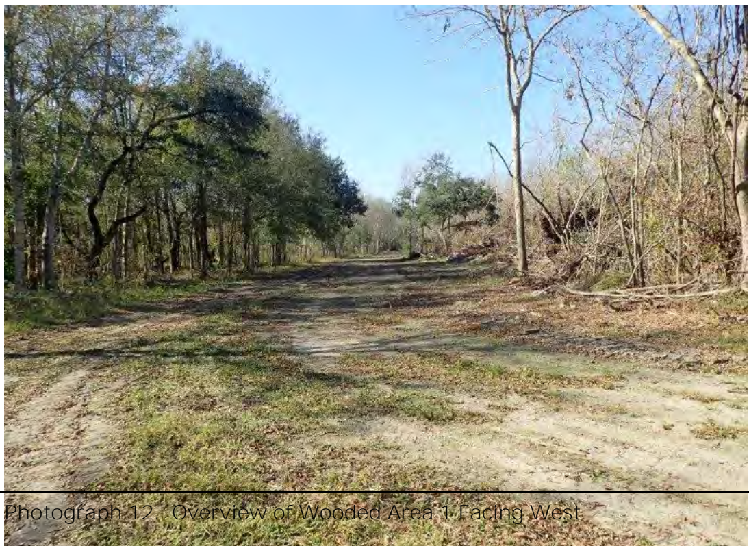
Photograph 12. Overview of Wooded Area 1 Facing West