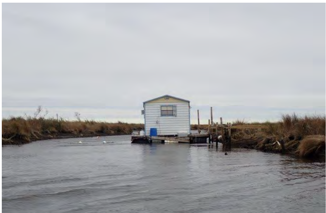
Photograph 142. Site 38: Floating Camp Structure (29°34'35.29"N, 89°59'12.66"W)