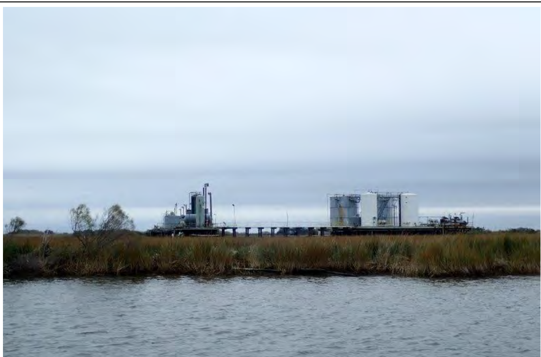
Photograph 132. Site 32: Oil Field Facility Structures (29°34'55.88"N, 90°3'40.42"W)