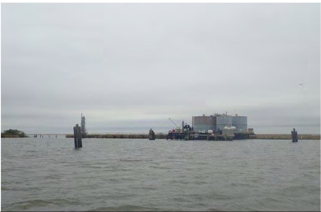
Photograph 122. Site 25: Oil Field Tank Battery with Flare Unit (29°32'21.78"N, 90°3'5.60"W)