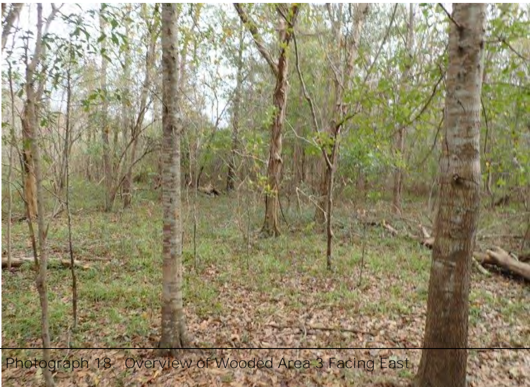
Photograph 18. Overview of Wooded Area 3 Facing East