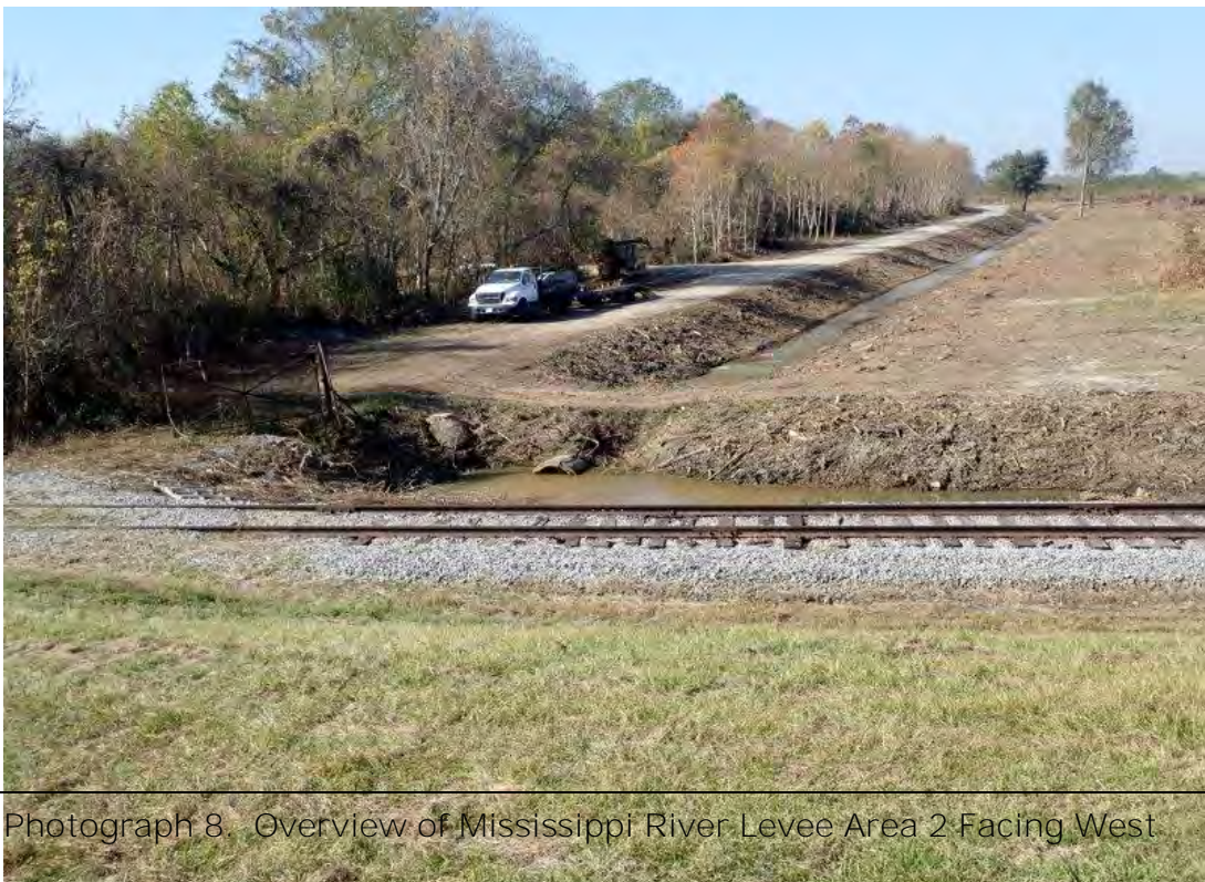
Photograph 8. Overview of Mississippi River Levee Area 2 Facing West