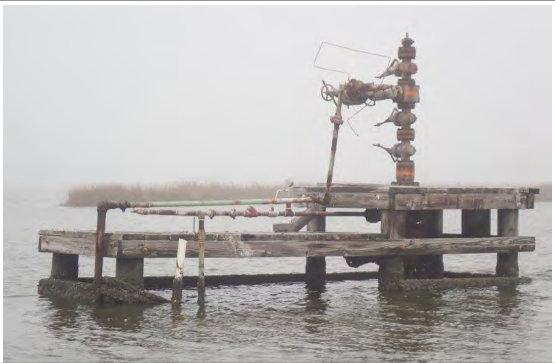
Photograph 101. Site 12: Well Platform (29°31'52.16"N, 89°54'12.25"W)