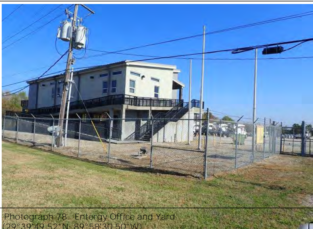
Photograph 78. Entergy Office and Yard (29°39'49.52" N, 89°58'30.50" W)