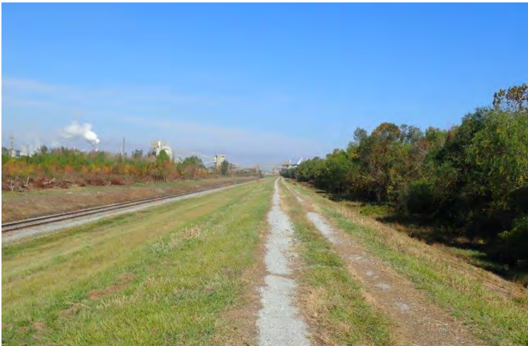
Photograph 5. Overview of Mississippi River Levee Area 2 Facing North (29°39'49.83"N, 89°57'48.43"W)