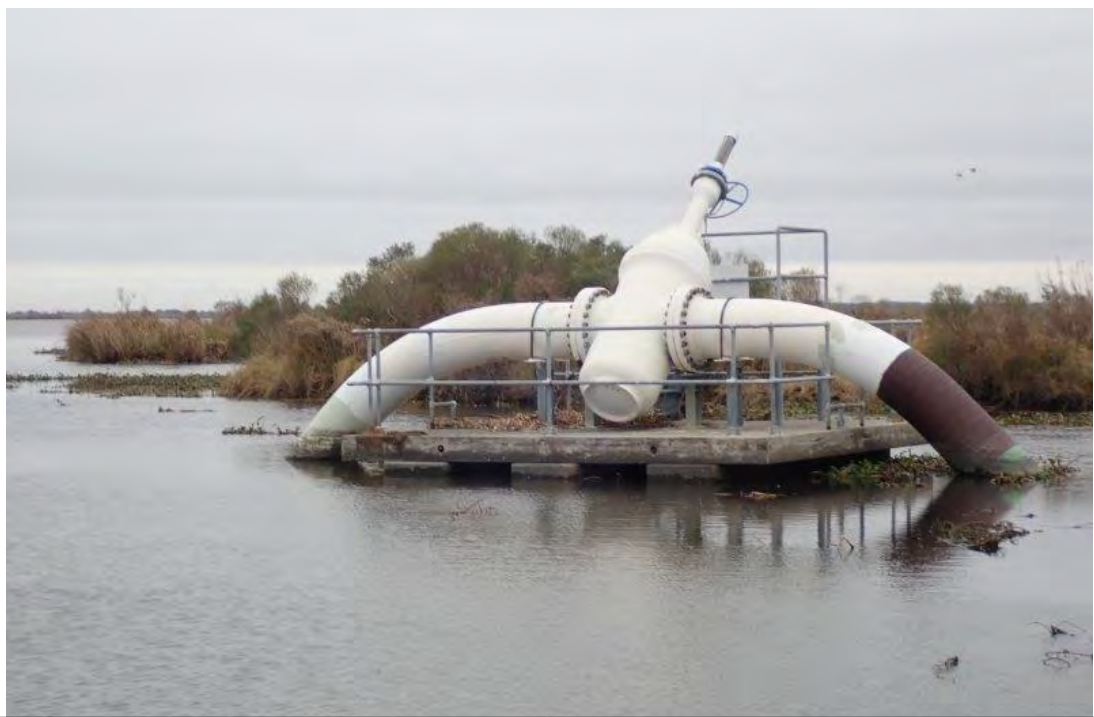
Photograph 141. Site 37: Pipeline Valve Structure (29°38'3.95"N, 90°3'52.48"W)