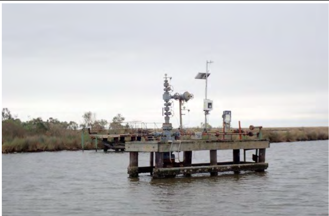
Photograph 128. Site 29: Oil Field Platforms (29°32'34.68"N, 90°3'43.28"W)