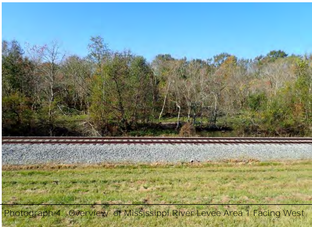
Photograph 4. Overview of Mississippi River Levee Area 1 Facing West