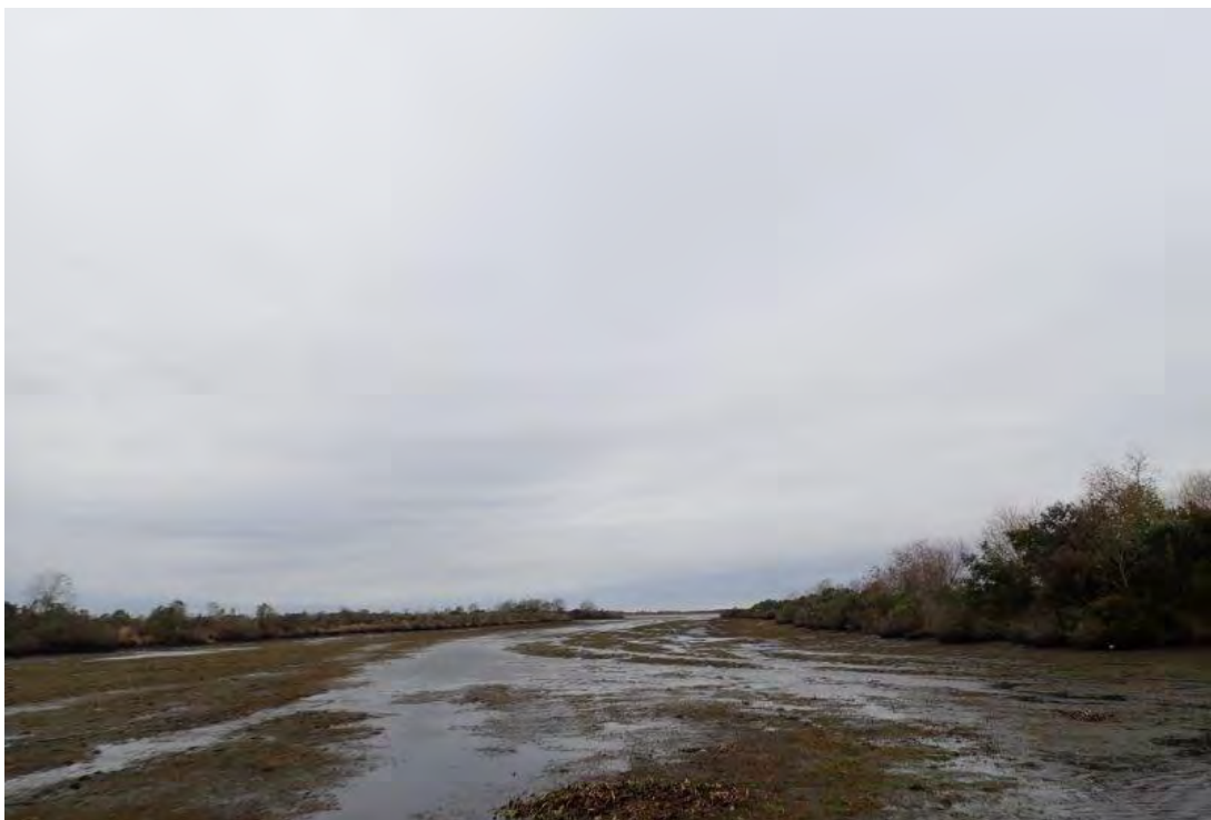
Photograph 61. View from West Access Channel Area 2 Facing West (29°37'33.14"N, 90°0'5.34"W)