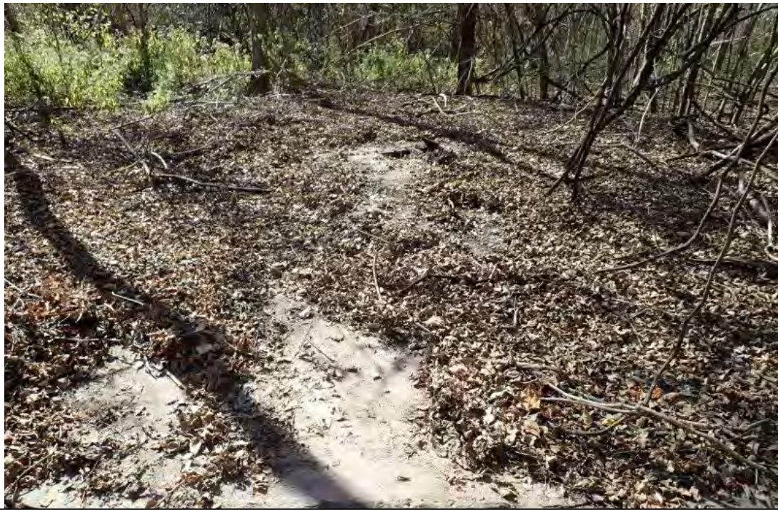
Photograph 69. Concrete Pad for Grain Silo (29°39'48.24"N, 89°58'1.08"W)