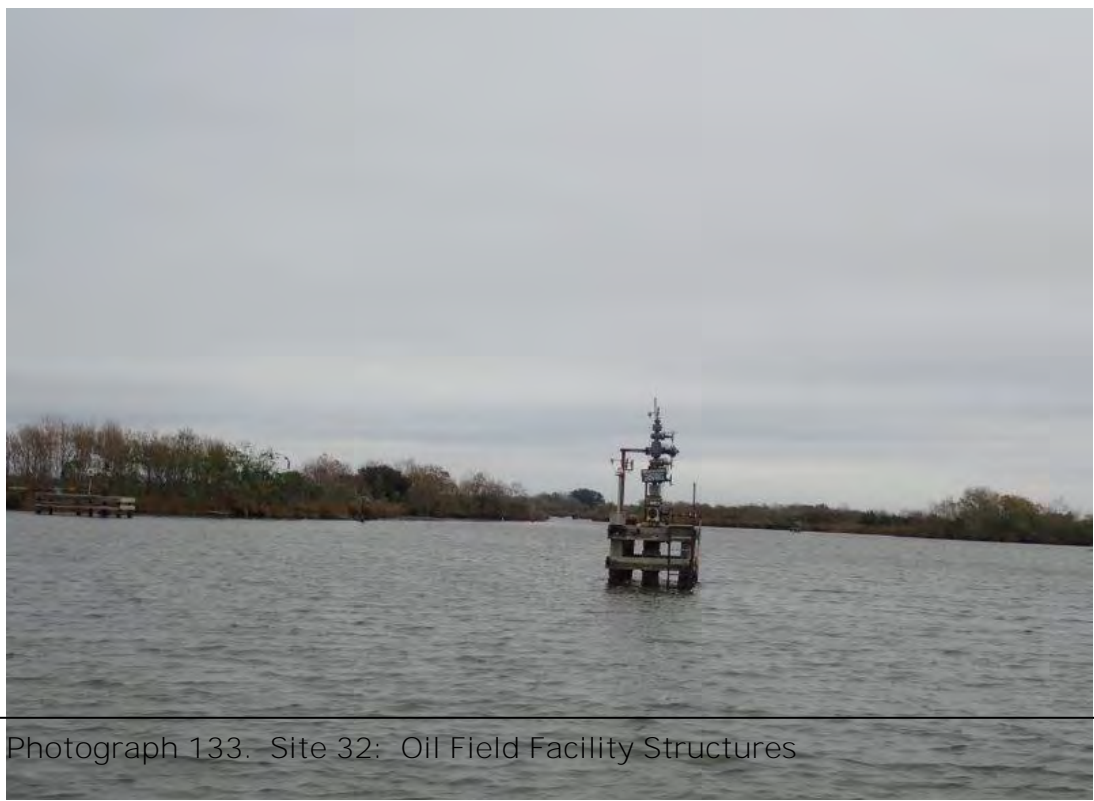
Photograph 133. Site 32: Oil Field Facility Structures