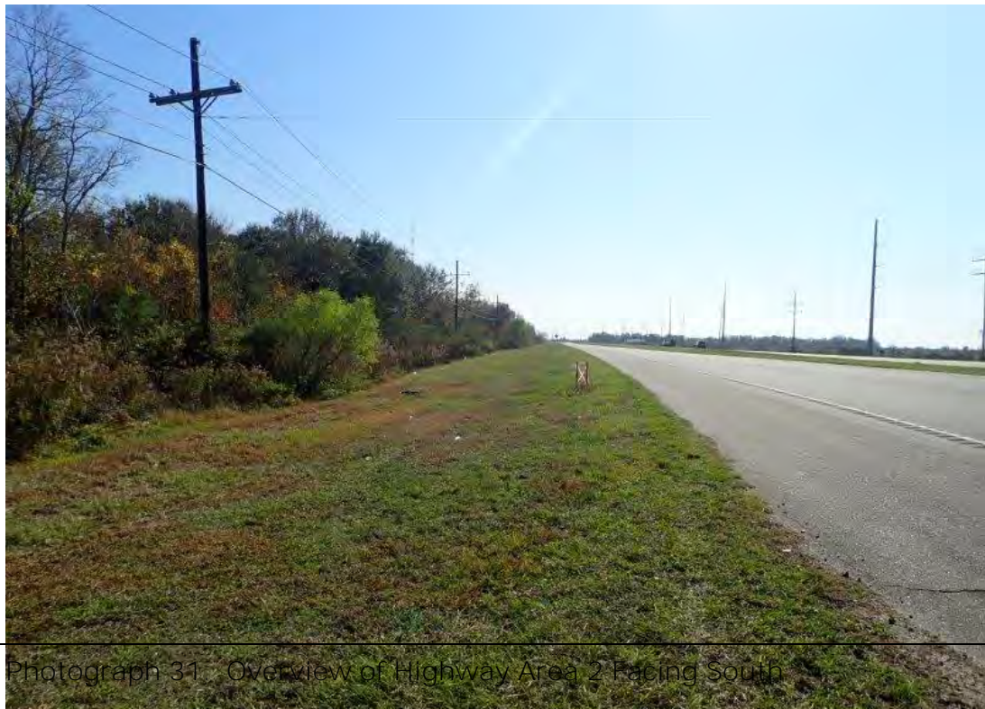
Photograph 31. Overview of Highway Area 2 Facing South