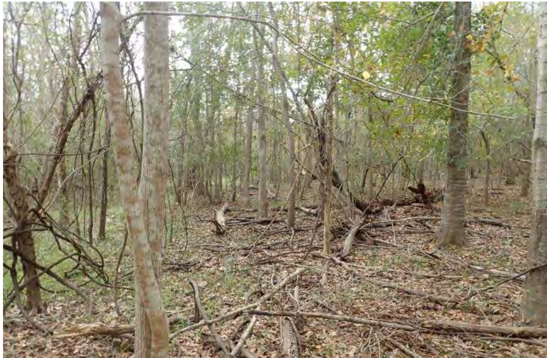
Photograph 19. Overview of Wooded Area 3 Facing South