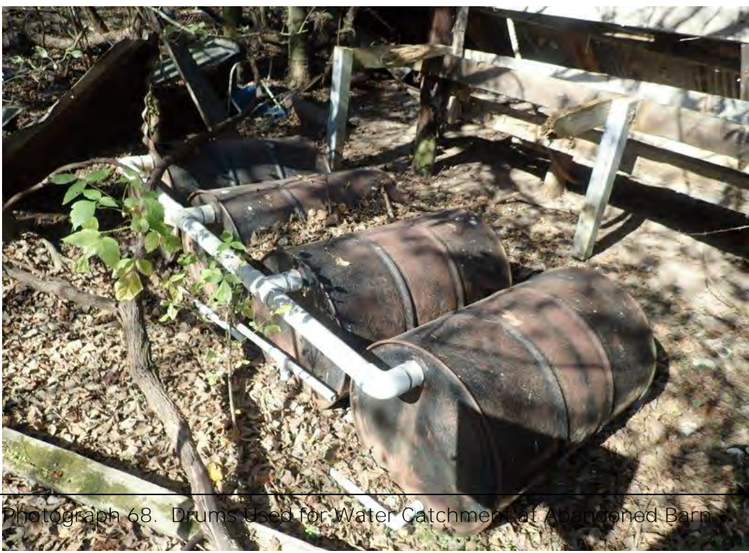
Photograph 68. Drums Used for Water Catchment at Abandoned Barn