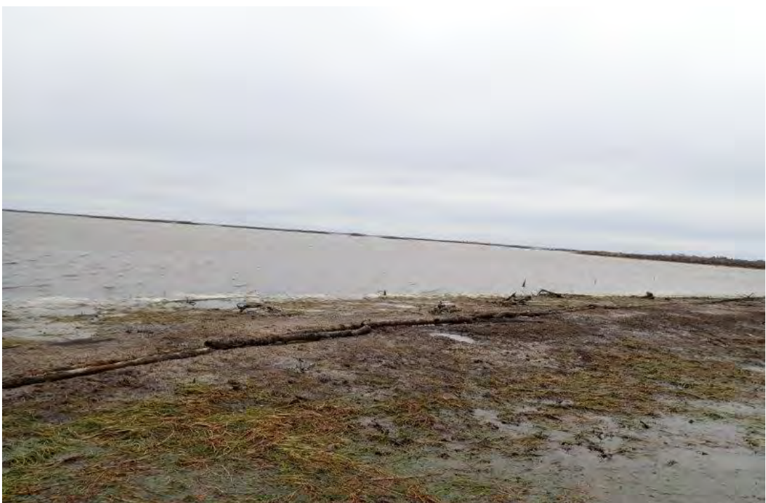
Photograph 88. Site 2: Damaged Oil Field Facility