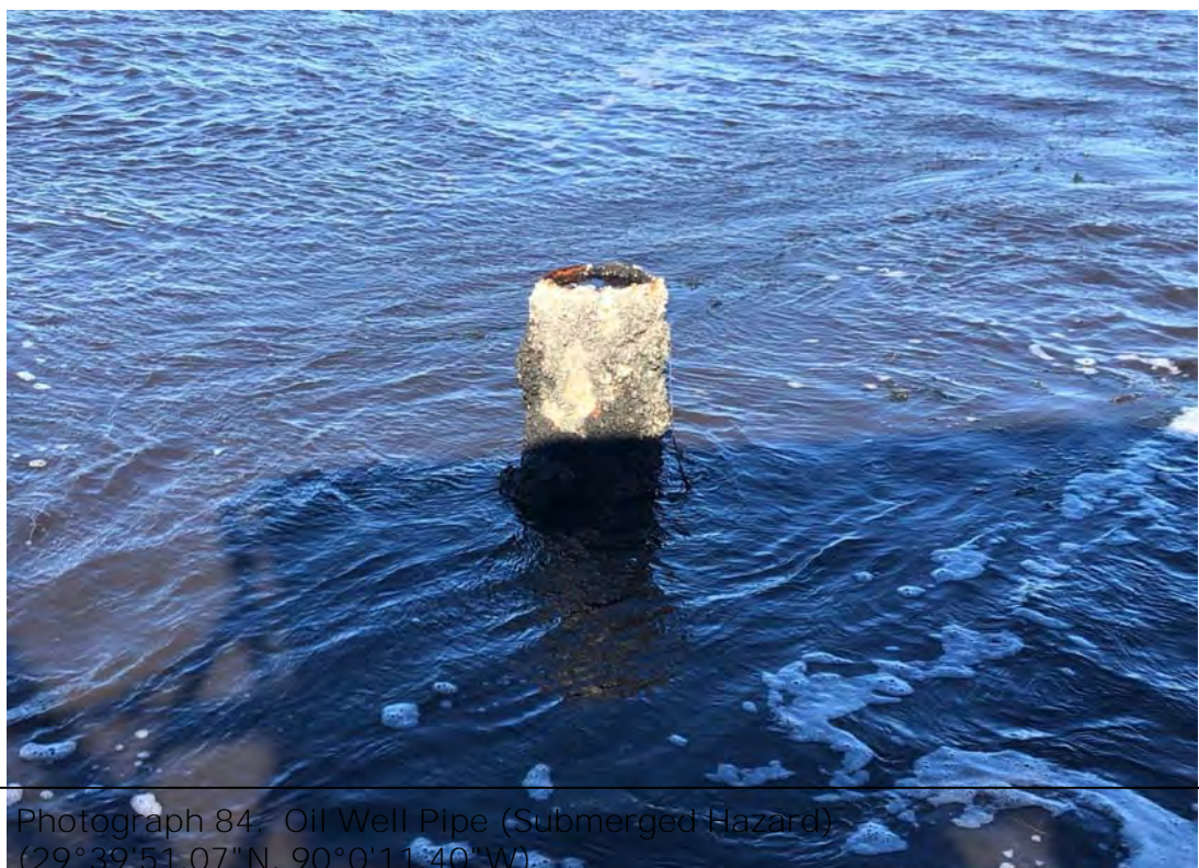
Photograph 84. Oil Well Pipe (Submerged Hazard) (29°39'51.07"N, 90°0'11.40"W)