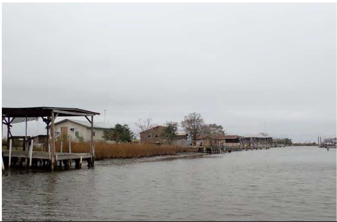
Photograph 119. Site 23: Group of Camps (29°30'31.43"N, 90°1'11.79"W)