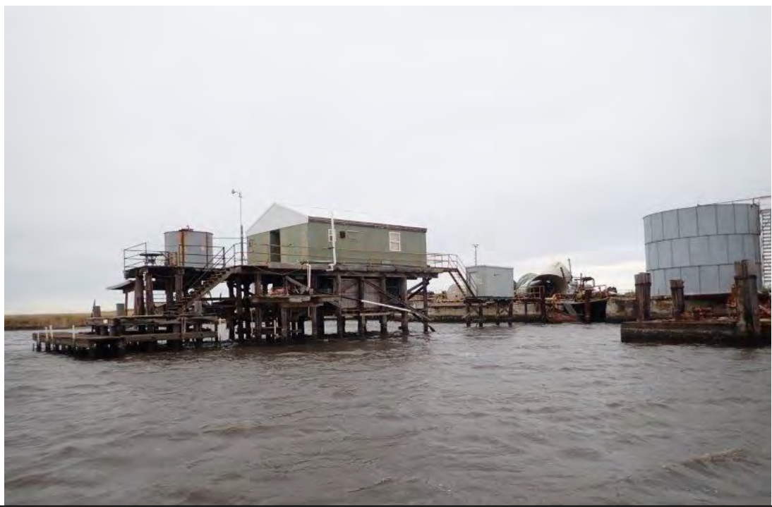
Photograph 115. Site 22: Damaged Oil Field Facility