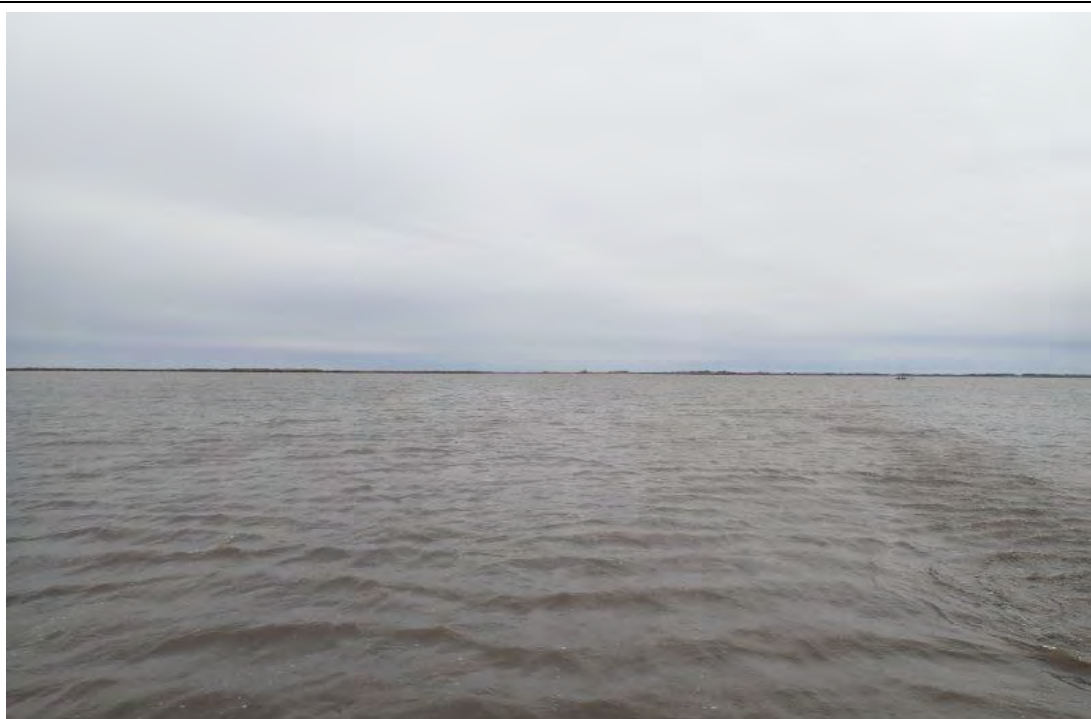
Photograph 55. Overview of Outfall Area 2 Facing South