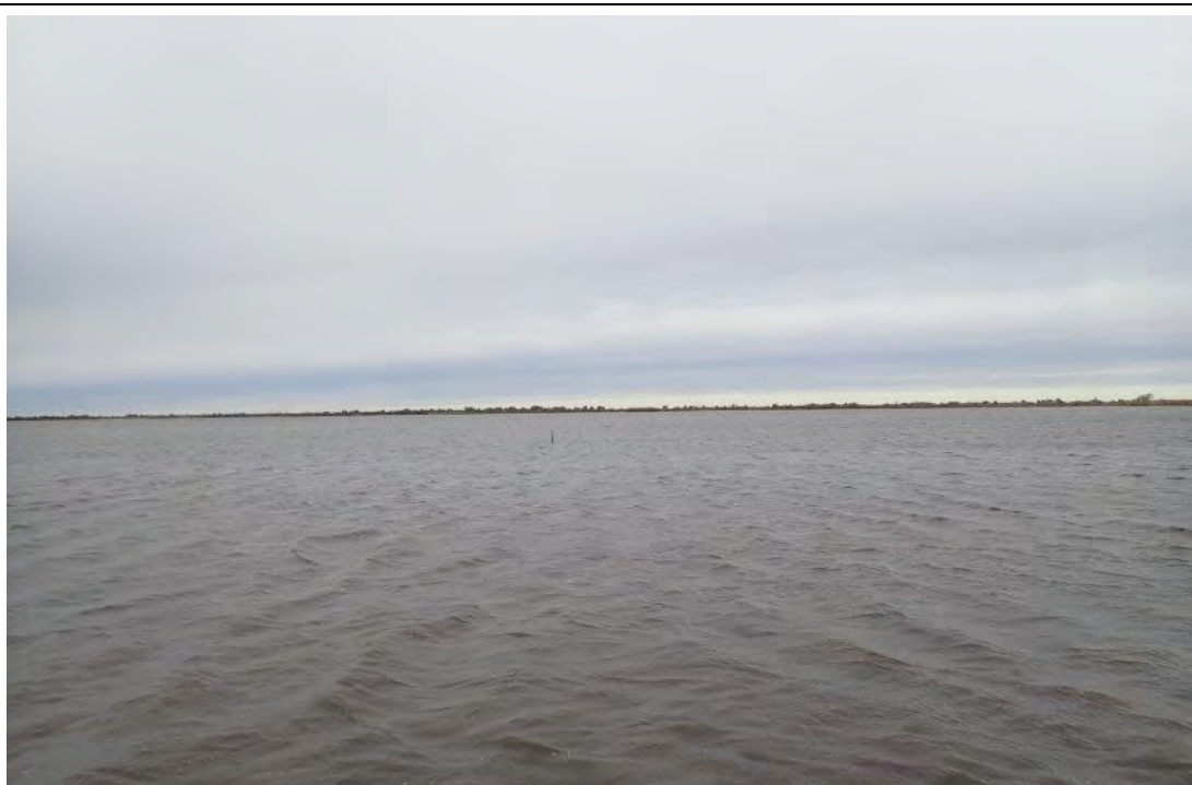
Photograph 56. Overview of Outfall Area 2 Facing West