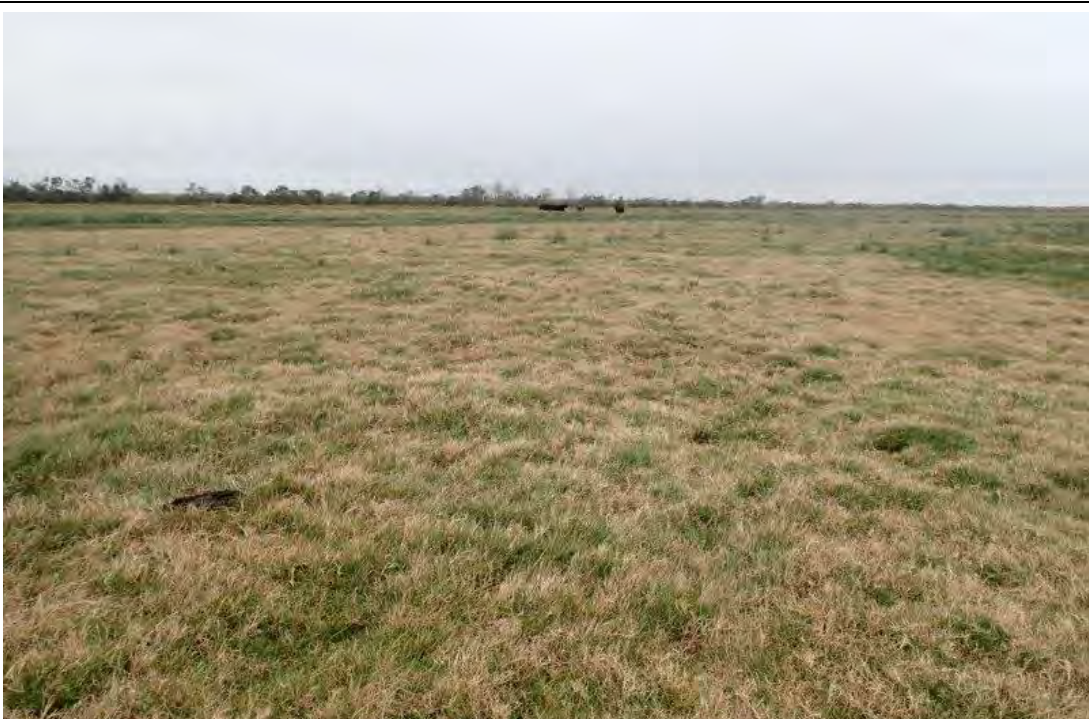
Photograph 43. Overview of Pasture Area 2 Facing South