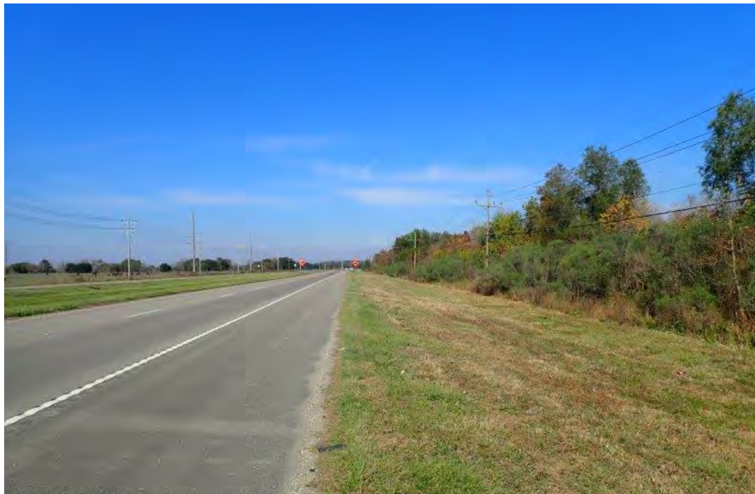
Photograph 25. Overview of Highway Area 1 Facing North (29°39'1.44"N, 89°58'5.58"W)