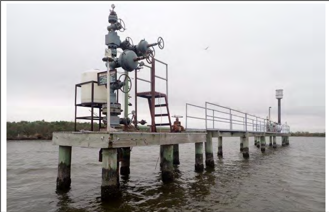
Photograph 139. Site 35: Well Platform with Flare Unit (29°36'40.16"N, 90°3'13.17"W)