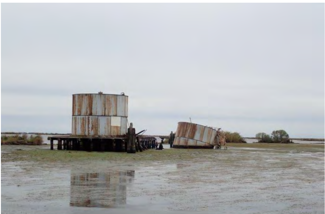
Photograph 86. Site 2: Damaged Oil Field Facility (29°37'7.93"N, 89°59'32.28"W)