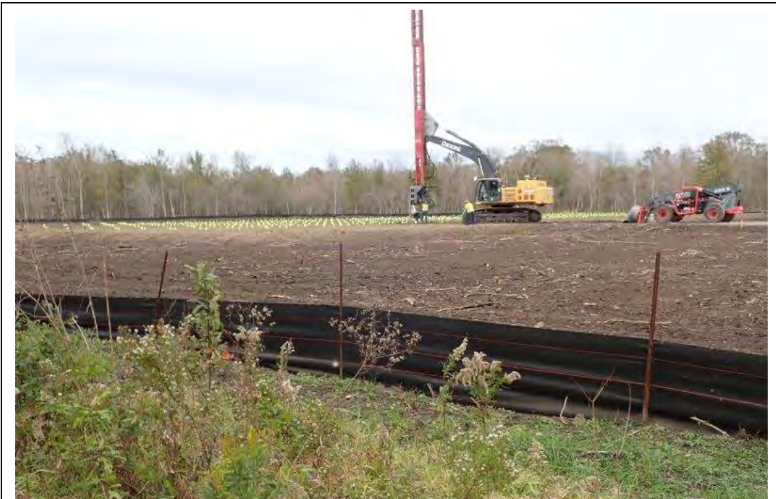
Photograph 21. Overview of Wooded Area 4 Facing North (29°39'22.50"N, 89°58'9.61"W)