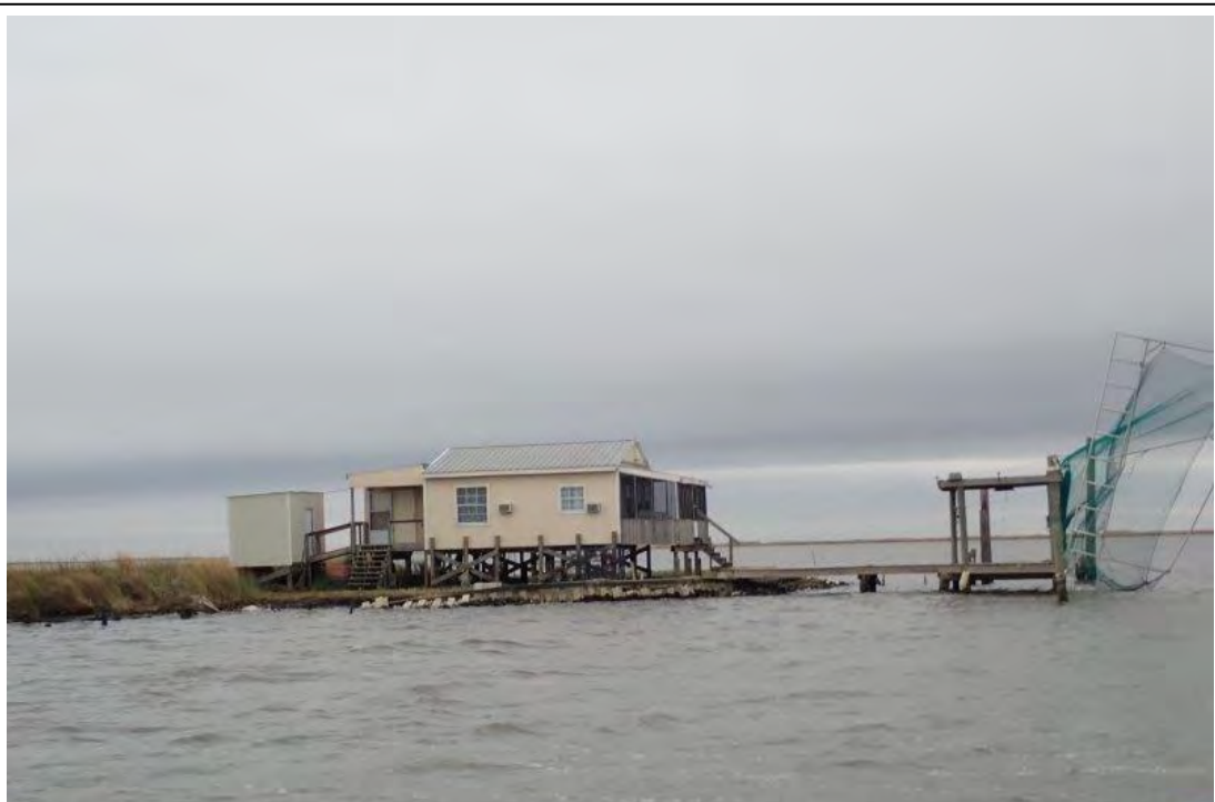
Photograph 124. Site 26: Camp Structures