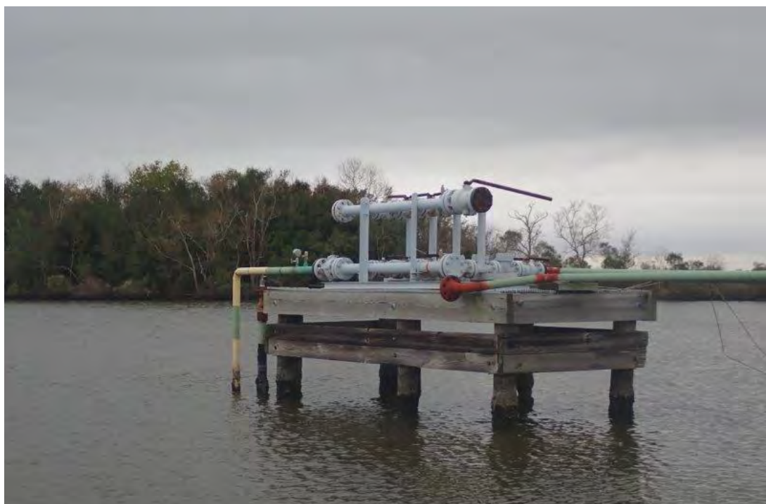
Photograph 146. Site 41: Oil Field Valve Platform (29°35'44.26"N, 90°1'49.46"W)