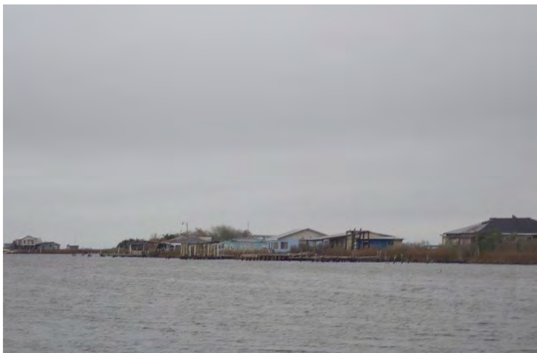
Photograph 112. Site 20: Grouping of Camps (29°32'38.78"N, 90°1'56.68"W)