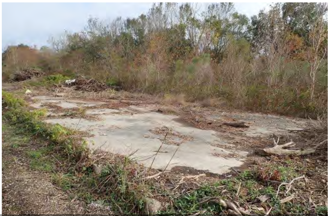
Photograph 75. Concrete Slab (29°39'48.70" N, 89°58'22.97" W)