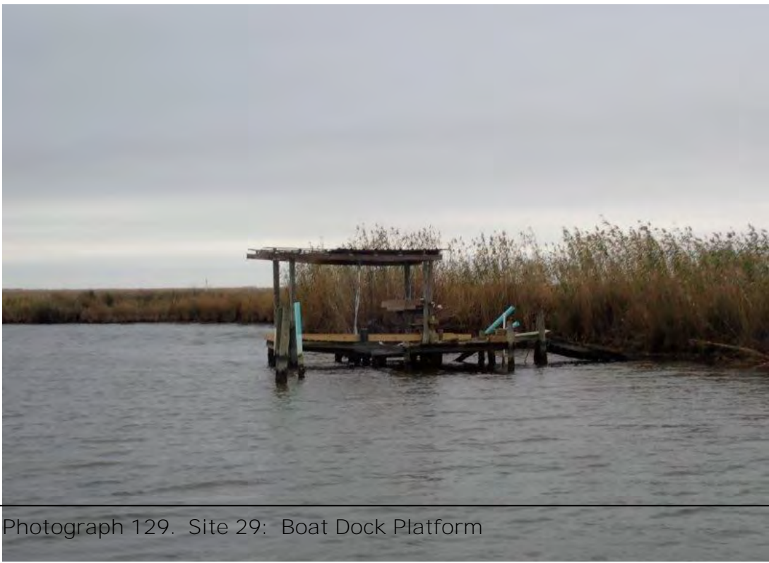
Photograph 129. Site 29: Boat Dock Platform