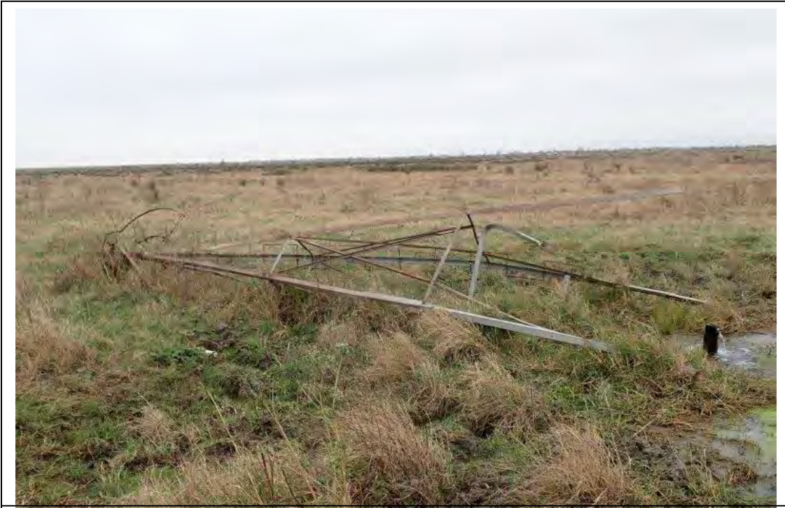
Photograph 81 - Collapsed Windmill with Flowing Water Well (29°39'5.16"N, 89°58'32.10"W)