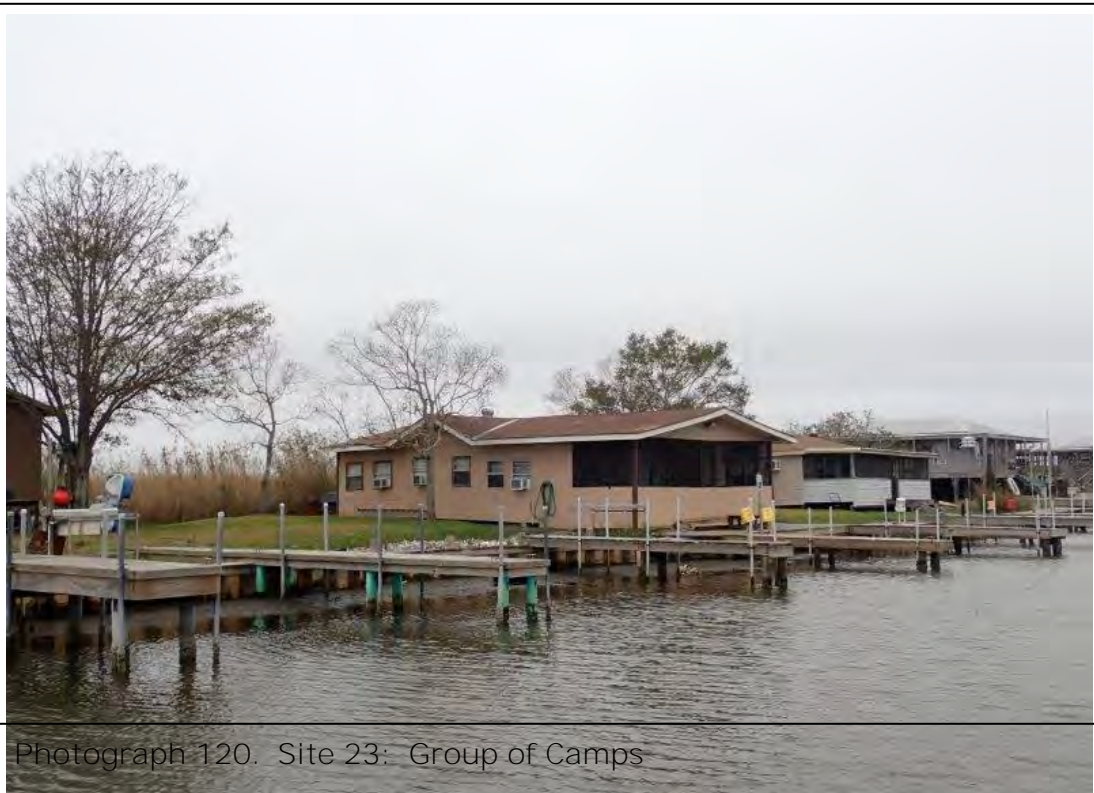
Photograph 120. Site 23: Group of Camps