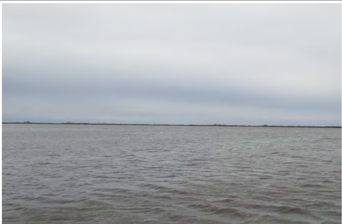
Photograph 51. Overview of Outfall Area 1 Facing South