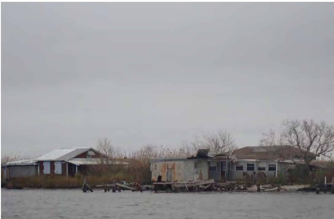
Photograph 113. Site 21: Grouping of Camps (29°33'8.49"N, 90°1'25.49"W)