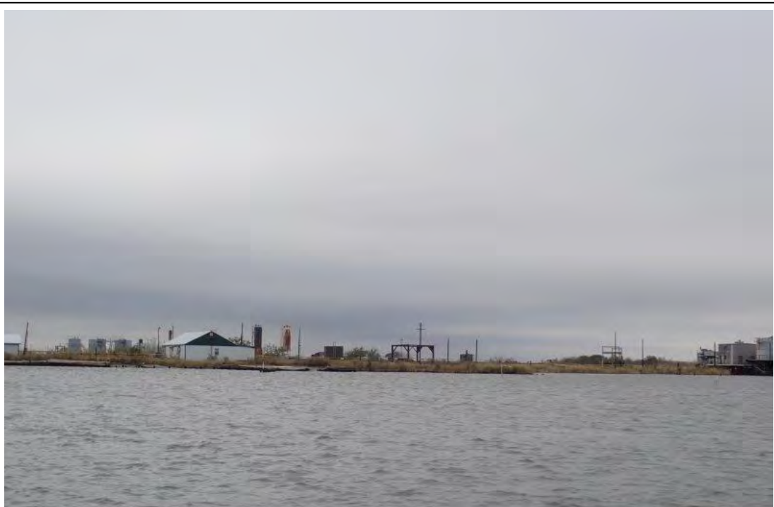
Photograph 136. Site 32: Oil Field Facility Structures