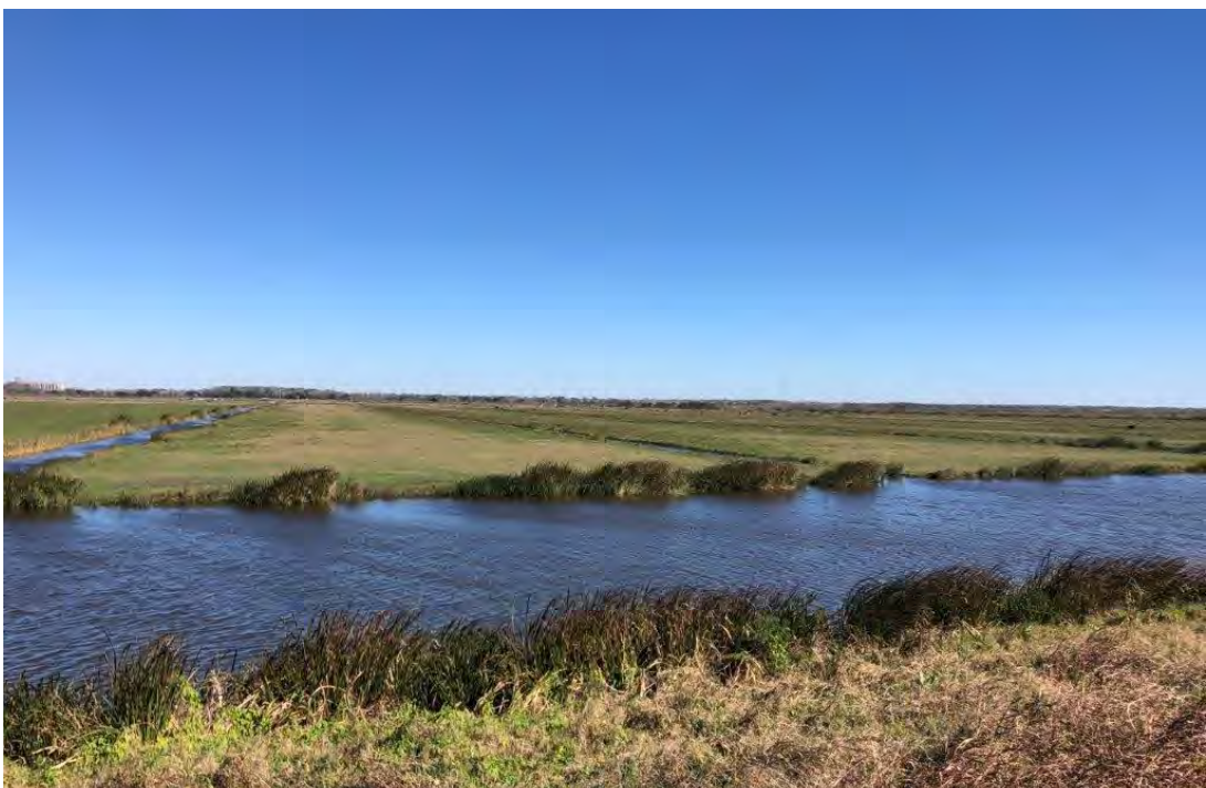
Photograph 46. Overview of Parish Levee Area Facing East