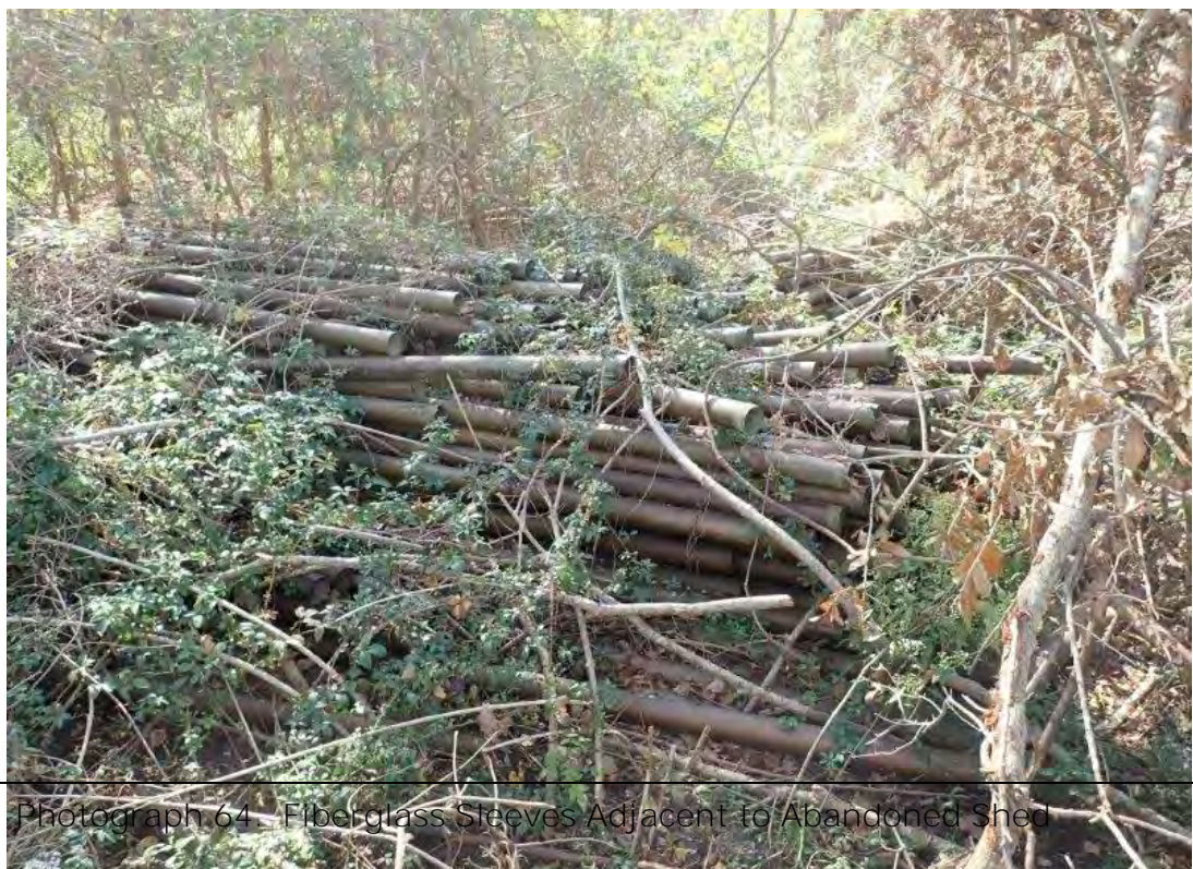
Photograph 64. Fiberglass Sleeves Adjacent to Abandoned Shed