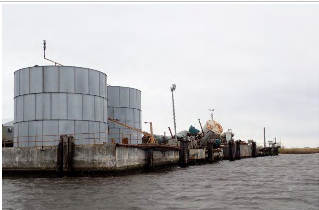
Photograph 116. Site 22: Damaged Oil Field Facility