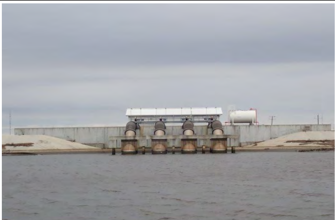
Photograph 92. Site 5: Myrtle Grove Pump Station (29°37'22.64"N, 89°57'20.24"W)