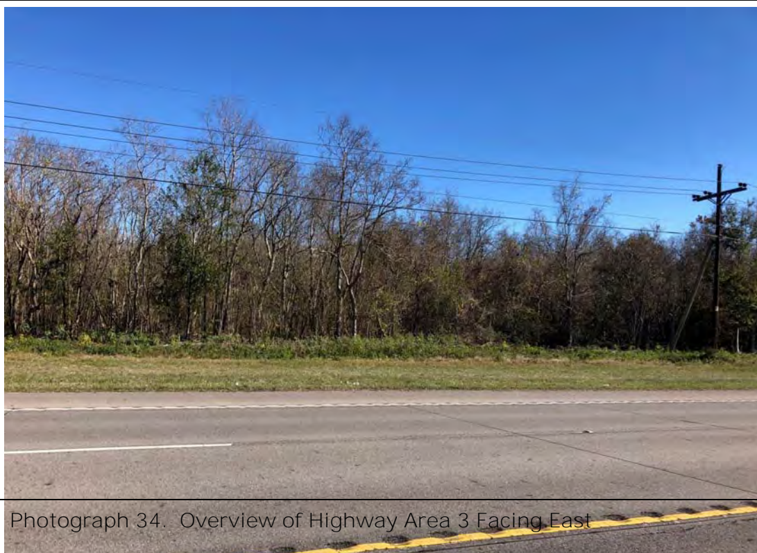
Photograph 34. Overview of Highway Area 3 Facing East