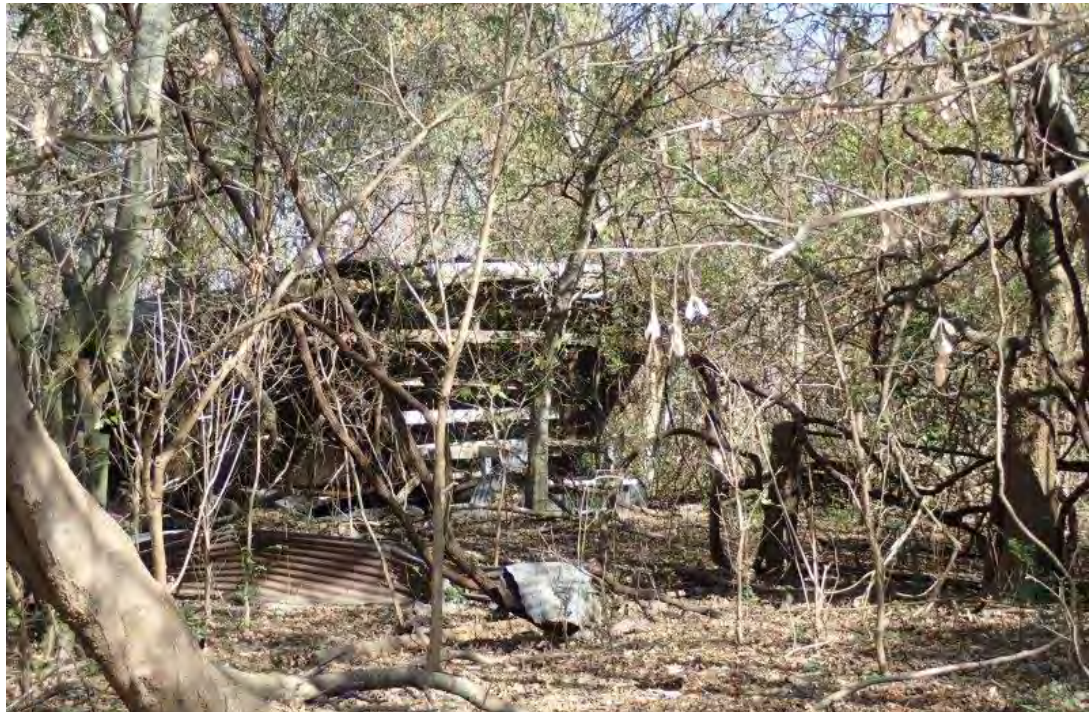
Photograph 65. Abandoned Barn (29°39'49.62"N, 89°57'59.57"W)