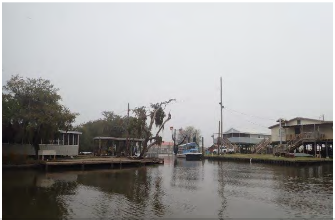
Photograph 97. Site 8: Grouping of Camps Along Lake Hermitage Road