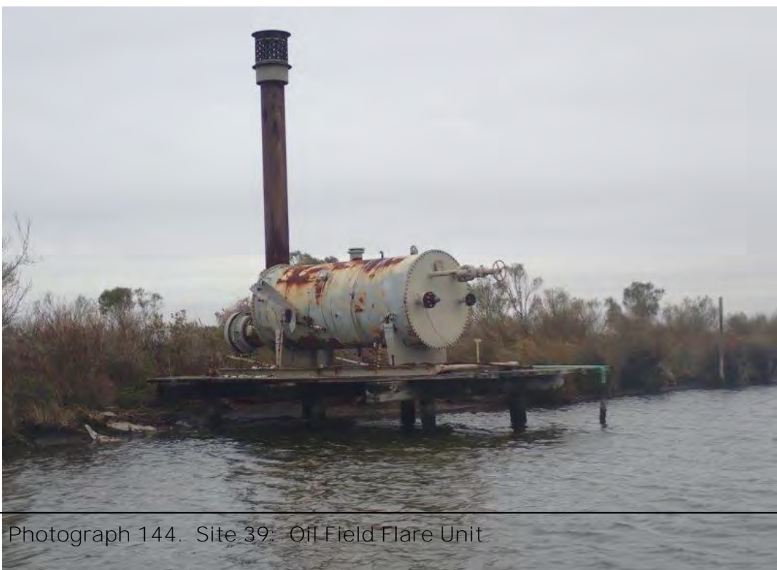
Photograph 144. Site 39: Oil Field Flare Unit