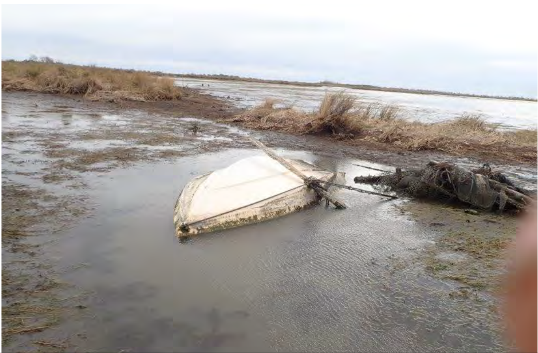
Photograph 85. Site 1: Capsized Boat (29°37'46.83"N, 89°58'59.19"W)