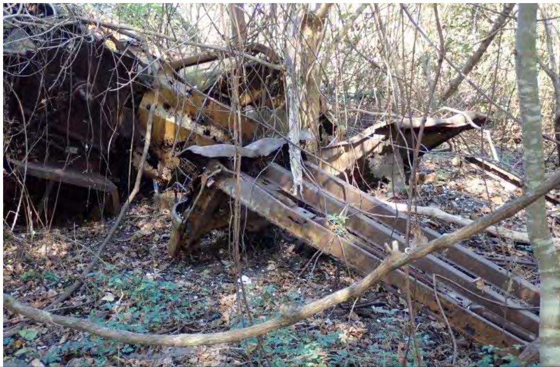
Photograph 73. Metal Waste Pile