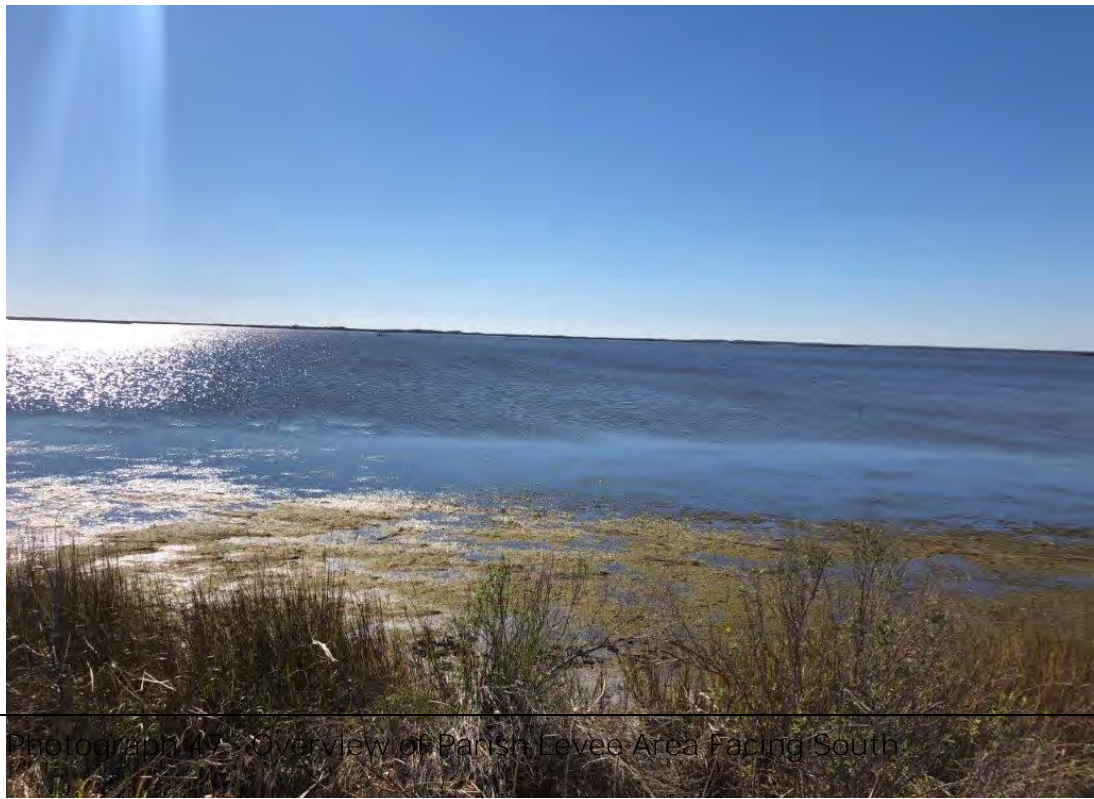
Photograph 47: Overview of Parish Levee Area Facing South