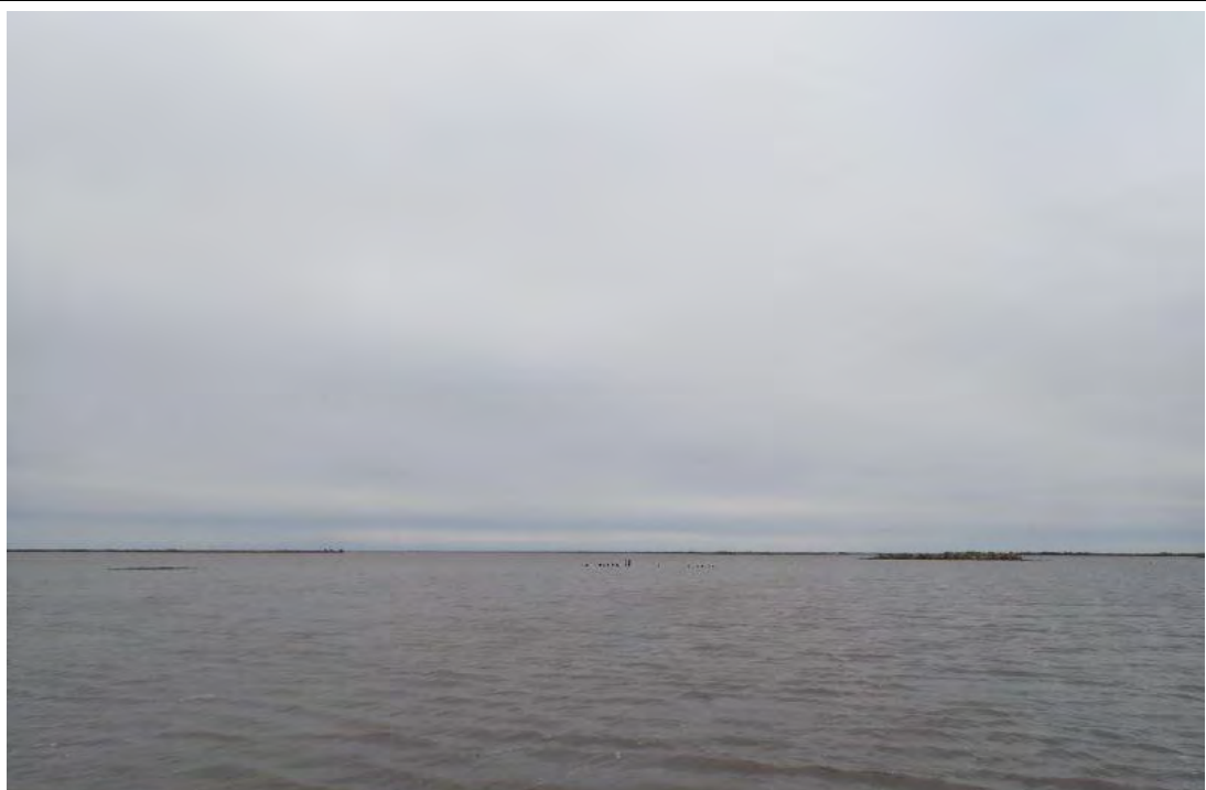
Photograph 59. View from East Access Channel Area 3 Facing Southwest (29°37'27.55"N, 89°59'5.04"W)