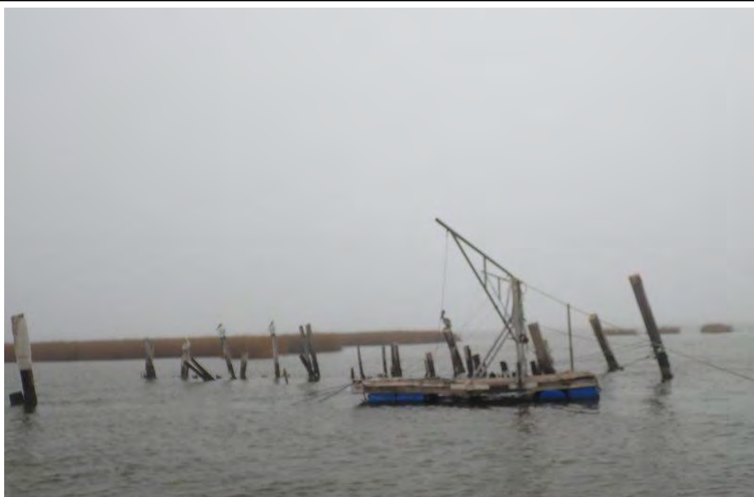
Photograph 106. Site 16: Shrimp Net Platform and Pilings (29°32'12.28"N, 89°54'9.78"W)