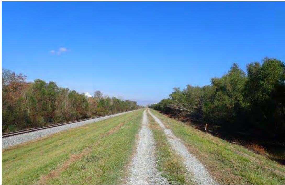
Photograph 1. Overview of Mississippi River Levee Area 1 Facing North (29°39'27.93"N, 89°57'46.68"W)