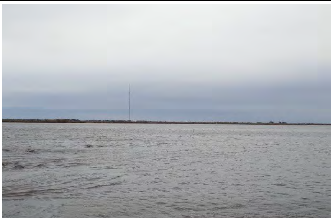
Photograph 52. Overview of Outfall Area 1 Facing West