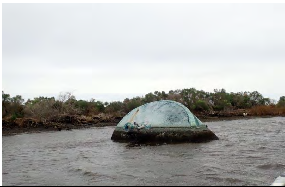
Photograph 117. Site 22: Sunken Tank