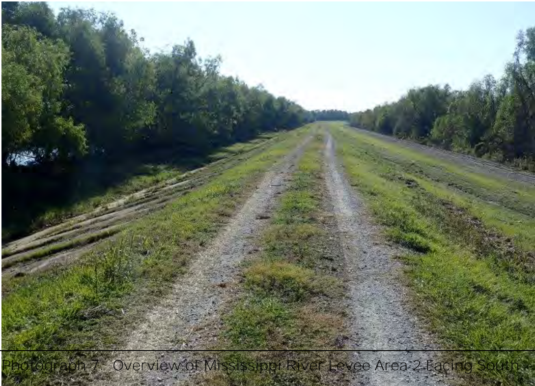
Photograph 7. Overview of Mississippi River Levee Area 2 Facing South