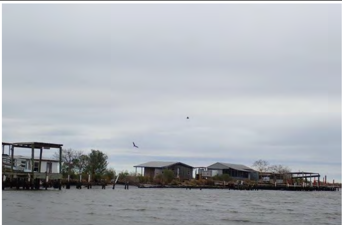
Photograph 94. Site 6: Multiple Camp Structures