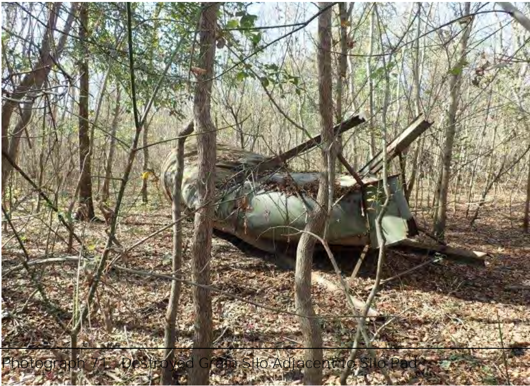
Photograph 71. Destroyed Grain Silo Adjacent to Silo Pad