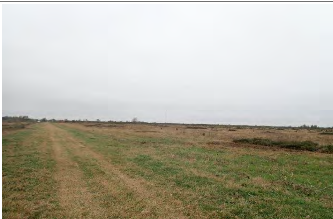
Photograph 39. Overview of Pasture Area 1 Facing South