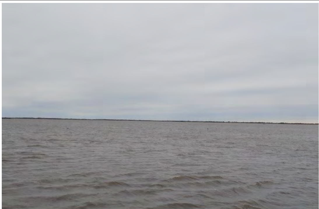
Photograph 50. Overview of Outfall Area 1 Facing East