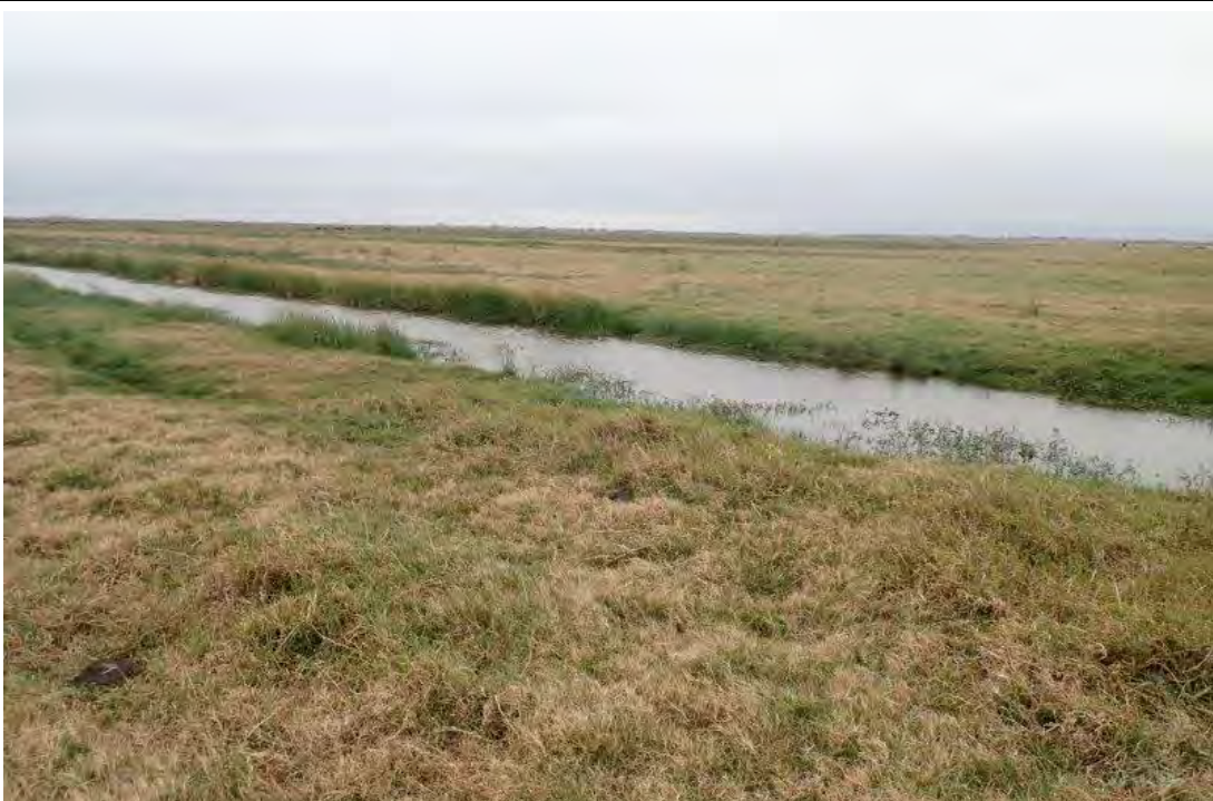
Photograph 44. Overview of Pasture Area 2 Facing West