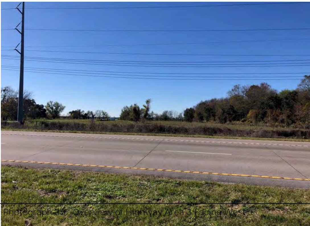
Photograph 36 - Overview of Highway Area 3 Facing West