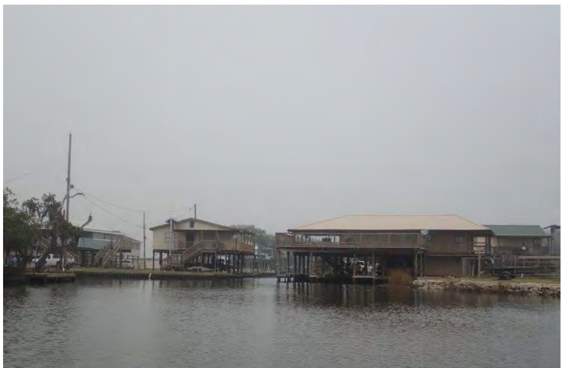
Photograph 96. Site 8: Camps Along Lake Hermitage Road (29°35'36.24"N, 89°54'28.14"W)