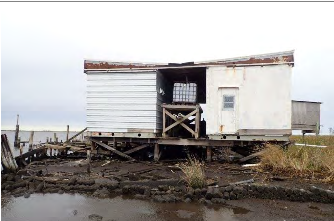
Photograph 90. Site 3: Damaged Camp (29°36'26.76"N, 89°58'46.52"W)