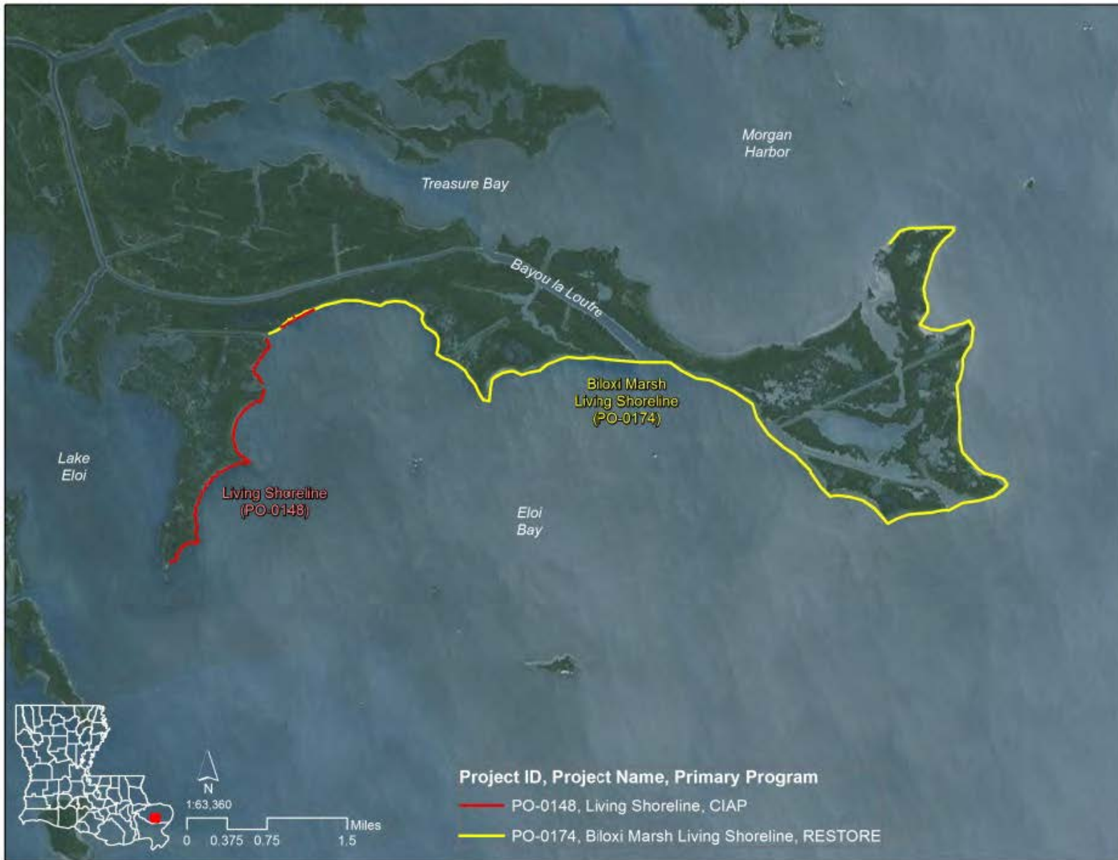
Figure 1. Map showing the Biloxi Marsh Living Shoreline Alternative project area in coastal Louisiana.