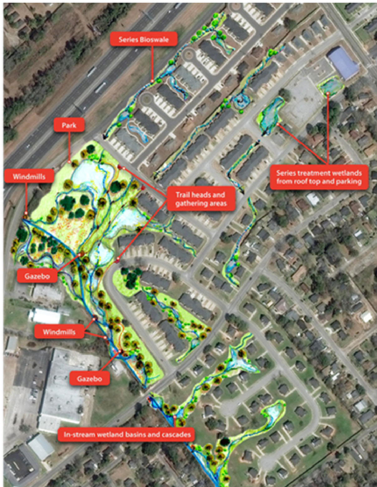
Figure 2. Example of a draft conceptual plan for improving water quality at the headwaters of Toulmins Springs Branch with structural BMPs.