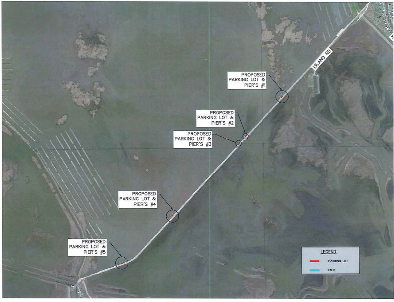
Figure 1. Island Road, Pointe-aux-Chenes Wildlife Management Area project in Terrebonne Parish, LA.