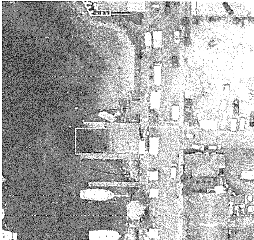
Figure 8. Image of the St. Andrews Marina boat docking facility with the cofferdam (green rectangle) and the turbidity curtain (red arc).