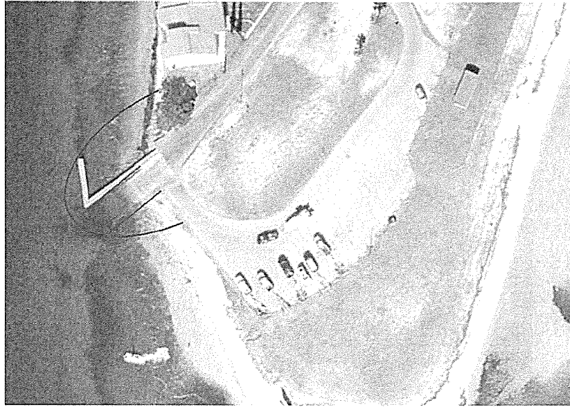
Figure 9. Image of the Earl Gilbert boat ramp with the cofferdam (red open rectangle) and the turbidity curtain (red arc).