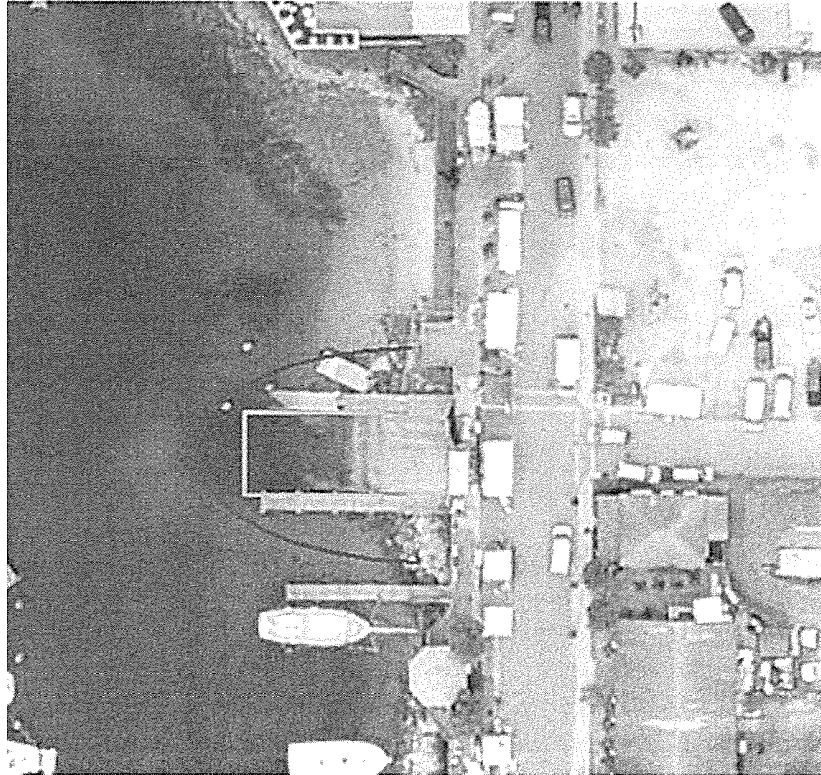
Figure 8. Image of the St. Andrews Marina boat docking facility with the cofferdam (green rectangle) and the turbidity curtain (red arc).