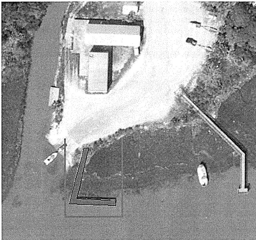
Figure 4. Image of the Waterfront Park improvement site with the dock enhancement (red polygon) and the turbidity curtain (red open rectangle).

encompassing the boat ramp, that is 39.91 ft (12.16 m) by 50.50 ft (15.39 m) resulting in a footprint of 2,015 ft 2 (187.20 m 2 , 0.04625 acre). The action will require the placement of a 165.3 ft (50.38m) long turbidity curtain for the dock renovations, adjacent to the boat ramp, which will encompass the coffer/bladder dam resulting in an area of 4,058 ft 2 (377.00 m 2 , 0.09316 acre) (Figure 3). The project is located in Gulf sturgeon critical habitat Unit 9 (68 FR 13370, March 19, 2003), but it is not in loggerhead critical habitat (79 FR 39855, July 10, 2014). Benthic conditions are a mix of sand and silt. The in-water portion of this work will not exceed 3 months.