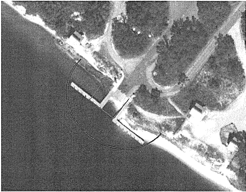
Figure 2. Image of the Big Lagoon State Park boat ramp improvement site with the cofferdam (red open rectangle) and the turbidity curtain (larger red arc).