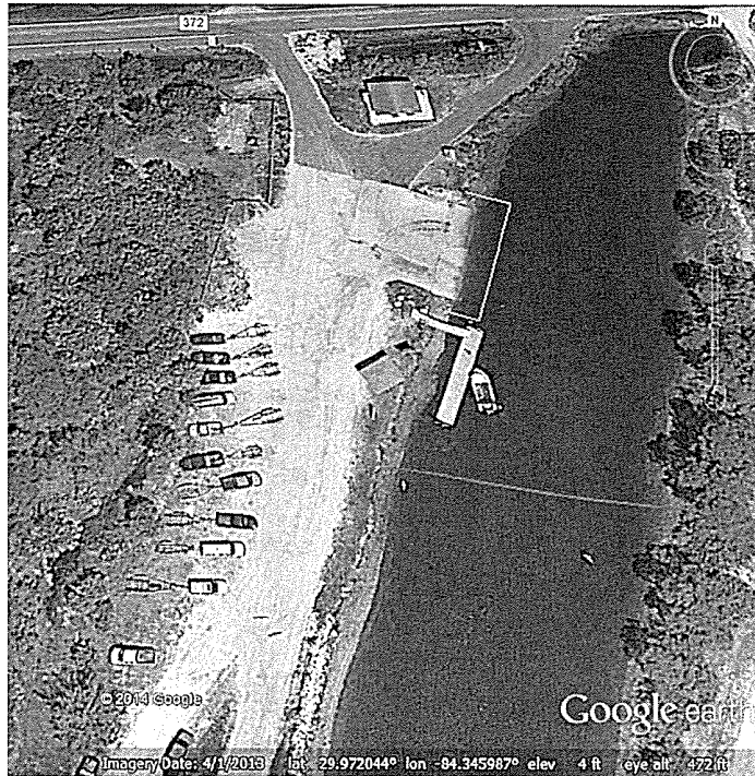
Figure 10. Image of the Mashes Sands Park boat ramp improvement site with the coffer/bladder dam perimeter (white open rectangle) and the turbidity curtain (red line).