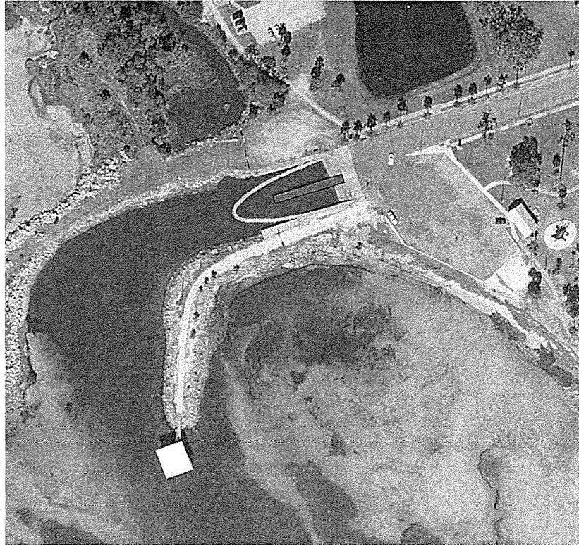
Figure 6. Image of the Frank Pate boat ramp improvement site with the dock enhancement (red polygon) and the turbidity curtain (green arc).