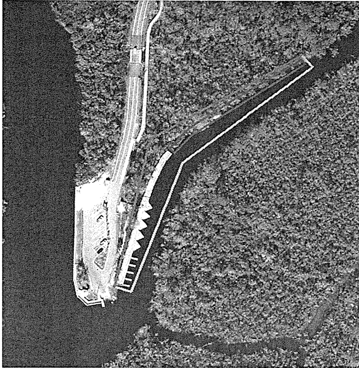
Figure 7. Image of the Lafayette Creek boat dock expansion (red polygon) and the turbidity curtain (green).