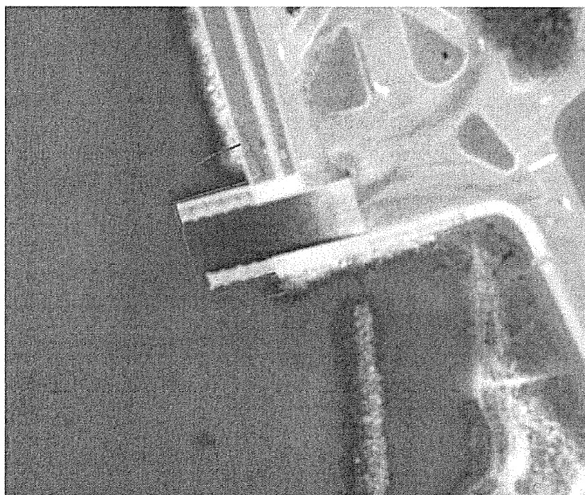
Figure 3. Image of the Gulf Breeze Wayside Park boat ramp improvement site with the cofferdam (red open rectangle) and the turbidity curtain (red arc). (©2014, C. Robertson, FL DEP)

The project is located in Pensacola Bay, Escambia County, Florida, at 30.3116°N, 87.4219°W (Figures 1 and 2). The site consists of a 2-lane boat ramp, although only 1 lane is currently being used. The project renovation will reconfigure the area, so that 2 boats can be removed/launched at the same time, which will require excavation in an area of approximately 100 square meters (m 2 ) or 1,076 square feet (ft 2 ), of which only a small portion will be in the subtidal area. The project involves a coffer/bladder dam encompassing the boat ramp that is 51.7 feet (ft) (15.75 meter [m]) by 63.1 ft (19.23 m) with a resulting footprint of 3,261 ft 2 (302.96 square meters [m 2 ], 0.07486 acre). The action will require the placement of a 340.9 ft (103.91 m) long turbidity curtain for the adjacent dock renovations which will encompass the coffer/bladder dam resulting in an area of 18,438 ft 2 (1,712.95 m 2 , 0.42327 acre) (Figure 2). The project is located in Gulf sturgeon critical habitat Unit 9 (68 FR 13370, March 19, 2003), but it is not in loggerhead critical habitat (79 FR 39855, July 10, 2014). Benthic conditions are a mix of silt, mud, and sand. The in-water work will not exceed 3 months.