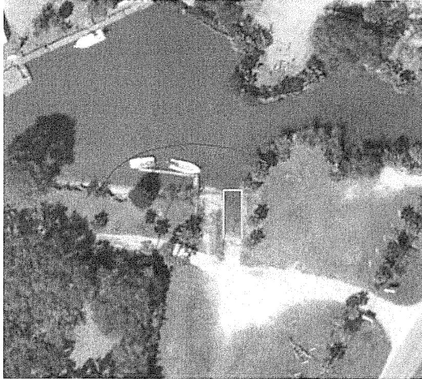
Figure 5. Image of the Indian Creek Park boat ramp improvement site with the cofferdam (green rectangle) and the turbidity curtain (red arc).

loggerhead critical habitat (79 FR 39855, July 10, 2014). Benthic conditions are a mix of silt and clay. The in-water portion of this work will not exceed 3 months.