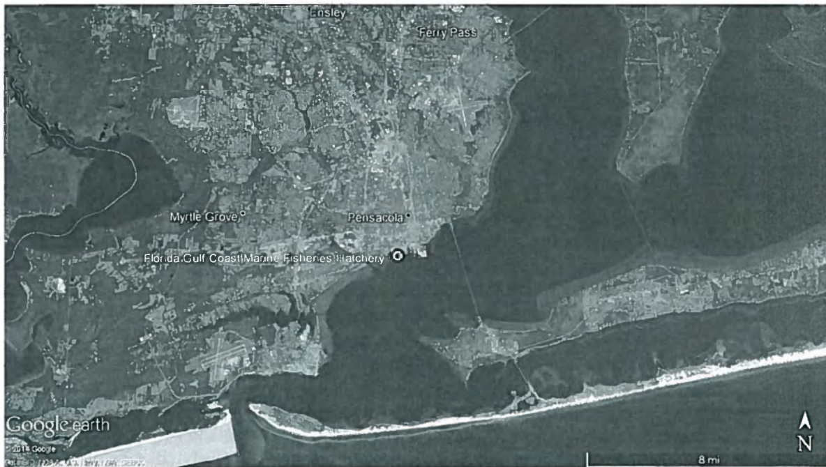
Figure 1. Image of the proposed project area, indicated by the yellow dot within Pensacola Bay; Gulf sturgeon critical habitat Unit 9 - Pensacola Bay (red polygon); and proposed loggerhead critical habitat Unit LOGG-N-33 (pink polygon).

may lie anywhere within a 630-ft-wide (192-m) by 1076-ft-long (328-m) rectangle having an approximate area of 673,367 ft 2 (62,558 m 2 , 15.5 acre) in the inter- and sub-tidal zone within Pensacola Bay. The project is located within Gulf sturgeon critical habitat Unit 9 (68 FR 13370, March 19, 2003) and is approximately 8.7 miles (mi) (14.1 kilometers [km] or 7.6 nautical miles [NM]) northeast of proposed loggerhead critical habitat LOGG-N-33 (78 FR 43005, July 18, 2013).