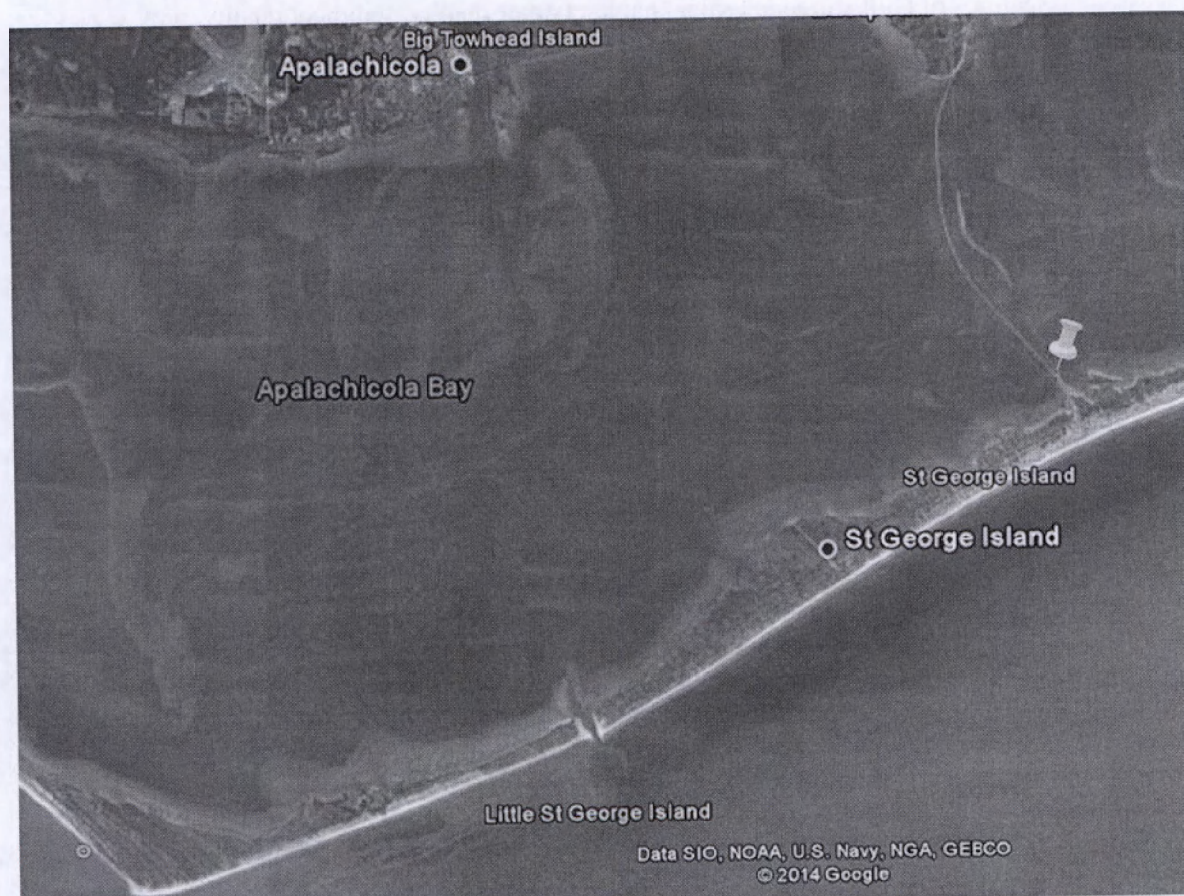
Figure 1. Image showing the project location

The construction work will mainly take place using heavy equipment located in upland areas. Best management practices for erosion control associated with the bulkhead work will be implemented and maintained at all times during construction. The entire project area will be enclosed by an in-water turbidity barrier that will be secured to shore. The in-water use of silt curtains and the possible dewatering of work areas will further help limit the scope, nature, and extent, of any turbidity impacts. The applicant will implement and adhere to NMFS's Sea Turtle and Smalltooth Sawfish Construction Conditions , dated March 23, 2006. It is anticipated construction activities will be completed in 1 year.