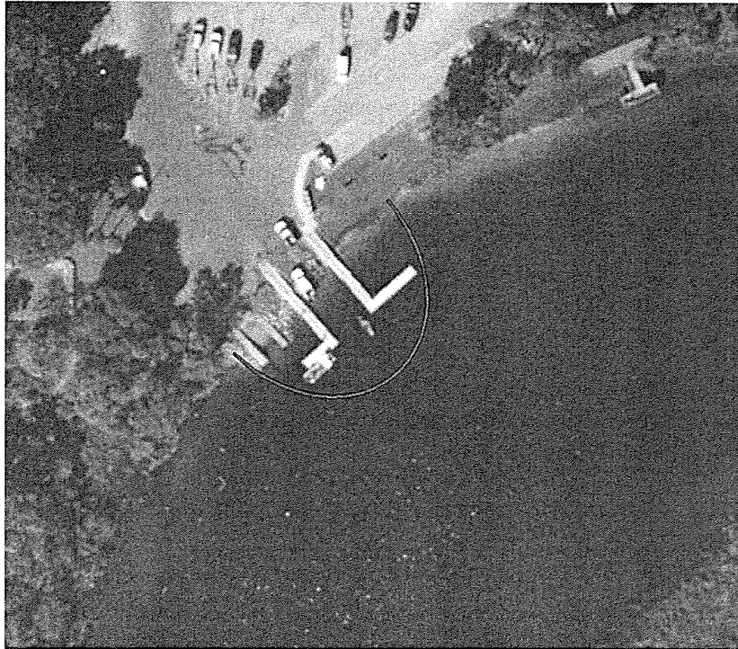
Figure 11. Image of the St. Marks Boat ramp improvement site with the turbidity curtain (red arc).