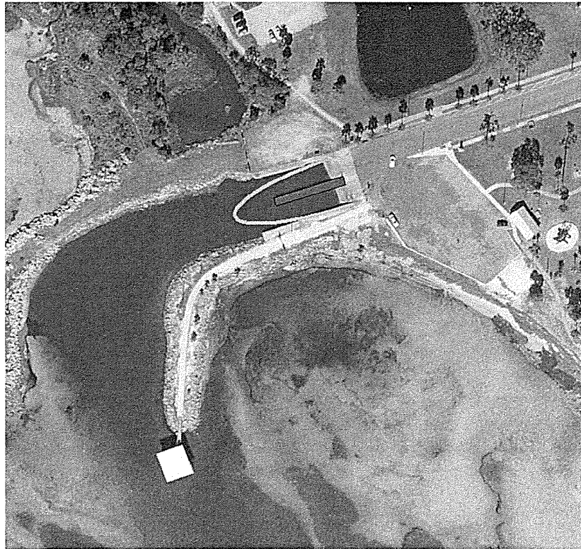
Figure 6. Image of the Frank Pate boat ramp improvement site with the dock enhancement (red polygon) and the turbidity curtain (green arc).