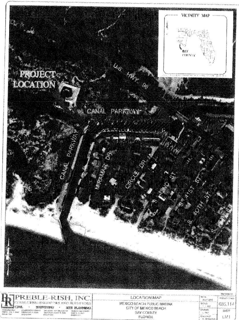
Figure 2. Project details for City of Mexico Beach Marina action