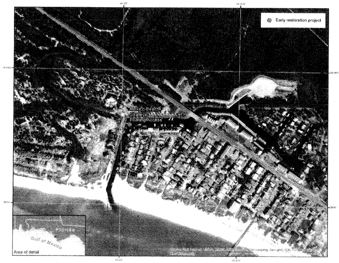
Figure 1. Location of proposed City of Mexico Beach Marina action