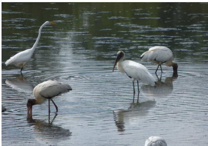
Wading birds

An automatic gate on the Cuddo Unit controls hours of access to minimize disturbance to wildlife during critical periods. Current visitor use hours are posted at the entrance gate or may be obtained by contacting the refuge office. Visitor access on portions of the refuge is limited seasonally as a migratory bird sanctuary; please abide by all closure signs on the refuge.