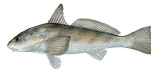
Southern Kingfish (Whiting)