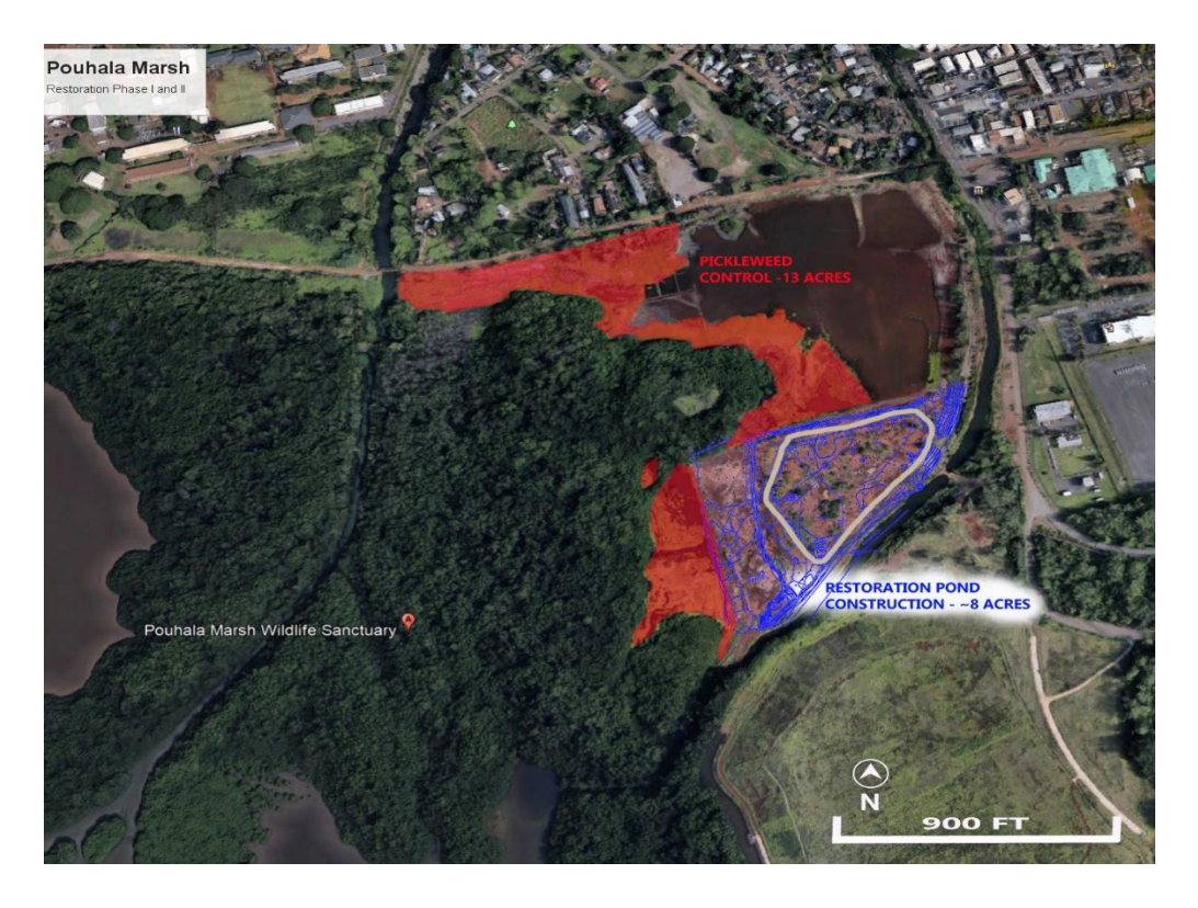
Figure 3: Restoration Phase II, Project Site

Current waterbird inventories and monitoring surveys have identified the most productive areas to be the Waikele and Main Pond areas of Pouhala Marsh. Within these areas, pickle-weed is the dominant vegetation. If controlled, while not the most desirable alternative, pickle-weed provides adequate habitat for the waterbird species. To control pickle-weed, a mechanized, amphibious machine is needed for large, landscape areas and these machines have been used successfully at other wildlife sanctuaries in Hawaii.