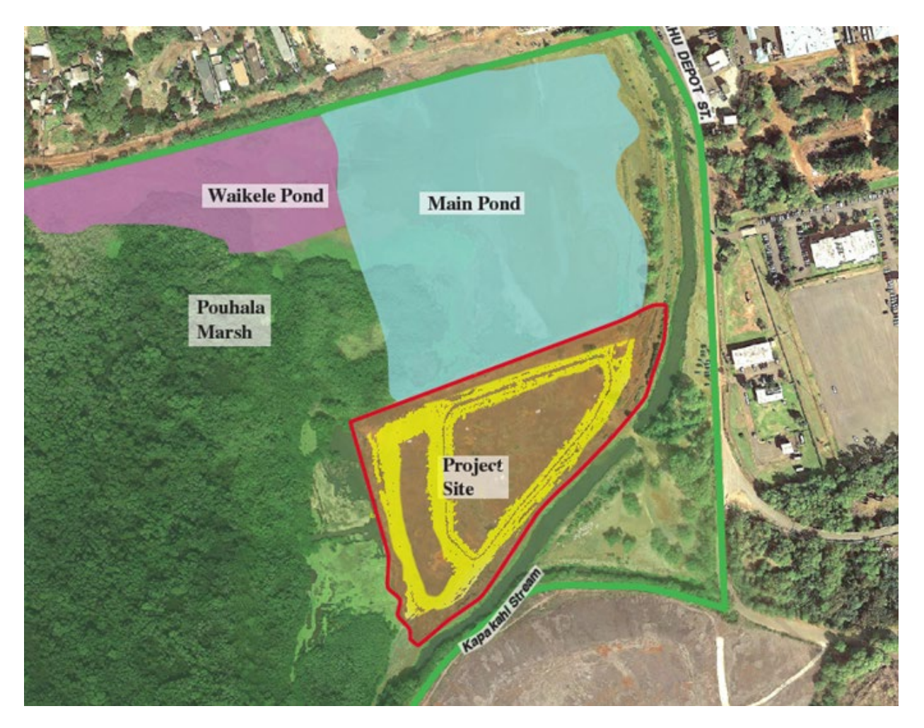
Figure 2: Restoration Phase I, Project Site

This project would finalize the planning and permitting and fund the construction of a restoration pond. The pond is slated to create 8 acres of waterbird habitat in an area that does not currently function as a wetland or support waterbirds.